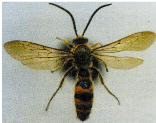
Fig: An adult male scoliid wasp Campsomeriella (Annulimeris) annulata (Fabricius)