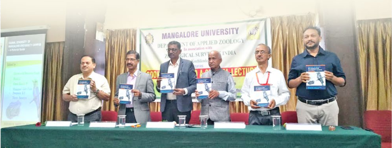
‘Faunal diversity of Mangalore University’ book release