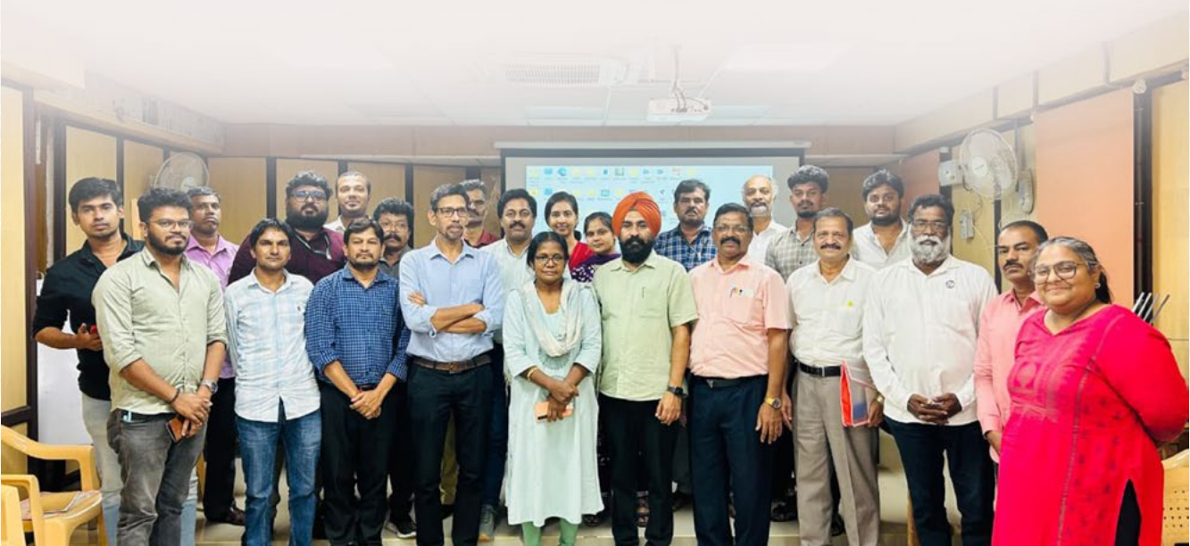
Rashtriya Karmayogi Training Programme at the centre