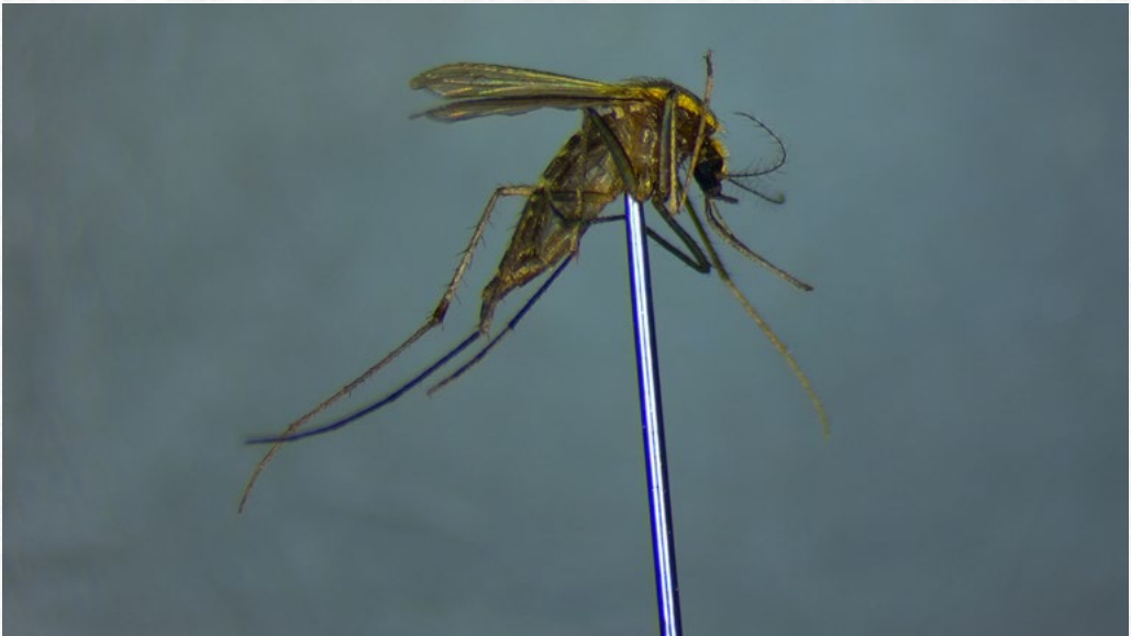
Aedes lineatopennis (Ludlow, 1905)