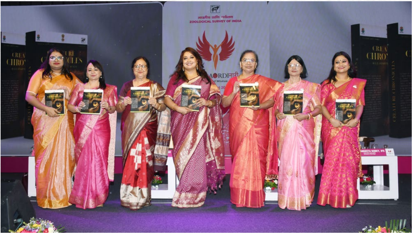
Release of the Book – “Creature Chronicles-Wild Hearts, Wise Minds”