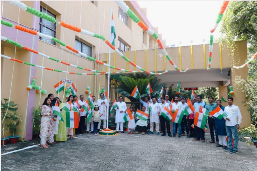
Independence Day Celebrations on 15 th August 2025

A total of 81 species of faunal communities belonging to Protozoa, Insecta, Mollusca, and Pisces were identified during this month. The 79 th Independence Day was celebrated. Officers and staff of the centre took the Sports Day Pledge on 29 th August 2025. Officers and staff of the centre attended one day training program on 'Rashtriya Karmayogi Large Scale Jan Seva Programme'.