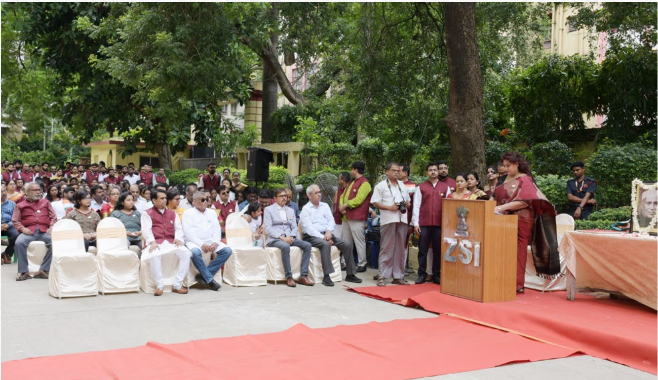
Independence Day speech by Director ZSI