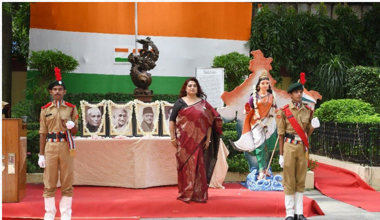
Glimpses of Independence Day celebration