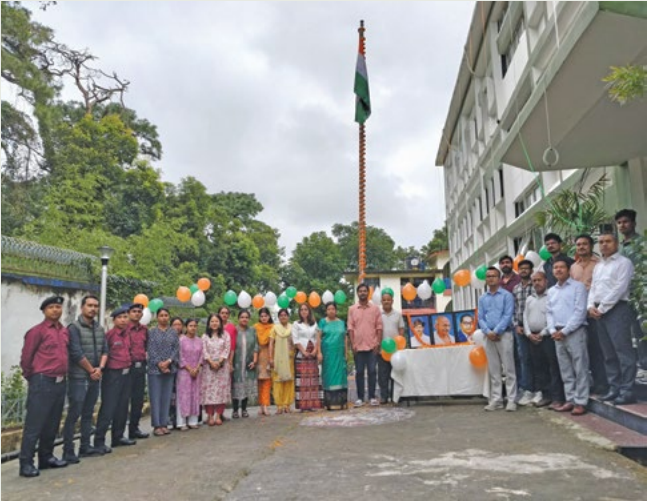
Celebration of Independence Day in the office

A total of 66 species of faunal communities belonging to Hemiptera, Orthoptera, Odonata, Araneae, Amphibia, and Pisces were identified. Scientists of the centre rendered Identification and Advisory service to three different institutions. ‘ Har Ghar Tiranga ’ campaign was organized among the office staff on 13 th August by distributing National Flag and uploading selfies with the national flag. The 79 th Independence Day was celebrated at the centre on 15 th August 2025. Officers and staffs of the centre took the National Sports Day Pledge on 29 th August 2025. Officers and staff of the centre attended one day training program on ‘ Rashtriya Karmayogi Large Scale Jan Seva Programme ’.