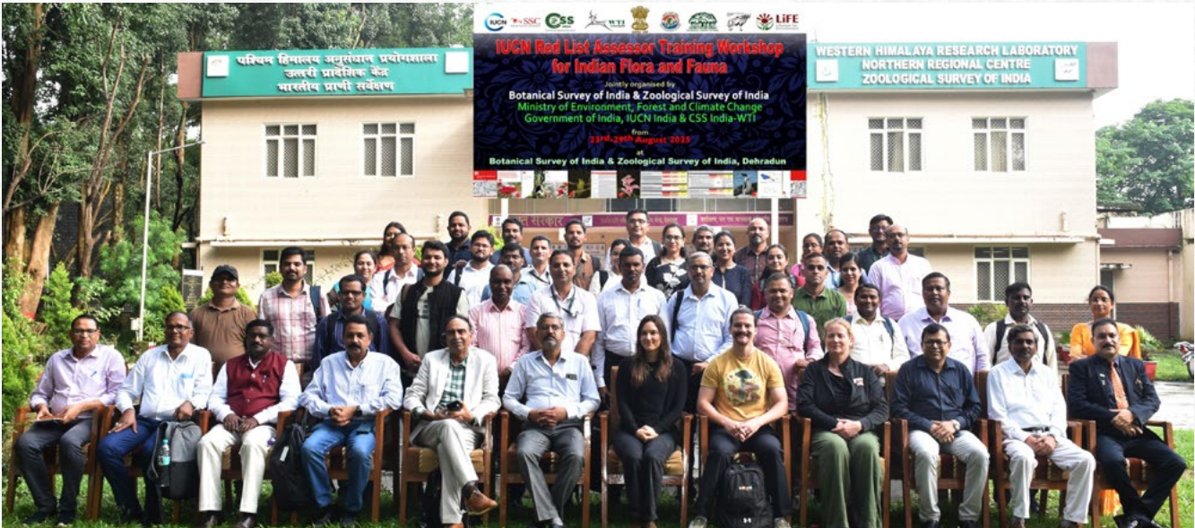
Group photo of Participants of 3 rd Batch of IUCN Red List Assessor Training Workshop from 23 rd to 29 th August 2025