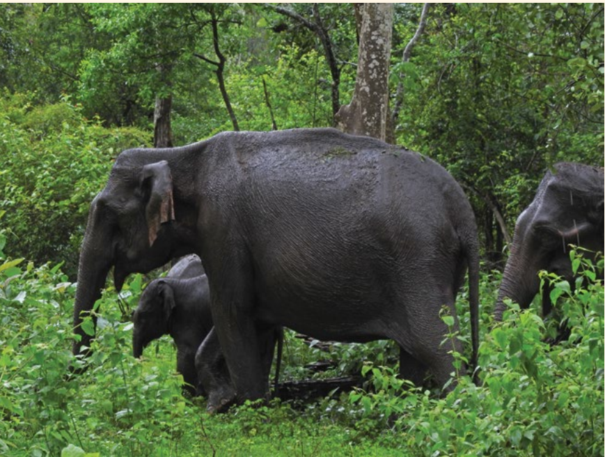
Asian Elephant Elephas maximus Linnaeus, 1758

A survey tour was conducted to Odisha. A total of 748 specimens belonging to 131 species of fauna belonging to Crustacea, Ephemeroptera, Hemiptera, Lepidoptera, Odonata, Psocoptera, Mollusca, Amphibia, Aves, and Zooplankton were identified. The 79 th Independence Day was celebrated at the centre. Officers and staff of the centre attended one day training program on ‘Rashtriya Karmayogi Large Scale Jan Seva Programme’.