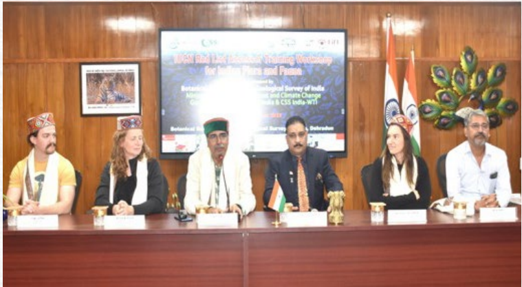
A Glimpse of IUCN Red List Assessor Training Workshop held at BSI/ZSI, NRC, Dehradun