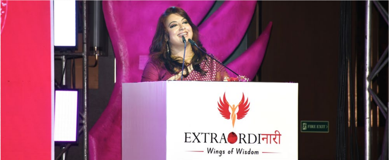
Glimpse of the speech of Director,ZSI during “Extraordinary- Wings of Wisdom”