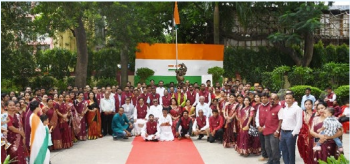
Director with the Scientists and Staff of ZSI