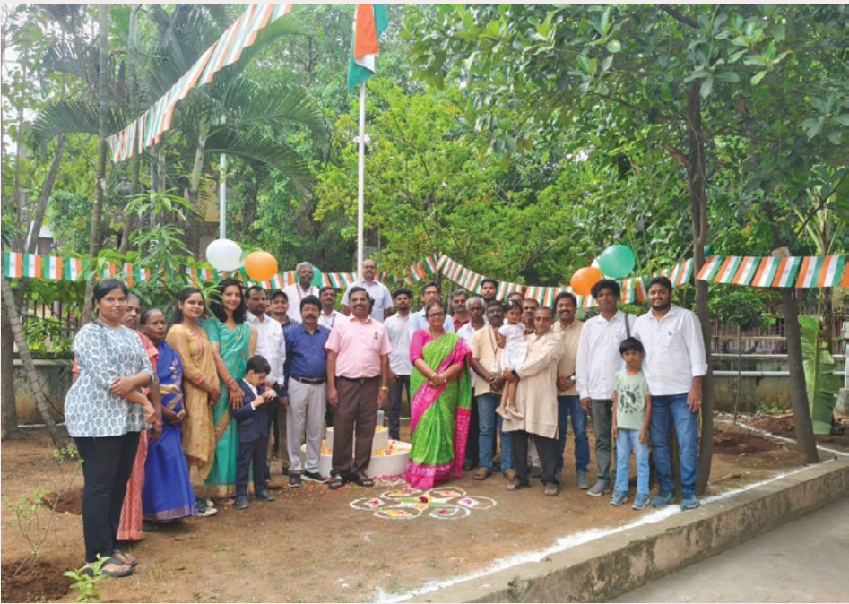
Independence Day celebration

A survey tour was conducted to Andaman and Nicobar Islands from 25 th to 30 th August 2025. A total of 35 species of different faunal communities were identified during this month. The 79 th Independence Day was celebrated. Officers and staff of the centre attended one day training program on 'Rashtriya Karmayogi Large Scale Jan Seva Programme'.