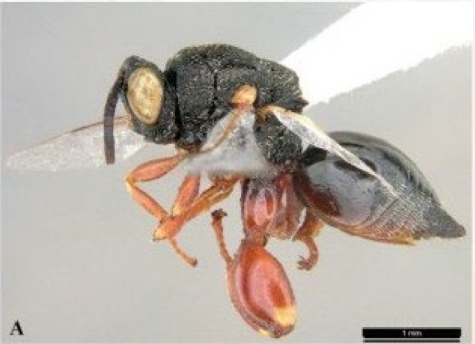
Brachymeria discreta Gahan, 1942