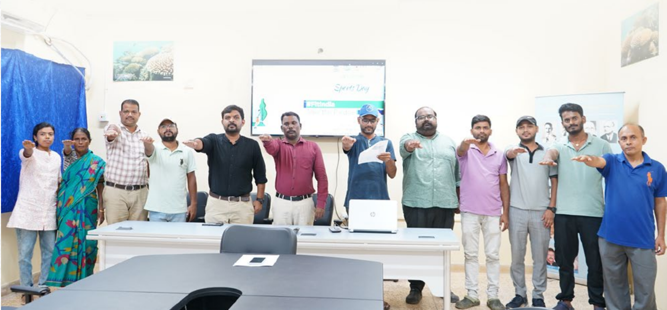
Pledge taking on National Sports Day

Local survey tour was conducted to Bichitrapur mangrove and Hospital ghat area, Digha, West Bengal on 1 st and 11 th August 2025. A total of 29 species of faunal communities belonging to Mollusca, crustacea, and Nematoda were identified. A total of seven Identification and Advisory Services were rendered to different institutions. All scientists and staff members attended ‘Rashtriya Karmayogi iGOT a Large-Scale Jan Seva Training Programme’ on 13 th August 2025. A total of 2505 visitors visited the museum of the centre.