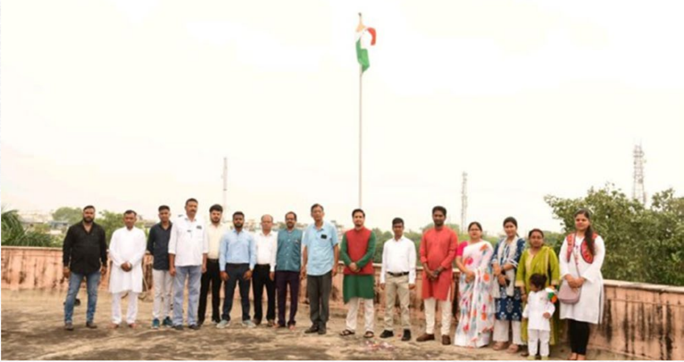
Celebration of 79 th Independence Day on 15 th August 2025

was celebrated by the centre, and all officers and staff of the centre participated in the "Har Ghar Tiranga Campaign". Officers and staff of the centre attended one day training program on 'Rashtriya Karmayogi Large Scale Jan Seva Programme'.