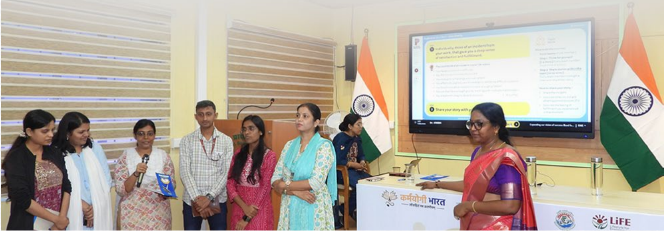
Rashtriya Karmayogi Training

advisory services were rendered to four different institutions, and six manuscripts were reviewed by the scientists of the centre during this month. A total of ten DNA barcodes were submitted to NCBI. A total of 255 visitors, including students from various educational institutions, visited the museum of the centre. The 79 th Independence Day of India was celebrated at the centre, and all officers and staff of the centre participated in the “ Har Ghar Tiranga Campaign ” on 14 th August 2025. Officers and staff of the centre attended one day training program on ‘ Rashtriya Karmayogi Large Scale Jan Seva Programme ’.