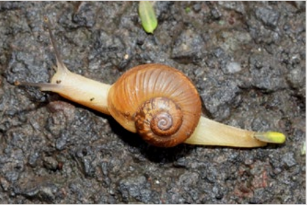
Terrestrial snail, Ariophanta ammonia (Deshayes, 1850)

advisory services were rendered to four different institutions, and six manuscripts were reviewed by the scientists of the centre during this month. A total of ten DNA barcodes were submitted to NCBI. A total of 255 visitors, including students from various educational institutions, visited the museum of the centre. The 79 th Independence Day of India was celebrated at the centre, and all officers and staff of the centre participated in the “ Har Ghar Tiranga Campaign ” on 14 th August 2025. Officers and staff of the centre attended one day training program on ‘ Rashtriya Karmayogi Large Scale Jan Seva Programme ’.