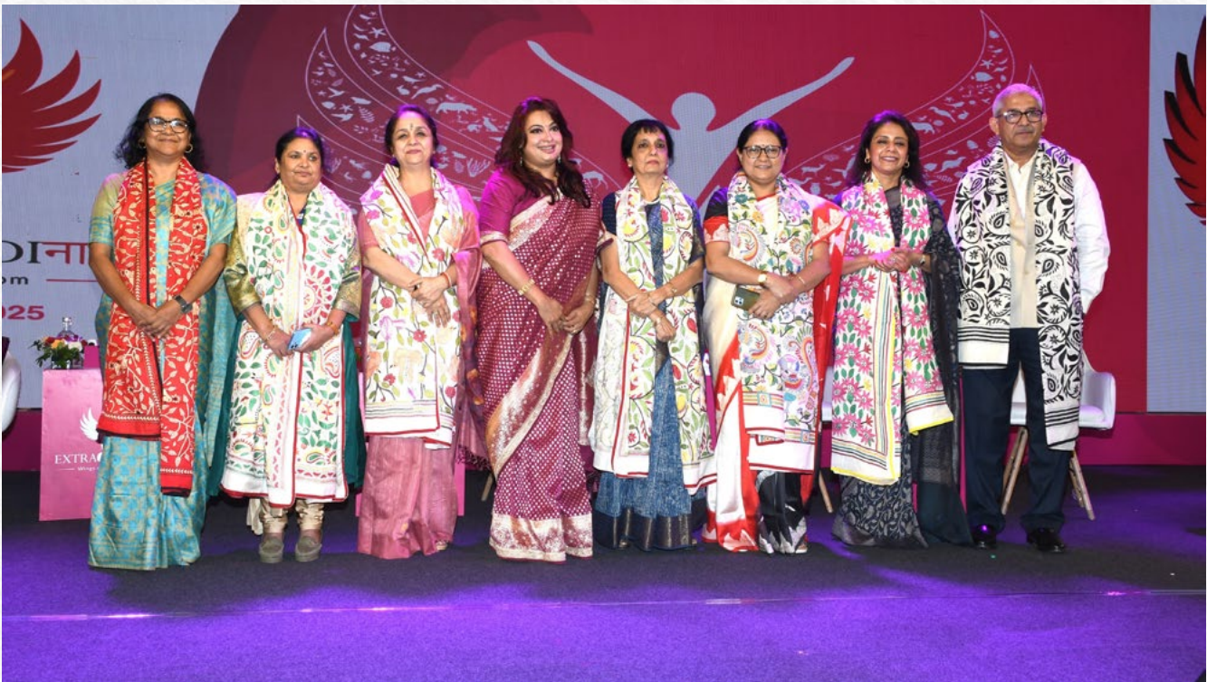
A precious moment of Director, ZSI with the delegates present in Panel Discussion