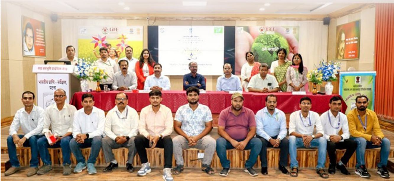
iGOT Karmayogi Training programme on 19 th August 2025