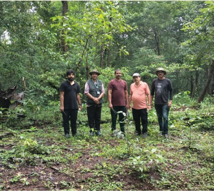
Survey Team at Goa