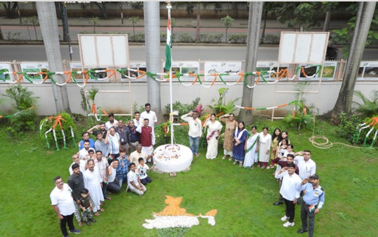
79 th Independence Day Celebration

A survey tour was conducted Tansa Wildlife Sanctuary in Thane district, Great Indian Bustard Sanctuary in Solapur district, and Sudhagad Wildlife Sanctuary in Raigad district from 7 th August to 14 th August 2025. Local surveys were also conducted to Pagote to Chowk, Raigad district, on 12 th and 13 th August 2025, respectively. A total of 45 species of faunal communities belonging to Crustacea, Coleoptera, Chilopoda, Blattodea, Mollusca, and Pisces were identified. One species of Chafer Beetle, i.e., Neoserica akurdi Kalawate, 2025, was described as new to science. Identification and