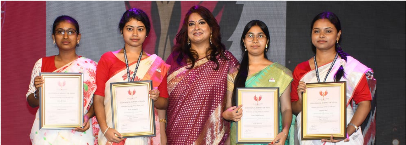
Director, ZSI with the achievers of Women in Zoology (WIZ) Award 2025