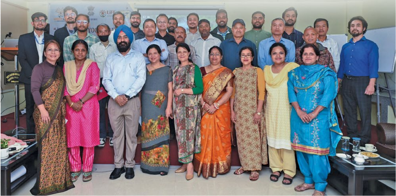
Karmayogi Training programme held on 21 st August 2025