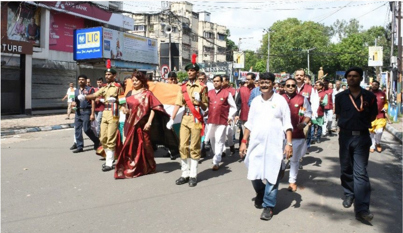
Independence Day rally led by Director, ZSI