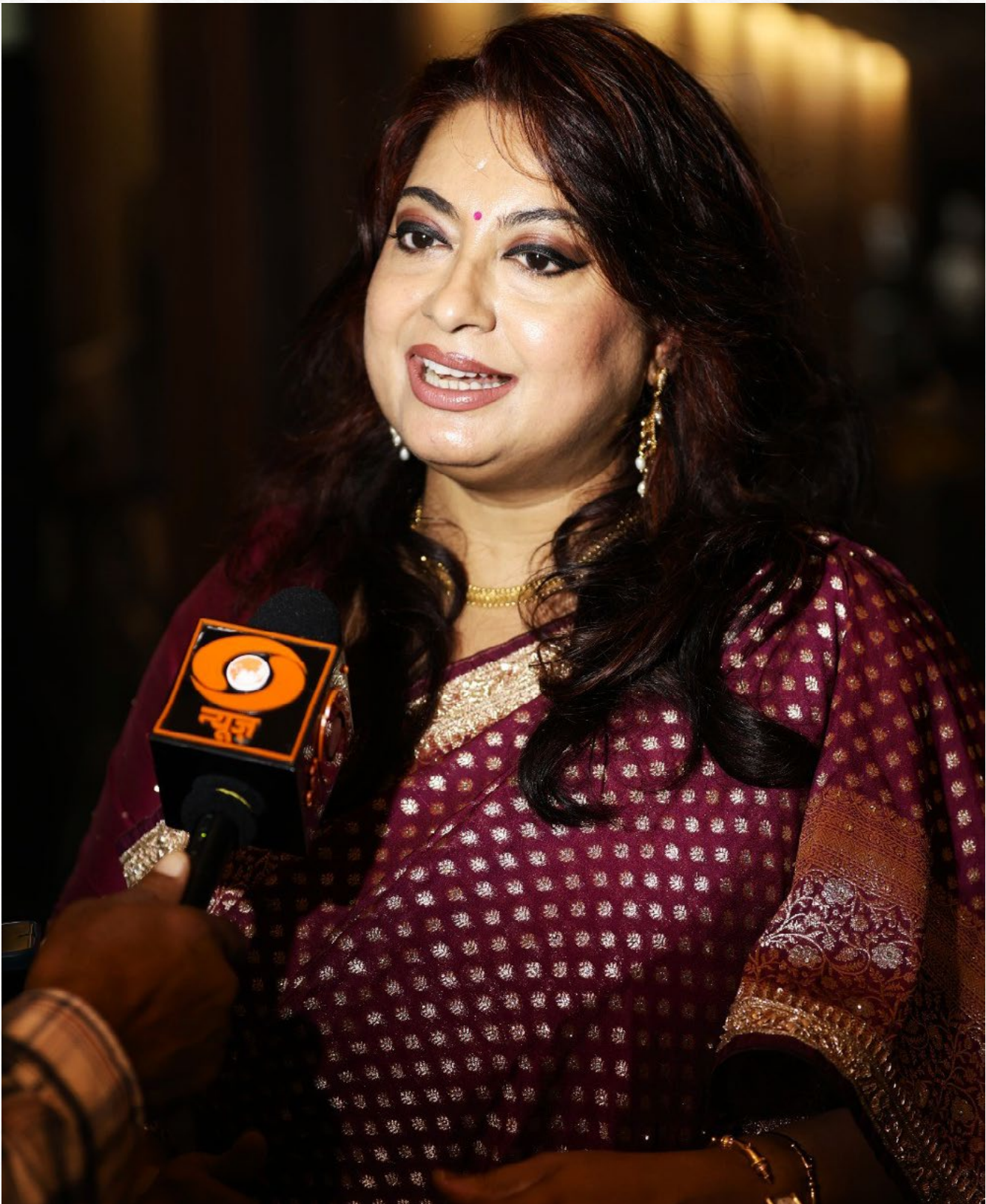
Interview in News Media on ZSI Women's Day