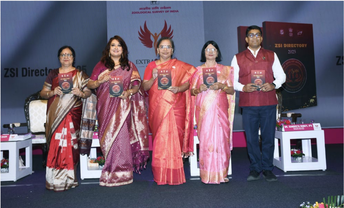
Release of ZSI Directory, 2025