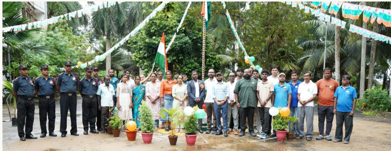
Independence Day celebration