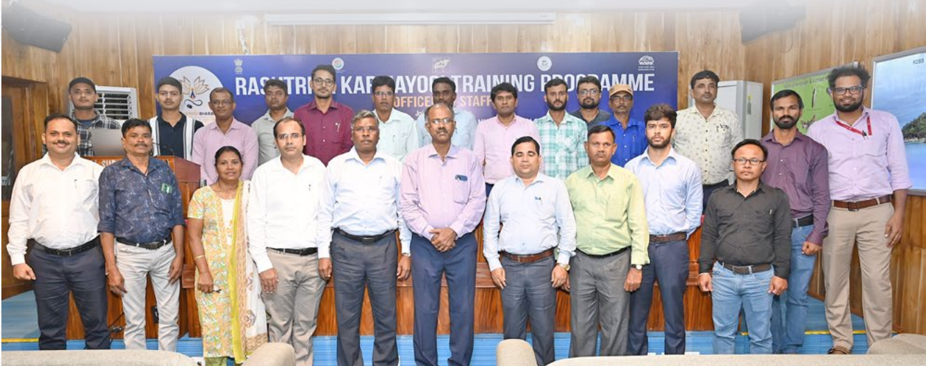
iGOT Rashtriya Karmayogi Training Programme on 25 th August 2025

One long-term survey was conducted to Great Nicobar Island during 1 st to 24 th August 2025 to study the Marine and Terrestrial faunal diversity. Ten-day local surveys were at Burmanallah, Kodyaghat, Kurmadera, Collinpur, North Bay, Science Centre, Carbyn's Cove, Dignabad, Junglighat, Chidiyatappu, Baratang, Havelock, and Mount Harriet of South Andaman to study the Terrestrial fauna and Marine Faunal diversity on 1 st to 6 th , 14 th , 15 th , 26 th and 29 th August 2025. A total of 190 species of faunal communities belonging to Platyhelminthes, Echinodermata, Isopoda, Decapoda, Lepidoptera, Coleoptera, Odonata, Orthoptera, Phasmatodea, Reptilia, Stomatopoda, Fishes, Echinodermata, and Mollusca were identified. Identification and Advisory Services were rendered to the Department of Environment and Forests, Andaman and Nicobar Islands. The 79 th Independence Day was celebrated. Officers and staff of the centre attended one day training program on 'Rashtriya Karmayogi Large Scale Jan Seva Programme'. 'Har Ghar Tiranga' awareness rally was organized on 15 th August 2025 by the staff of this office from the office campus to Haddo Wharf.