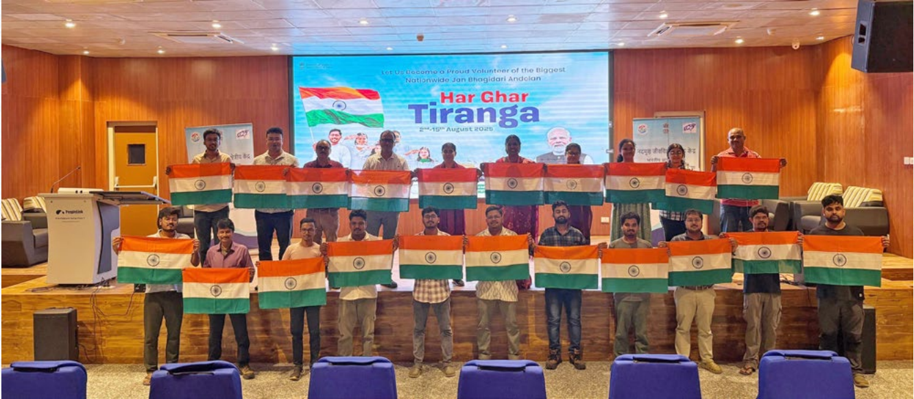
Har Ghar Tiranga Campaign