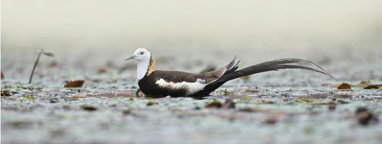
Pheasant-tailed jacana Hydrophasianus chirurgus (Scopoli, 1786)