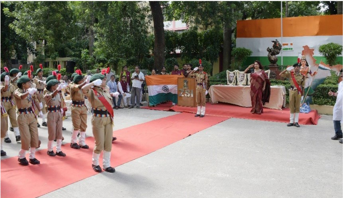
Independence Day parade at ZSI HQs premises