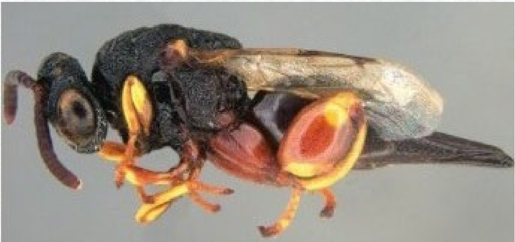
Brachymeria delvarei Binoy, 2025