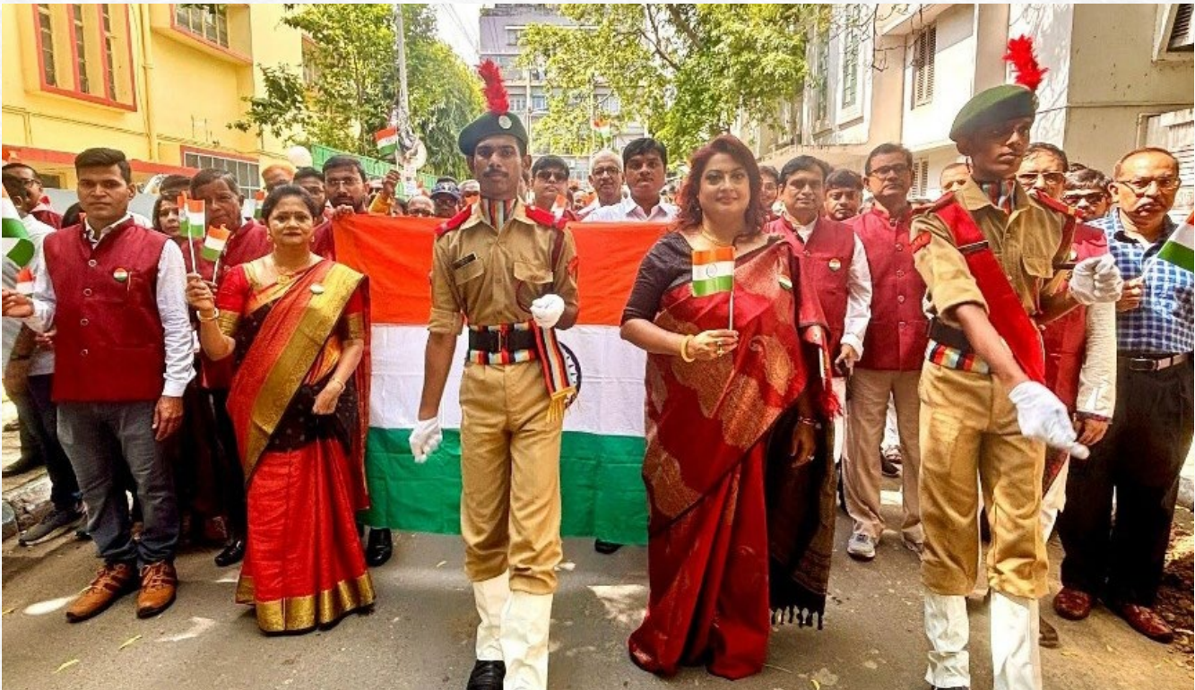
Glimpses of Independence Day Rally