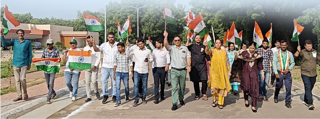
Har Ghar Tiranga Rally organized at DRC, Jodhpur