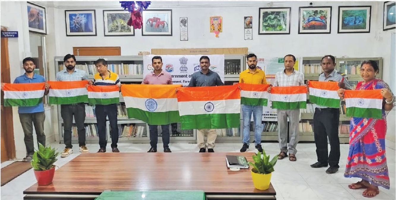
Har Ghar Tiranga Campaign