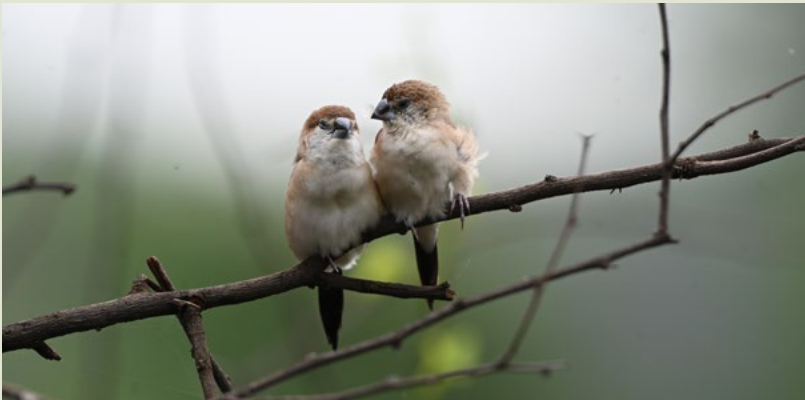
Silverbill Euodice malabarica (Linnaeus, 1758)