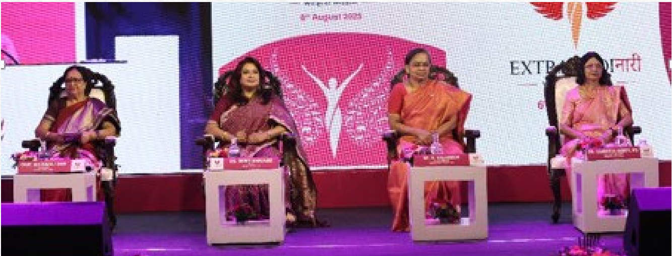
Director ZSI and dignitaries on dais during “Extraordinary- Wings of Wisdom”