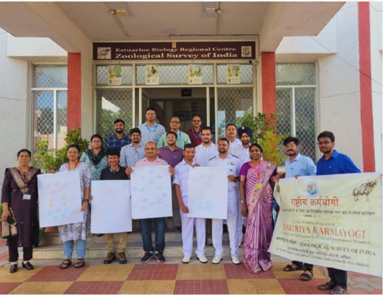
Ratsriya Karmayogi Training at EBRC