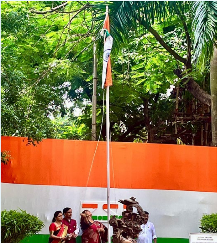
National Flag hoisting on the occasion of 79 th Independence Day celebration

Survey tours were conducted to West Bengal, Meghalaya and Andaman & Nicobar Islands. A total of 605 species of faunal communities belonging to Arachnida, Diptera, Hymenoptera, Ephemeroptera, Odonata, Orthoptera, Mantodea, Blattodea, Mollusca, Platyhelminthes, Lepidoptera, Hemiptera, and Nematelminths were identified. A total of two species belonging to Hymenoptera were described new to science. One species of Hemiptera was recorded for the first time from the country. A total of 67 species of Platyhelminthes, Hemiptera, Hymenoptera, Lepidoptera, and Nematelminths were augmented to National Zoological Collections (NZCs). Apart from these, 14 species of archaeological specimens were identified. Identification and Advisory Services were rendered to SRM University, Sikkim and Banda University of Agriculture and Technology, Uttar Pradesh. All officers and women employees attended the “Extraordinary: Wings of Wisdom” ( Women’s Scientist Conclave 2025 ) 2025 at Taj Taa Kutir, Kolkata, West Bengal on 6 th August 2025. All officers and staff members attended ‘ Rashtriya Karmayogi Large Scale Jan Seva Programme ’ at the office premises during this month. 79 th Independence Day and ‘ Har Ghar Tiranga ’ were celebrated at the office. Officers and all staff took the Sports Day Pledge on 29 th August 2025 to stay mentally and physically fit by engaging in regular playing activities and exercise.