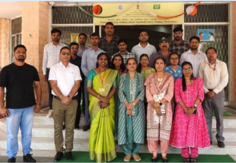
Rashtriya Karmayogi training organized at DRC, Jodhpur

A survey tour was conducted to Jammu & Kashmir, and Ladakh. A total of 110 species of faunal communities belonging to Gastropoda, Hemiptera, Hymenoptera, Lepidoptera, Coleoptera, and Pisces were identified. Identification and Advisory Services were rendered to BGSB University, Rajouri (J&K) and SPC Government College, Ajmer. A total of 40 visitors visited the museum of the centre. The 79 th Independence Day and 'Har Ghar Tiranga' were celebrated during this month. "FIT India" pledge was also taken on National Sports Day celebration 2025. Officers and staff of the centre attended one day training program on 'Rashtriya Karmayogi Large Scale Jan Seva Programme'.