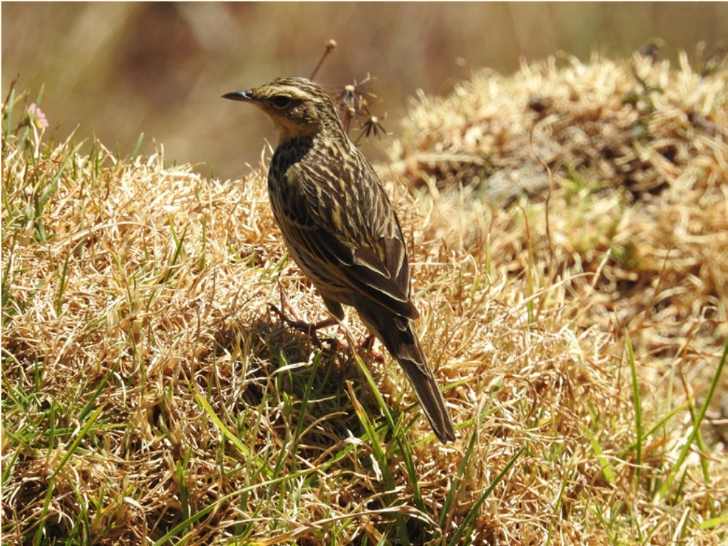
Nilgiri pipit Anthus nilghiriensis Sharpe, 1885