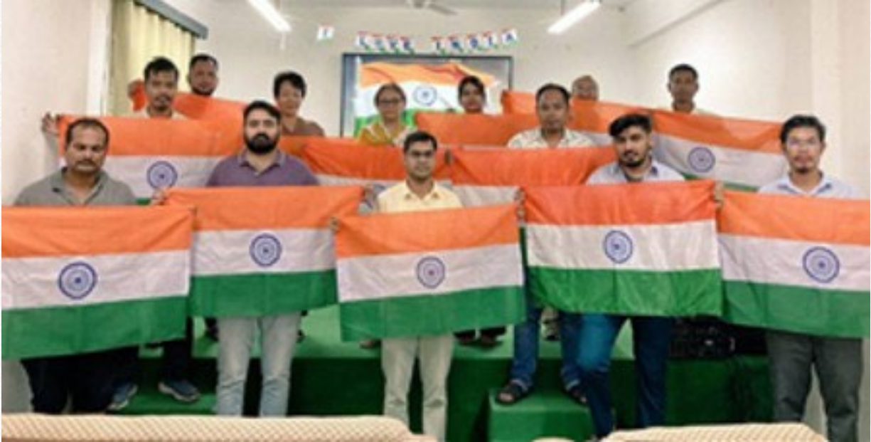
Har Ghar Tiranga at Conference Hall, ZSI, APRC