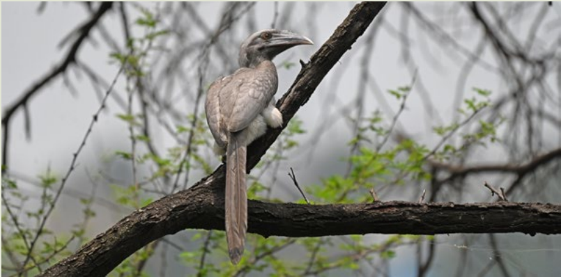
Indian Grey Hornbill Ocyrceros birostris (Scopoli, 1786)

A survey tour was conducted under the programme “Faunal Diversity of Three Ramsar Sites of Madhya Pradesh” from 16 th July 2025 to 4 th August 2025. A total of 83 species of faunal communities belonging to Fishes, Aquatic Coleoptera, Aquatic Hemiptera, Mollusca, Rotifera, and Branchiopoda were identified during this month. A total of 13 DNA sequences were submitted to NCBI. All the Scientists and Staff of the centre Participated in ‘Har Ghar Tiranga’ on 12 th August 2025 as part of Nationwide Jan Bhagidari Andolan. The 79 th Independence Day was celebrated. Mission LiFE and Swachhta Hi Seva Special Campaigns 5.0 were conducted to generate awareness among people. Officers and staff of the centre attended one day training program on ‘Rashtriya Karmayogi Large Scale Jan Seva Programme Phase – II’.