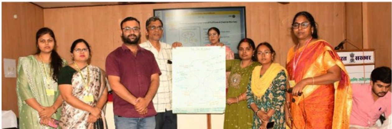
'Rashtriya Karmayogi Core Program' training on 26 th August 2025.