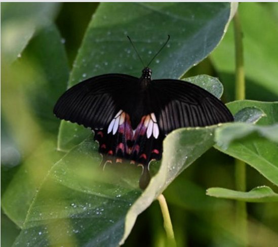
Andaman Common Mormon Papilio polytes stichioides Evans, 1912

One long-term survey was conducted to Great Nicobar Island during 1 st to 24 th August 2025 to study the Marine and Terrestrial faunal diversity. Ten-day local surveys were at Burmanallah, Kodyaghat, Kurmadera, Collinpur, North Bay, Science Centre, Carbyn's Cove, Dignabad, Junglighat, Chidiyatappu, Baratang, Havelock, and Mount Harriet of South Andaman to study the Terrestrial fauna and Marine Faunal diversity on 1 st to 6 th , 14 th , 15 th , 26 th and 29 th August 2025. A total of 190 species of faunal communities belonging to Platyhelminthes, Echinodermata, Isopoda, Decapoda, Lepidoptera, Coleoptera, Odonata, Orthoptera, Phasmatodea, Reptilia, Stomatopoda, Fishes, Echinodermata, and Mollusca were identified. Identification and Advisory Services were rendered to the Department of Environment and Forests, Andaman and Nicobar Islands. The 79 th Independence Day was celebrated. Officers and staff of the centre attended one day training program on 'Rashtriya Karmayogi Large Scale Jan Seva Programme'. 'Har Ghar Tiranga' awareness rally was organized on 15 th August 2025 by the staff of this office from the office campus to Haddo Wharf.