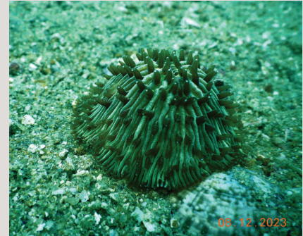
Cycloseris cyclolites (Lamarck, 1801)