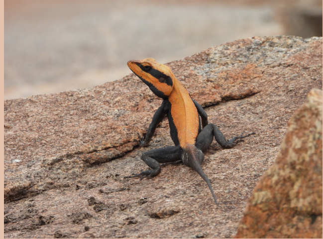
Peninsular rock agama Psammophilus dorsalis (Gray, 1831)