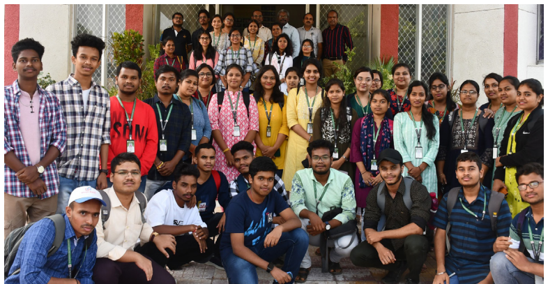
40 students from Department of Zoology, Khallikote University along with their teachers visited museum facilities on 1 st December 2023.