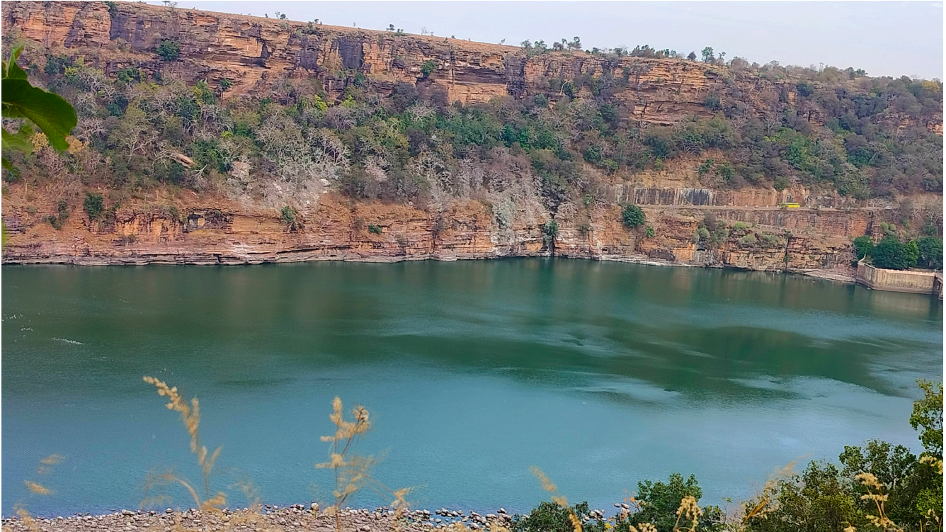
Reservoir of Gandhisagar dam inside Gandhisagar wildlife sanctuary, Mandsaur (M.P.).