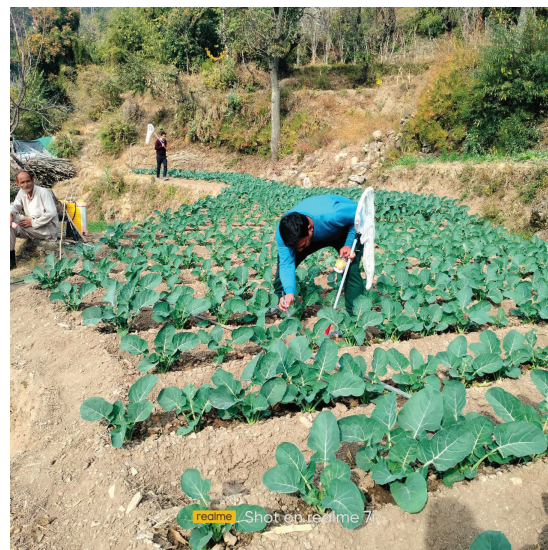
Collection from Agroecosystem of Cauliflower & Cabbage field

A total of 67 species of faunal communities belonging to Insecta and Pisces were identified during the month. Identification and advisory services were rendered to Department of Fruit Sciences, Punjab Agricultural University, Ludhiana, Punjab and University of Agricultural Sciences, Raichur, Karnataka. Under Mission LiFE, two selfie stands were installed at SBI bank, Solan and at Gurudwara Saproon, Solan to make people aware about the environment.