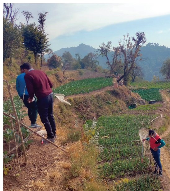
Collection from Agro Ecosystem of Koron, Kenthdi, Distt Solan HP