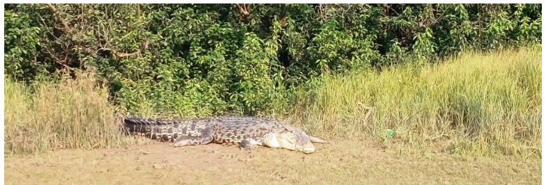
Crocodylus porosus Schneider, 1801 in Bhitarkanika national park