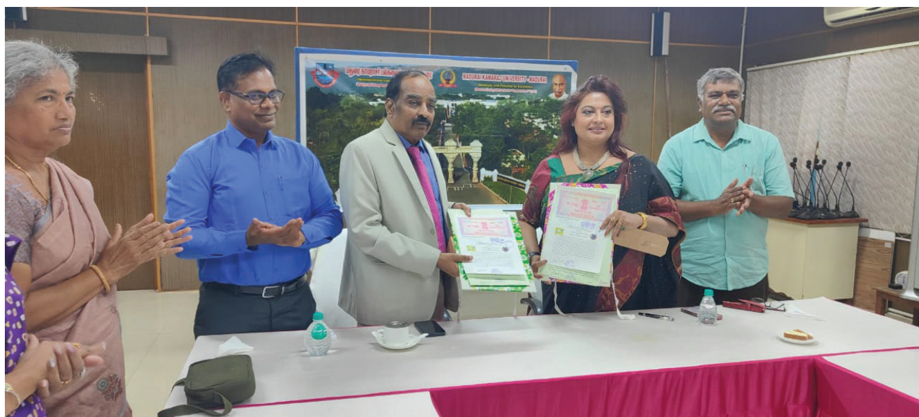
Signed an MoU with School of Energy, Environment & Natural Resources, Madurai Kamaraj University, Madurai on 19 th December 2023 at MKU campus for Scientific and Academic Cooperation between Zoological Survey of India and Madurai Kamaraj University.