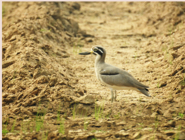
Great Thick Knee

A total of 245 species of faunal communities belonging to Hemiptera, Hymenoptera, Lepidoptera, Odonata, Mollusca, Pisces, Amphibia, and Reptilia were identified during the month. The officers of this centre attended 3 days capacity building program on Biodiversity Act 2002 and Global Biodiversity Framework along with recent developments organized by National Biodiversity Authority and M.S. Swaminathan Research Foundation, Chennai.