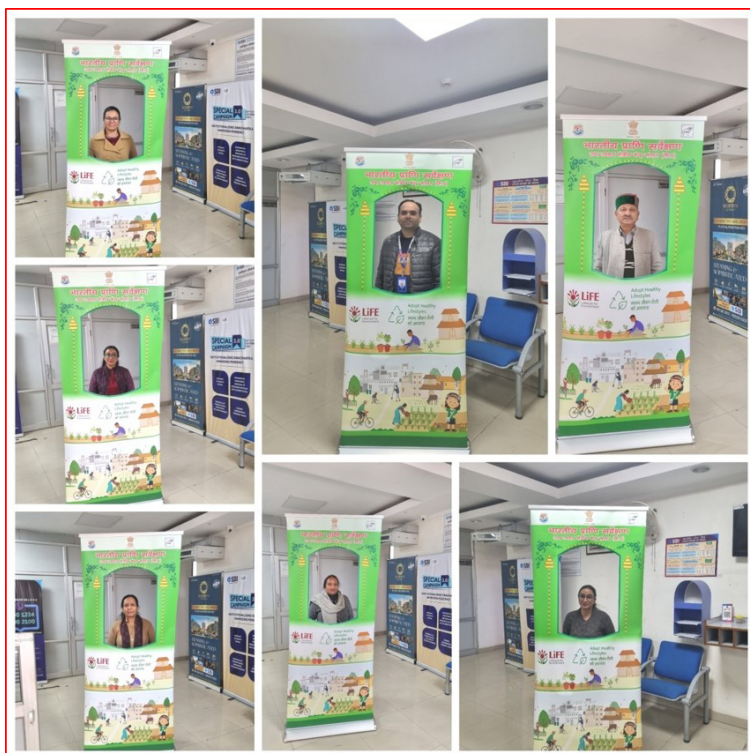
Selfie at State bank of India, Solan