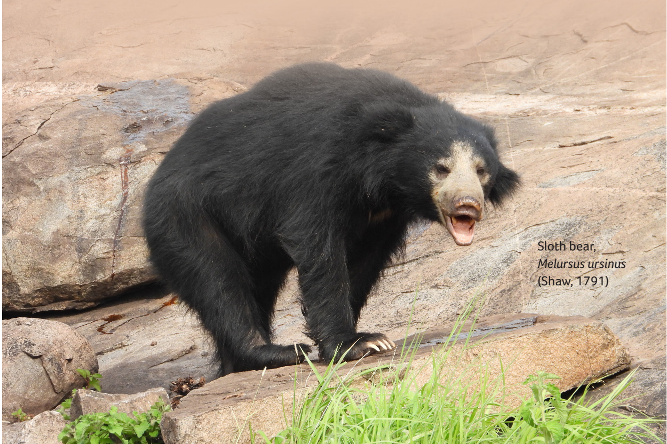
Sloth bear, Melursus ursinus (Shaw, 1791)