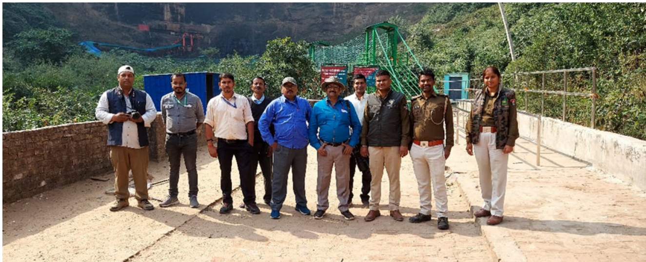
Faunistic survey was undertaken to Kaimur Wildlife Sanctuary, Bihar