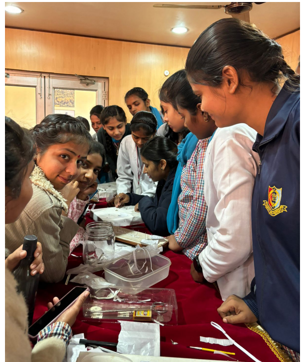
Hands on training of entomological stretching and pinning was given to the internship students at ZSI, CZRC, Jabalpur.

A survey was conducted to Kuno-Palpur National Park, Sheopur district and Gandhi Sagar Wild Life Sanctuary, Mandsaur district of Madhya Pradesh. A total of 78 species of faunal communities belonging to Orthoptera, Lepidoptera, Hemiptera, and Mollusca were identified during the month. Students from Govt. Senior and Higher Secondary School, Bichhiya (M.P.), Govt. Girls School, Patan (M.P.), Home Science College Jabalpur (M.P.) and Govt. Science College Jabalpur (M.P.) visited the ZSI museum.