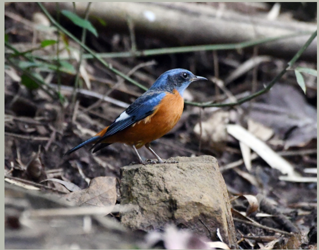
Blue-capped Rock Thrush Monticola cinclorhyncha (Vigors, 1831)

A total of 84 species of faunal communities belonging to Coleoptera, Hemiptera, Mollusca, Rotifera, Crustacea and Pisces were identified during the month. M.Sc. Students from Tumkur University visited Museum on 5 th December 2023.