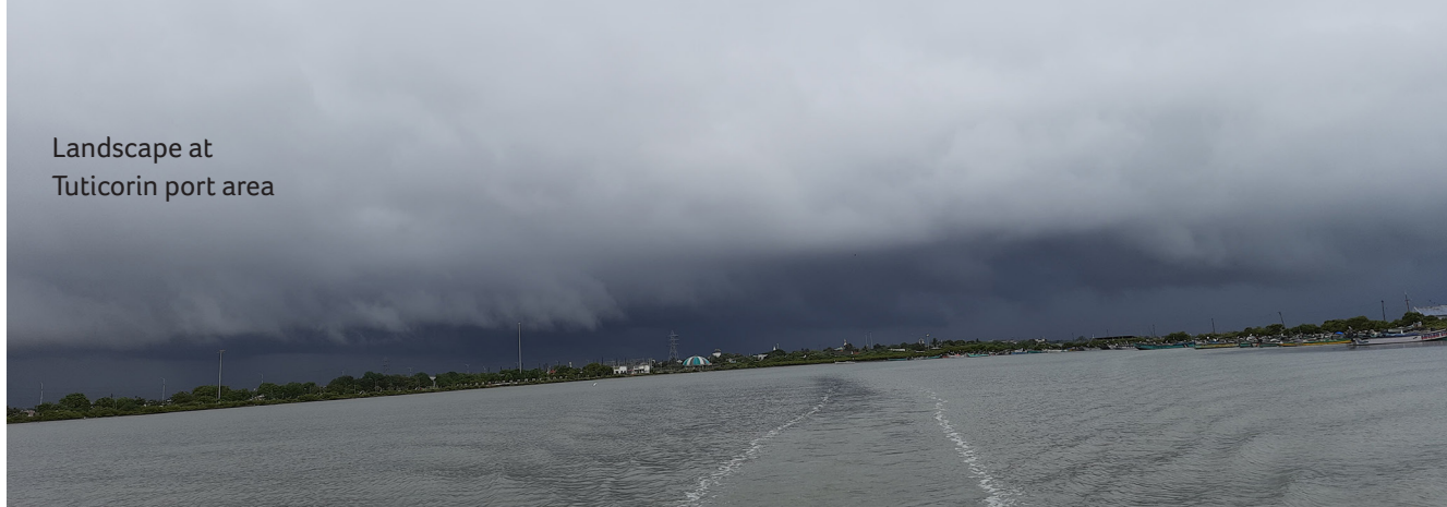
Landscape at Tuticorin port area

Surveys were conducted to Tuticorin coast and Digha coast. A total of 100 species of faunal communities belonging to Annelida, Nematoda, Mollusca and Crustacea were identified during the month. A total 46 educational institutions from Assam, West Bengal, Odisha, and Maharashtra visited the Marine aquarium and museum for the month as part of educational tour.