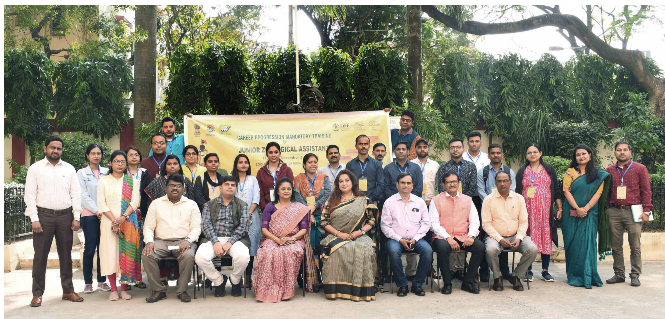
Inaugural Session of Two-week Career Progression Mandatory Training (CPMT) on 11 th December 2023 for Junior Zoological Assistant from 11 th December 2023 to 22 nd December 2023 at ZSI, Kolkata.