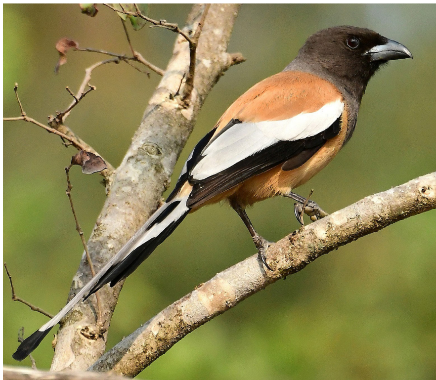
Rufous treepie Dendrocitta vagabunda (Latham, 1790)