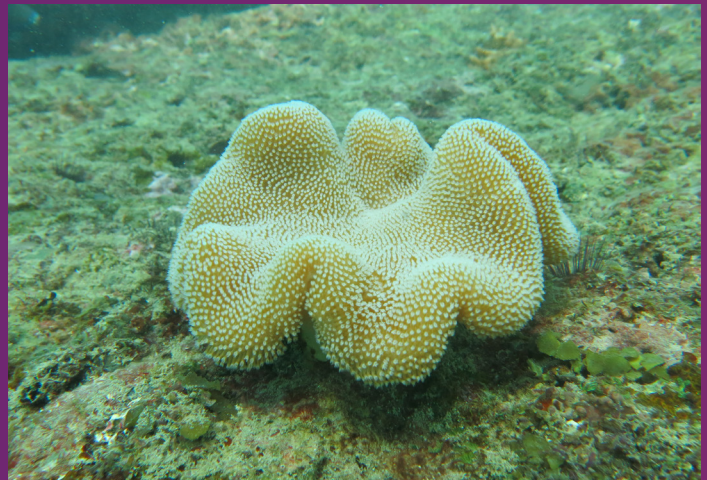
Sarcophyton stellatum Kükenthal, 1910