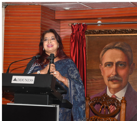
Director, ZSI welcomed and addressed the Ex-employees of ZSI on the occasion of the get-together event at HQs on 15 th December 2023.