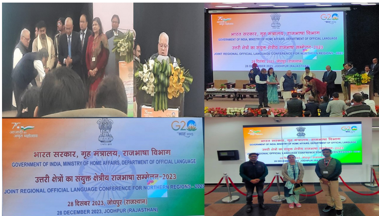
Joint Regional Official Language Conference for Northern Regions-2023 at IIT Jodhpur.