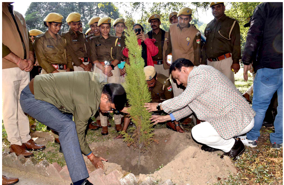
Sapling planted with trainees of Rajasthan Forest Department at ZSI, NRC, Dehradun.