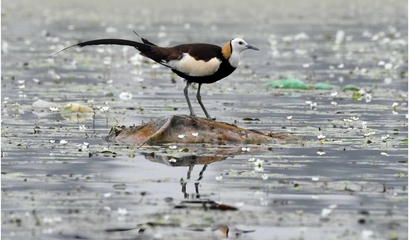
Pheasant-tailed jacana Hydrophasianus chirurgus (Scopoli, 1786)