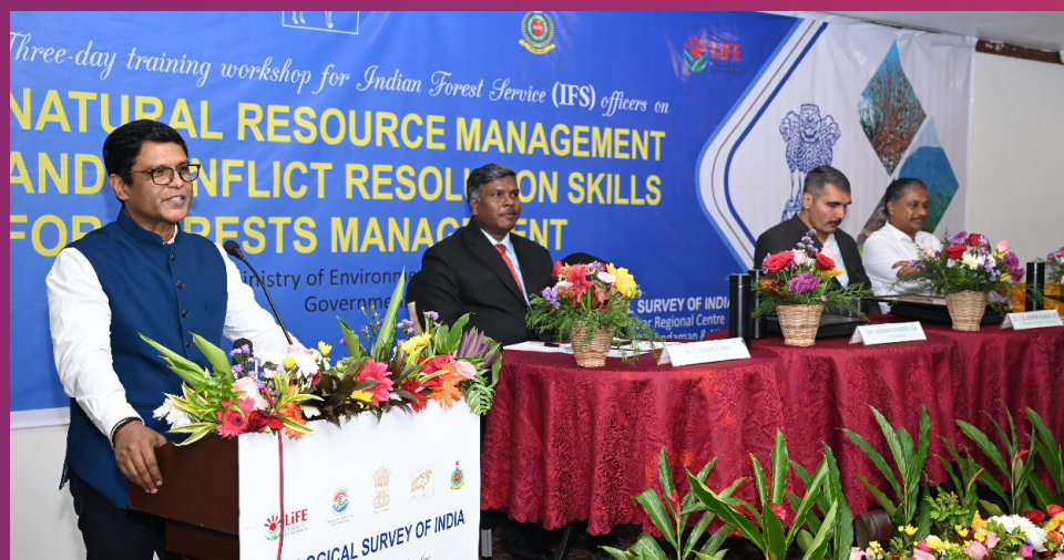
Shri Keshav Chandra IAS, Chief Secretary, A & N Islands delivering Inaugural address during the day IFS training workshop.