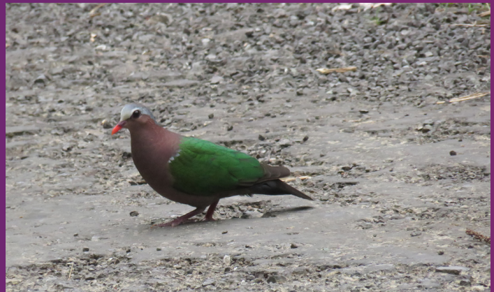
Nicobar Emerald Dove Chalcophaps indica augusta Bonaparte 1855