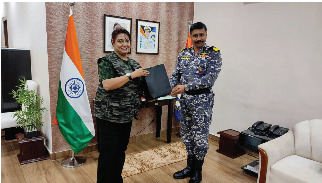
Felicitation at Daman Coast Guard Office on 22 nd December, 2023.