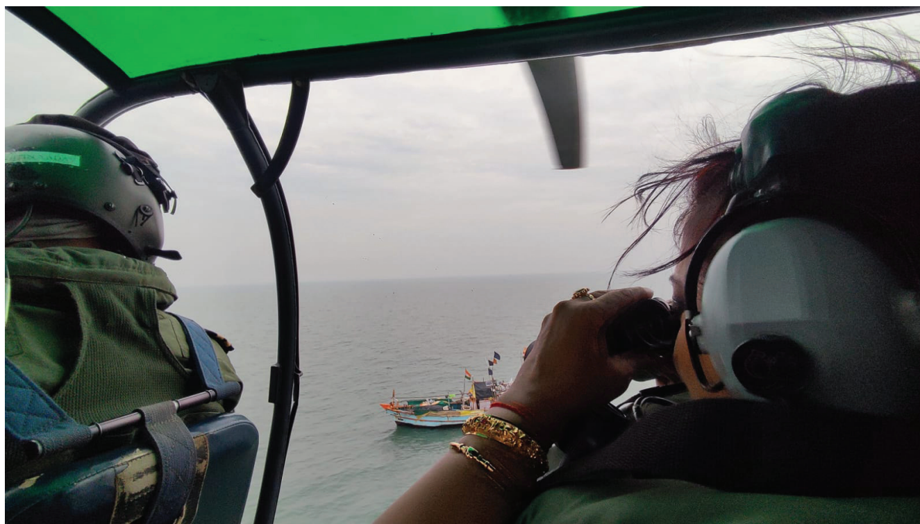
Conducted a comprehensive aerial survey off the coast of Daman to study Burrow pit and marine mammals in the Arabian Sea on 22 nd and 23 rd December 2023, utilizing the assistance of the Indian Coast Guard helicopter.