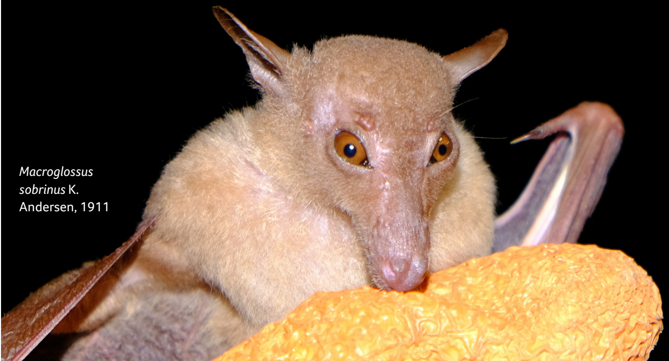
Macroglossus sobrinus K. Andersen, 1911