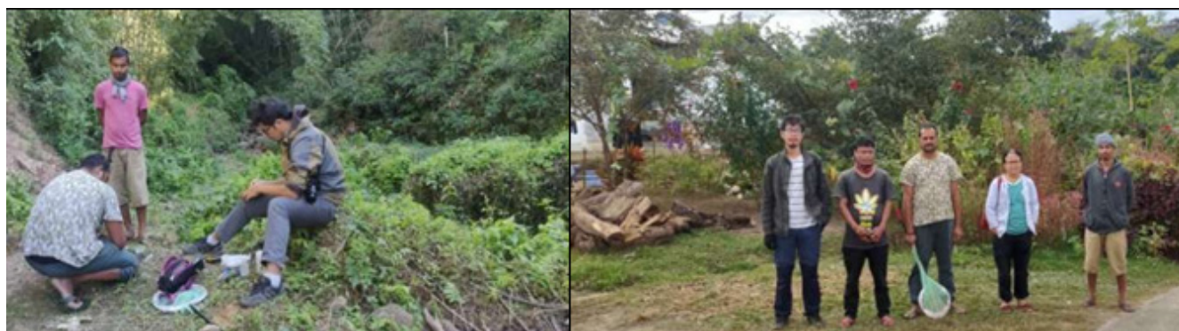
Field photographs from Extensive Survey at Upper Siang (Geku Circle), Arunachal Pradesh

Surveys were conducted to Chimi & Mogly village, Upper Siang, Kane WLS & Yordi-Rabe Supse WLS and to Yordi-Rabe Wildlife Sanctuary. A total of 125 species of faunal communities belonging to Lepidoptera, Orthoptera, Hemiptera, Coleoptera, Polydesmida, Mollusca, Pisces, and Amphibia were identified during the month. A new species of fish Glyptothorax heokheei was published during the month. Various Mission LiFE activities were conducted.