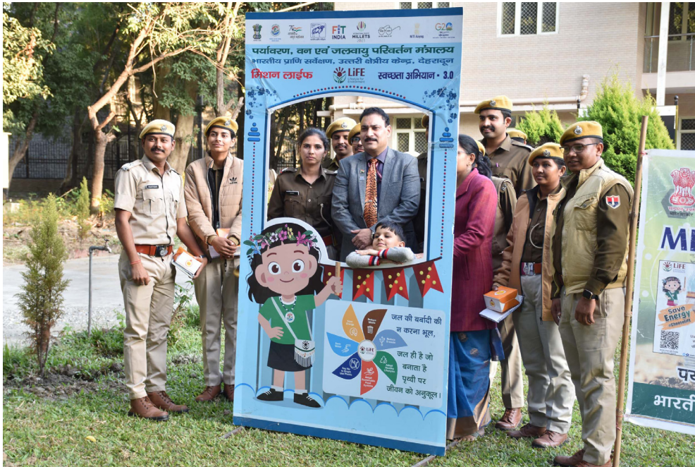
Mission LiFE Awareness Selfie point at ZSI, NRC, Dehradun.

One survey was undertaken to three conservation reserves of Punjab i.e. Rakh Sarai Amanat Khan, Ranjeet Sagar and Beas river. A total of 77 species of faunal communities belonging to Protozoa, Phthiraptera, Orthoptera, Lepidoptera, Hymenoptera, Pisces, and Amphibia were identified during the month. The Officer-in-Charge and staff organized and participated in Mission LiFE Programme- “Save Water, Save Electricity” awareness Rally and Special Campaign 3.0 Swachhta Cleanliness Drive Programme in and around ZSI, NRC campus, Dehradun City and Kaulagrah Market, Dehradun.