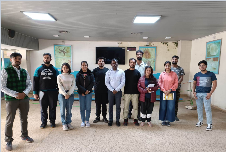
Training programme on 26.12.2023.