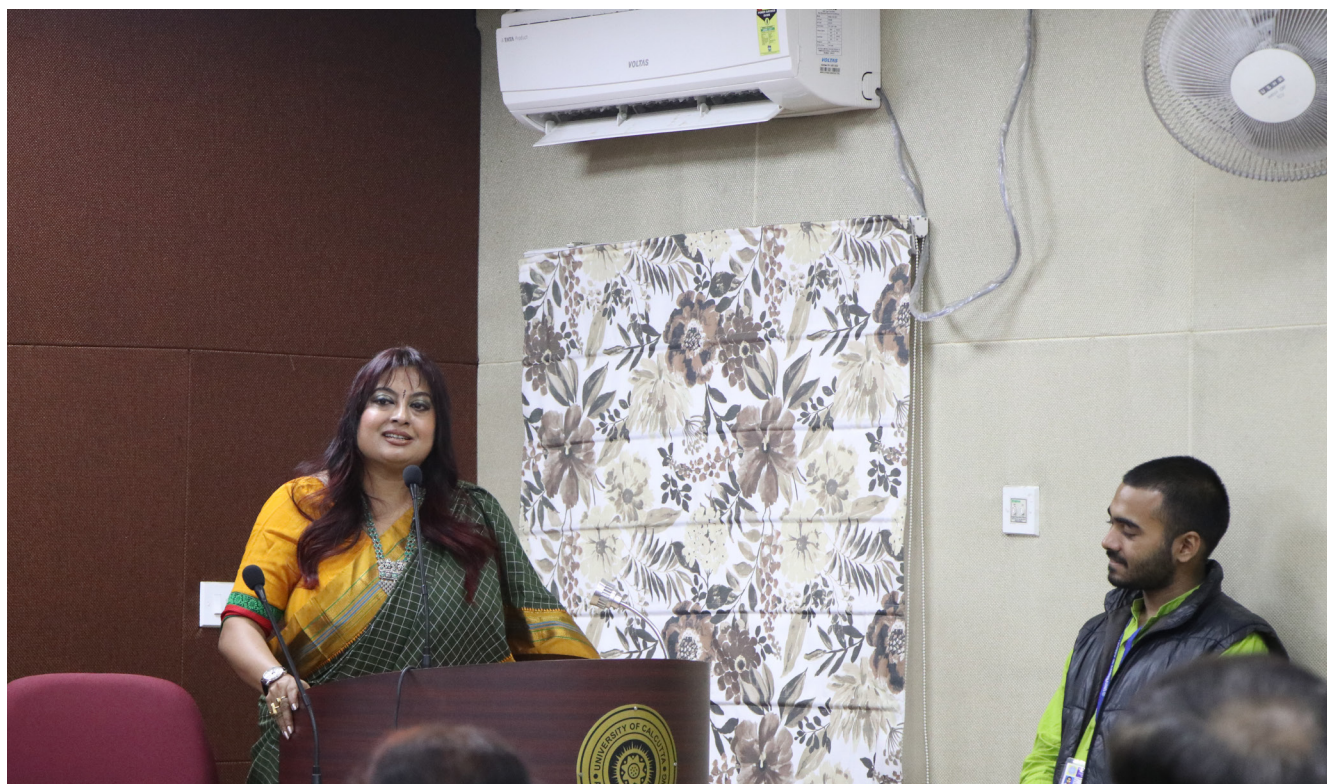
Director, ZSI addressed the 77 th Annual General Meeting of the Zoological Society, Kolkata on 13 th December 2023 held at the Department of Zoology, University of Calcutta, Kolkata.