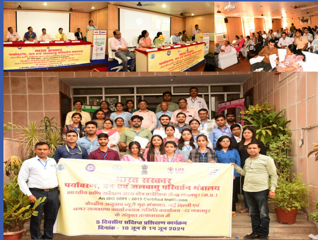
A five-day Hindi short training program was organized by the Central Zone Regional Center of Zoological Survey of India, Jabalpur during 10 th to 14 th June 2024

A total of 76 species of faunal communities belonging to Lepidoptera, Orthoptera, Hemiptera, Mollusca, and Reptilia were identified. Identification & Advisory services was rendered to Jawaharlal Nehru Krishi Vishawavidyala, Jabalpur. World Environment Day 2024 was celebrated from 27th May to 5th June 2024 through tree planation drives at various places of Jabalpur and made aware campaign about the themes "Land restoration, Drought Resilience and Desertification". Various programmes like Painting, Poster, Elocution and photography competitions were organized for school students and prizes were distributed, and Blood Donation Camp was organized in co-ordination with Red Cross Society, Jabalpur on 18th June 2024. The staff and internship students performed the blood donation for the noble cause. International Day of Yoga 2024 was also organized at the centre.