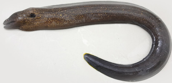
Gymnothorax flavimarginatus (Rüppell, 1830)

Local surveys were conducted at Champa, Udaypur, Shankarpur, and Mohana. A total of 34 species of faunal communities belonging to Annelida, Nematoda, Crustacea, and Pisces were identified. DNA sequence of three species were submitted in NCBI. Under Mission LiFE, “International Yoga Day 2024” with a theme of “Yoga for Women Empowerment,” was celebrated on 21st June 2024, “World Blood Donor Day – 2024” was organized on 14th June 2024 with an event on World Blood Donor Day Pledge [Hindi and English] and an awareness campaign for public. On the occasion of World Environment Day 2024, an event on cleaning the campus and plantation of office premises was conducted on the theme of “Land Restoration, Desertification and Drought Resilience” contact. All the staff participated and took Mission LiFE awareness pledge during the event on 5th June 2024.