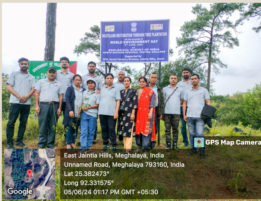
World Environment Day Celebration

A total of 74 species of faunal communities belonging to Hemiptera, Lepidoptera, Orthoptera, Odonata, Araneae, Mollusca, Pisces, and Amphibia were identified. Five species of bats were newly reported from Mizoram state. On the occasion of World Environment Day, an awareness programme was organized at Step-by-Step School (Senior Wing), Shillong on 31st May 2024 and all the staff of the centre participated in a plantation drive at Khliehriat, Jaintia Hills, Meghalaya on 5th June 2024, all the staff of the centre took pledge on 14th June, 2024 on the occasion of World Blood Donor Day, and International Yoga Day was celebrated on 21st June 2024. From 18th to 20th June, 2024 the staff of the centre participated in a one-hour Yoga Session as part of the International Yoga Day 2024.