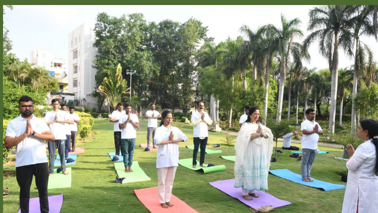
Celebration of International Yoga Day 2024