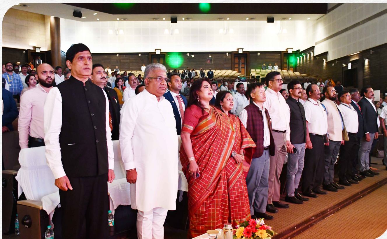
Celebration of 109th Foundation Day of ZSI