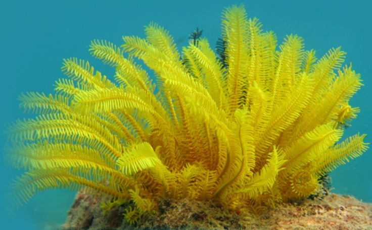
Comaster nobilis Carpenter 188