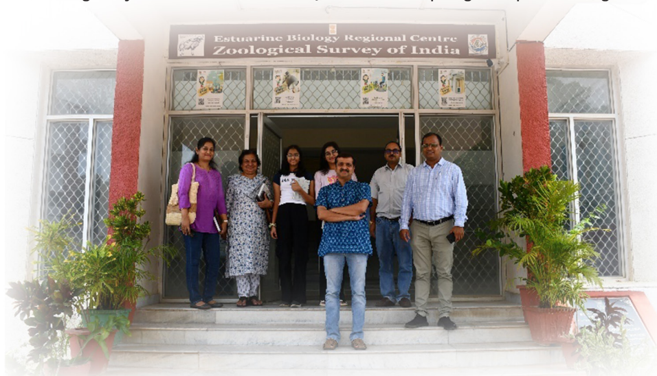
Director, Institute of Life Sciences Bhubaneswar visited EBRC, Gopalpur-on-Sea