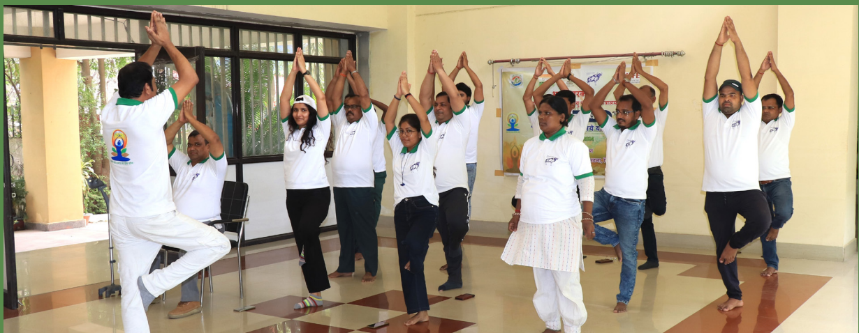
International Yoga Day celebration on 21st June 2024