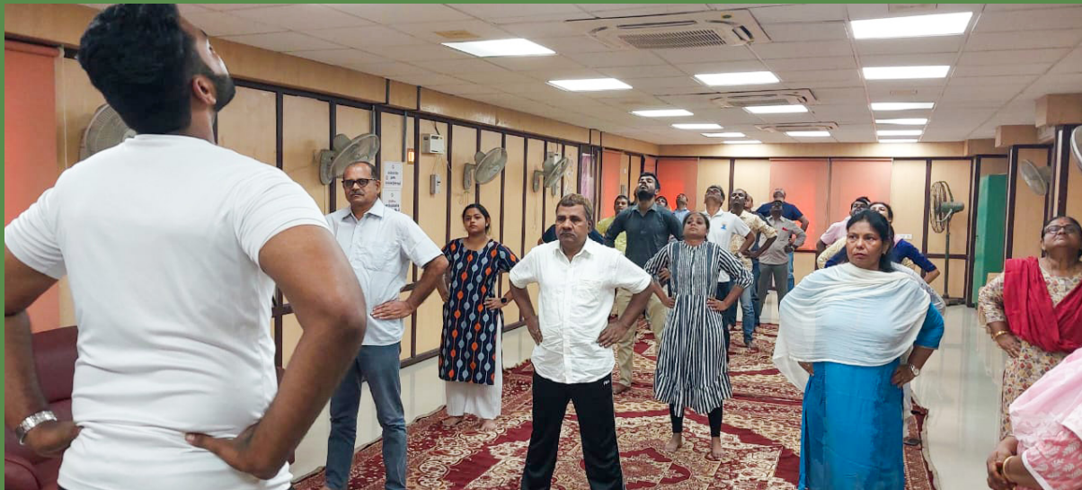
Celebration of International Yoga Day 2024