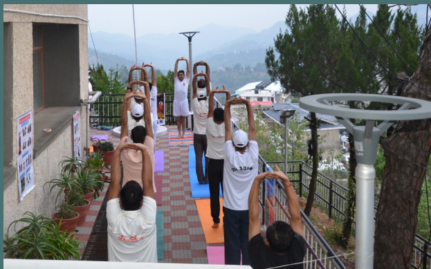
ZSI, Solan employees doing Tar Asan on 21st June 2024