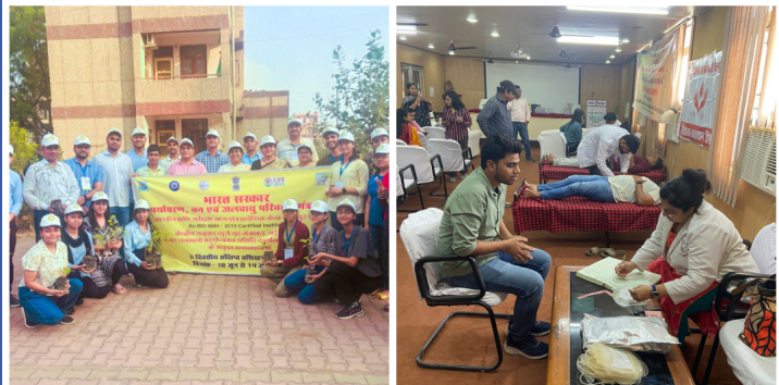
Celebration of International Day of Yoga 2024, World Environment Day-2024 and Blood Donation Camp