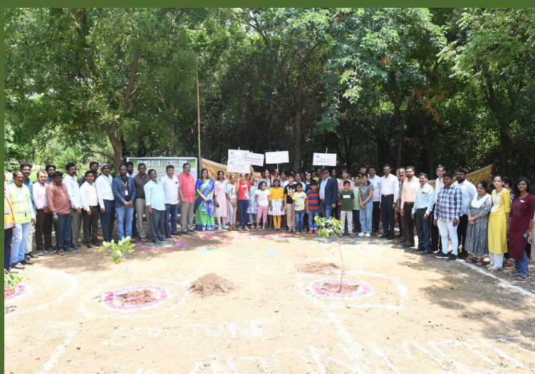
Celebration of World Environment Day, 2024