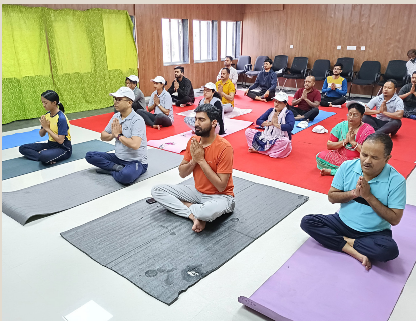
International Yoga Day Celebration