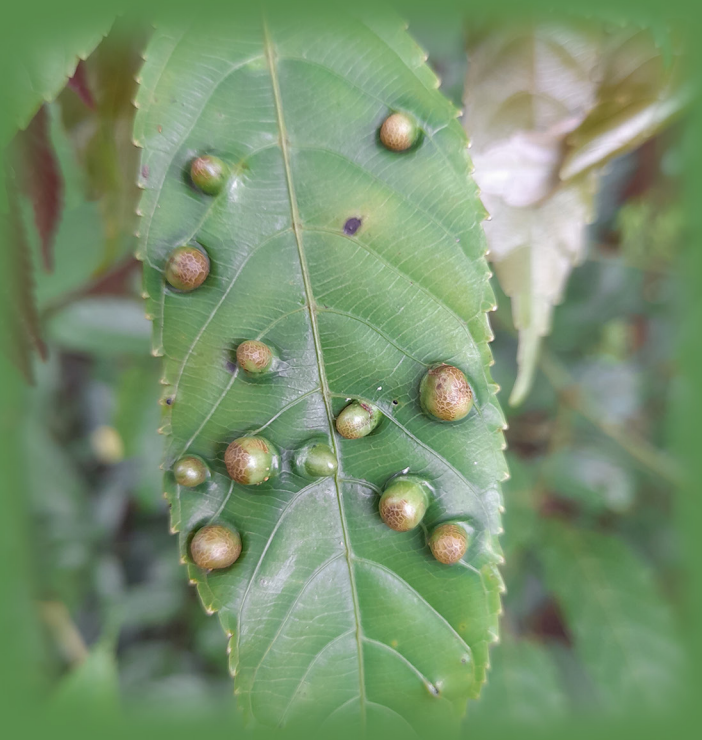
Galls of Lasioptera sharma

A total of 181 species of faunal communities belonging to Ephemeroptera, Hemiptera, Lepidoptera, Odonata, Psocoptera, Mollusca, Pisces, Amphibia, Reptilia, and Zooplankton were identified. One species of Diptera, namely, Lasioptera sharma was described as new to science. World Environment Day and International Yoga Day were celebrated at the centre.