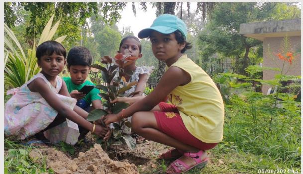
Celebration of World Environment Day 2024