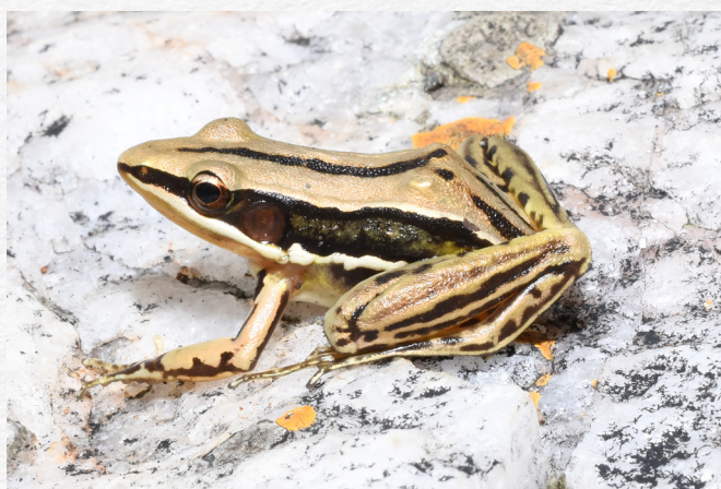
Gravenhorst's Frog, Hylarana gracilis (Gravenhorst, 1829)