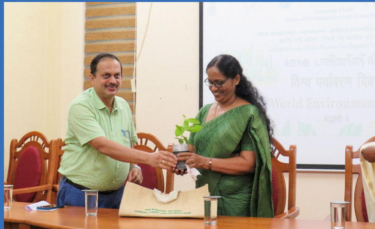
Celebration of World Environment Day 2024