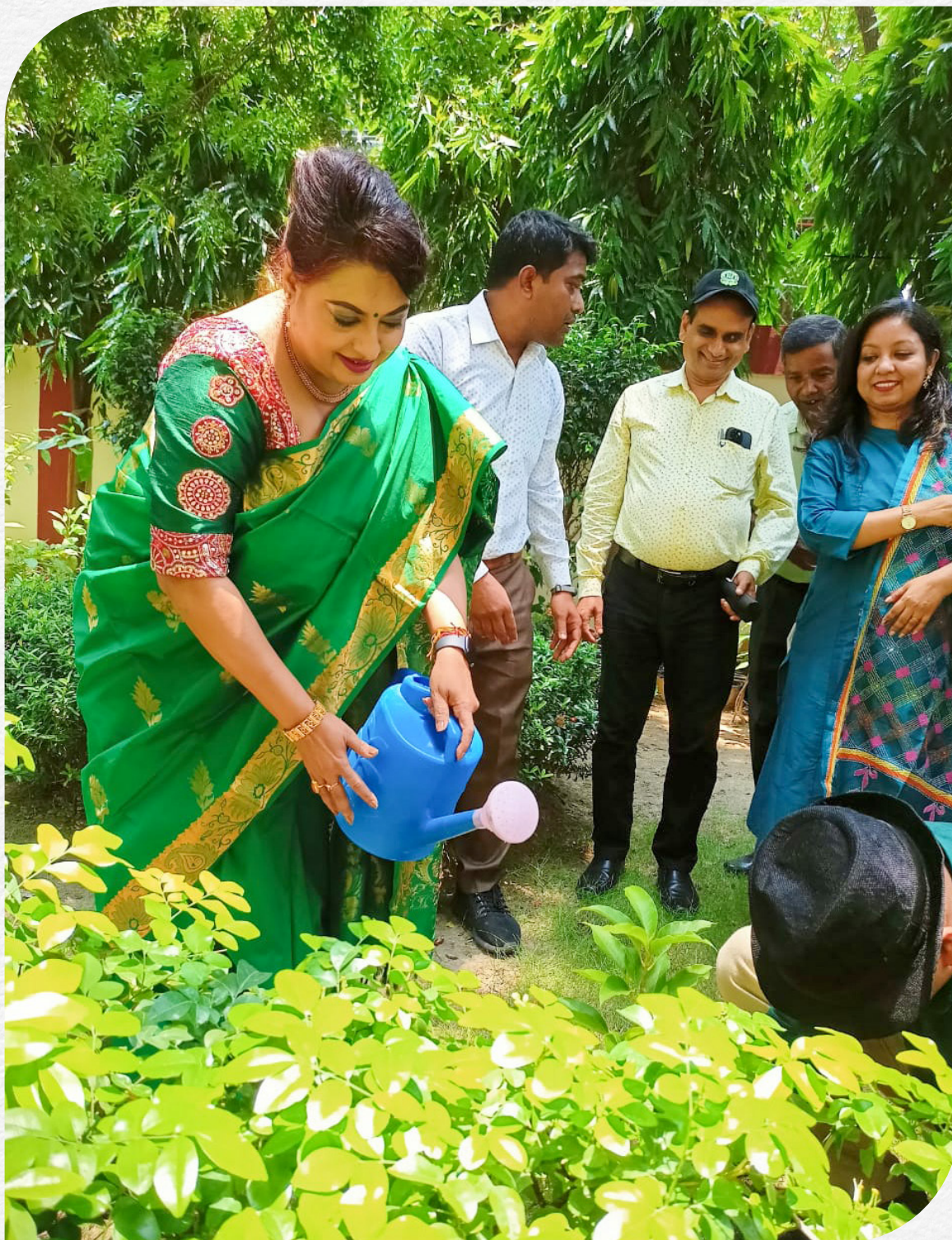
Tree Plantation in ZSI Premise on the occasion of the World Environment Day 5 th June, 2024. Plantation drive titled 'Ek Per Maa Ki Naam'.