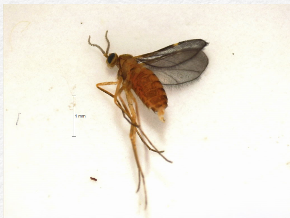
Lasioptera sharma sp. nov. (Adult)