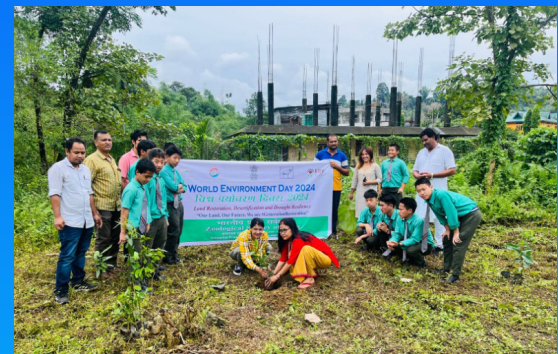
Plantation programme in celebrations for WED 2024