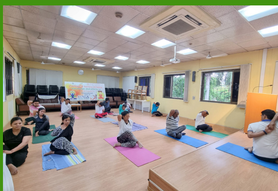
Celebration of International Yoga Day 2024