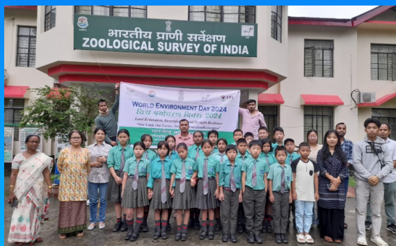
Group photo students of Hornbill English Medium School part of the celebrations for WED 2024

A frog was reported as new to the state fauna of Arunachal Pradesh. A total of 43 species of faunal communities belonging to Lepidoptera, Orthoptera, Hemiptera, and Pisces were identified. Identification and advisory services were rendered to Delhi University and Himalayan University. World Environment Day and International Yoga Day were celebrated in the centre. World Environment Day celebrations included a drawing competition, tree plantation program, awareness programs in JNK School Itanagar in collaboration with GB pant institutes and an extempore speech competition aligned with environmental themes. Extempore speech competition was organized for the Students from Vivekananda Residential Public School on various environmental issues, aligned with the theme of WED 2024 in the Centre on 5th June 2024. Drawing completion was organized in VKV School Chimpu, Itanagar in collaboration with GP Pant 'National Institute of Himalayan Environment'(NIHE) on 01st June 2024 as part of World Environment Day 2024.