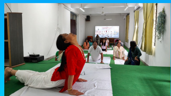
Yoga class for the office staff in celebration of International Yoga Day