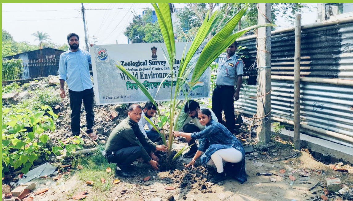
Celebration of World Environment Day, 2024