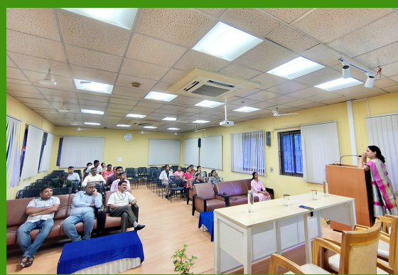
Conducted Hindi Rajbhasha Workshop on 18 th June 2024