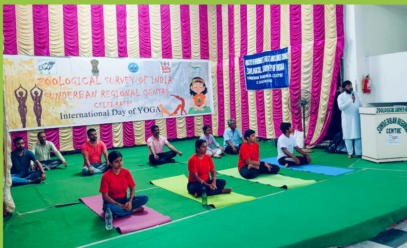
Celebration of International Yoga Day 2024

One day local survey was undertaken in Matla River area. A total of 58 species of faunal communities belonging to Mollusca, Crustacea, and Pisces were identified. Indoor plants were distributed to the staff members on the occasion of World Environment Day and International Yoga Day was celebrated. One day seminar, Sapling distribution and sapling was planted on 5th June 2024.