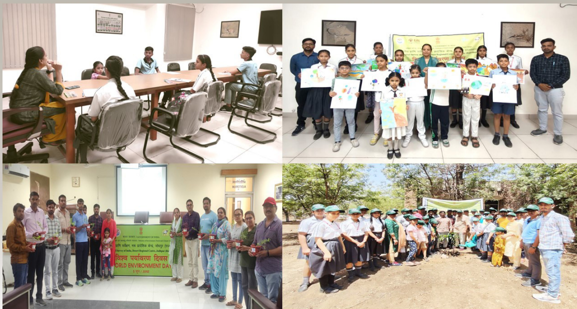
Celebration of “World Environment Day” from 27th May to 5th June, 2024 at DRC Jodhpur