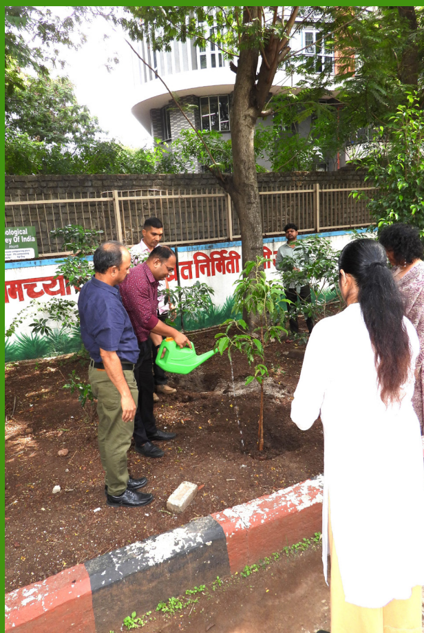
Tree Plantation at WRC Campus during World Environment Day 2024

Surveys were conducted to Ballari & Vijayanagar districts of Karnataka (under JSW-WMP Project) and to Caves of Mahabaleshwar & around, Satara. A total of 93 species of faunal communities belonging to Hemiptera, Coleoptera, Lepidoptera, Blattodea, Mollusca, Chilopoda, Crustacea, and Pisces were identified during the month. One species of Sri Lankan wet land frog, Hylarana gracilis (Gravenhorst, 1829) is reported as new to the Indian fauna. 19 DNA barcodes of Lepidoptera were submitted to the GenBank. Identification and advisory services were rendered for four different journals. World Environment Day was celebrated with programmes on Tree Plantation and Eco-awareness Rally in Ravet and International Yoga Day was celebrated with the theme “Yoga for self and society”.