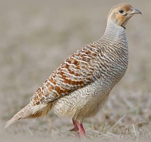
Grey Francolin, Ortygornis pondicerianus (Gmelin, 1789)

A total of 54 species of faunal communities belonging to Insecta, Gastropoda, and Pisces were identified. Paryavaran Divas 2024 were celebrated and distributed plant saplings to the officers and staff members of the Centre on 27th May 2024 under the celebration of World Environment Day from 27th May to 5th June 2024. Plantation was also done at Prajapati Hostel and at the centre on the occasion of World Environment Day on 5th June 2024. Pledge taking ceremony was organized on the occasion of “World Blood donor Day” on 14th June 2024 at the Centre. Mission LiFE activity under the theme Healthy Life Style: Yoga was organized and pledge was also taken on 14th June 2024 at the Centre. International Yoga Day was celebrated on 21st June 2024 at the centre. First Quarterly Hindi meeting on 25th June and Rajbhasha Workshop was organized on 26th June 2024 at the Centre.