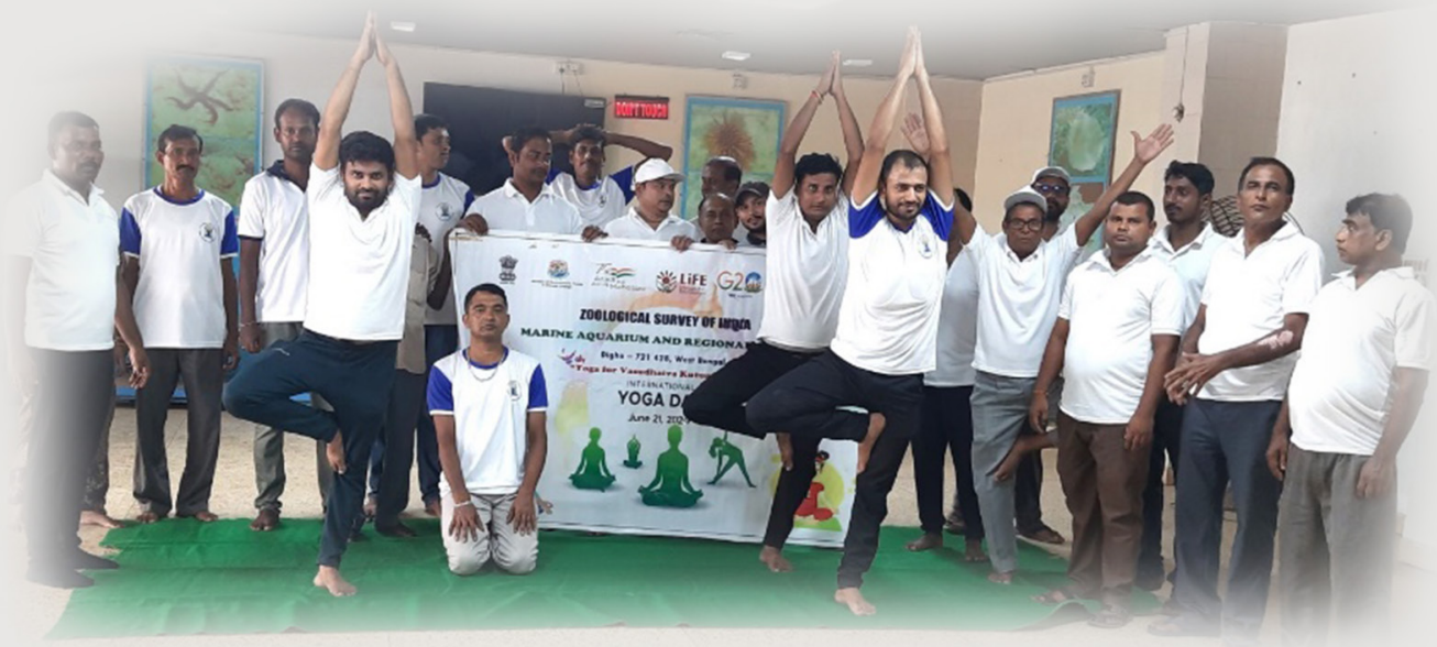
Celebration of International Yoga Day 2024