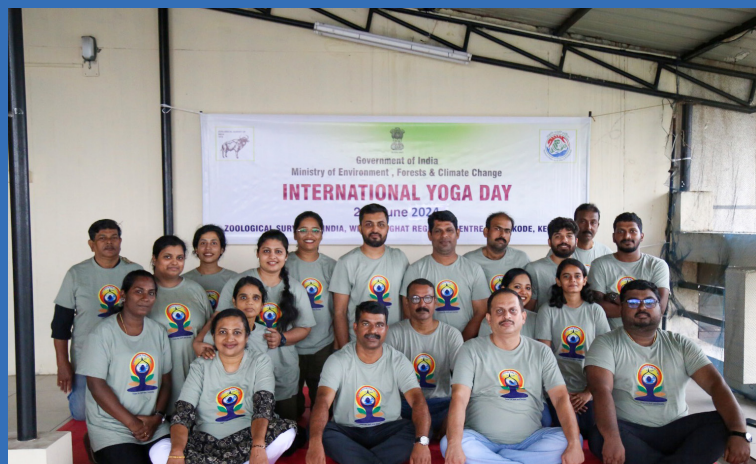
Celebration of International Yoga Day 2024