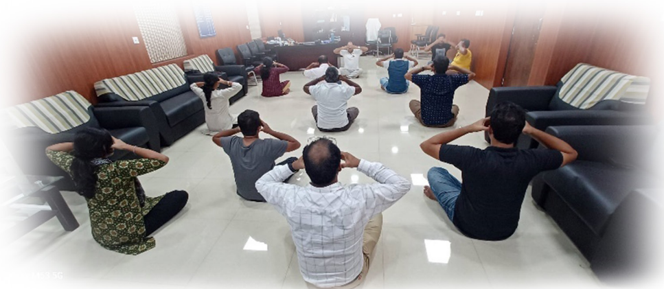
Celebration of International Yoga Day at EBRC, Gopalpur-on-Sea