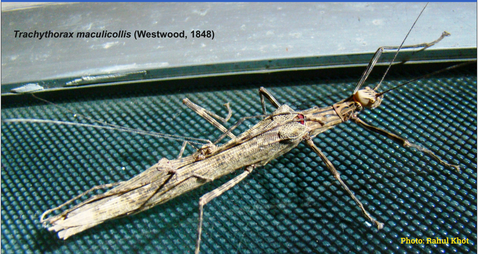
Trachythorax maculicollis (Westwood, 1848)