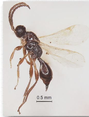
Phaenoserphus sureshii (Proctotrupidae)