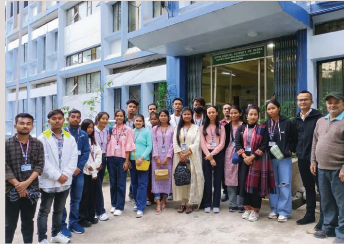
Visiting students of Dibru College, Assam on 18 th October 2023.

A field survey was conducted under the project “A systematic study of the bat fauna of Mizoram State, North-Eastern India”. A total of 49 species of different faunal groups were identified during the month. An exhibition stall was set up at the State Convention Centre, Shillong during the valedictory function of Wildlife Week, 2023. Students and teachers from Maryam Ajmal Women’s College of Science and Technology, Hojai, Nagaon, Dibru College, Assam, and project fellows of NESFA, Shillong visited the centre during the month. Identification and advisory services were rendered to St. Peters College, Shillong. Various cleanliness and public awareness drives were organized in the office premises and public places as part of Mission LiFE and Swachhta 3.0 campaign.