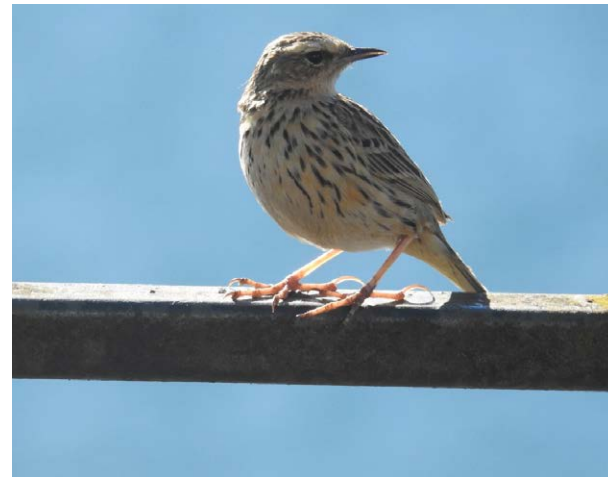
Nilgiri Pipit ( Anthus nilghiriensis )

A survey was conducted in the Karnataka part of the Deccan Biogeographic Zone. A total of 73 species of faunal communities belonging to Hemiptera, Lepidoptera, Odonata, Psocoptera, Mollusca, Fishes, Amphibia, and Reptilia were identified during the month. Samples of Ixodid ticks were identified for JBAS College for Women, Chennai. As part of the Swachh Bharat campaign, Pattinipakkam Beach was cleaned and a month-long cleaning activity was observed in the office.