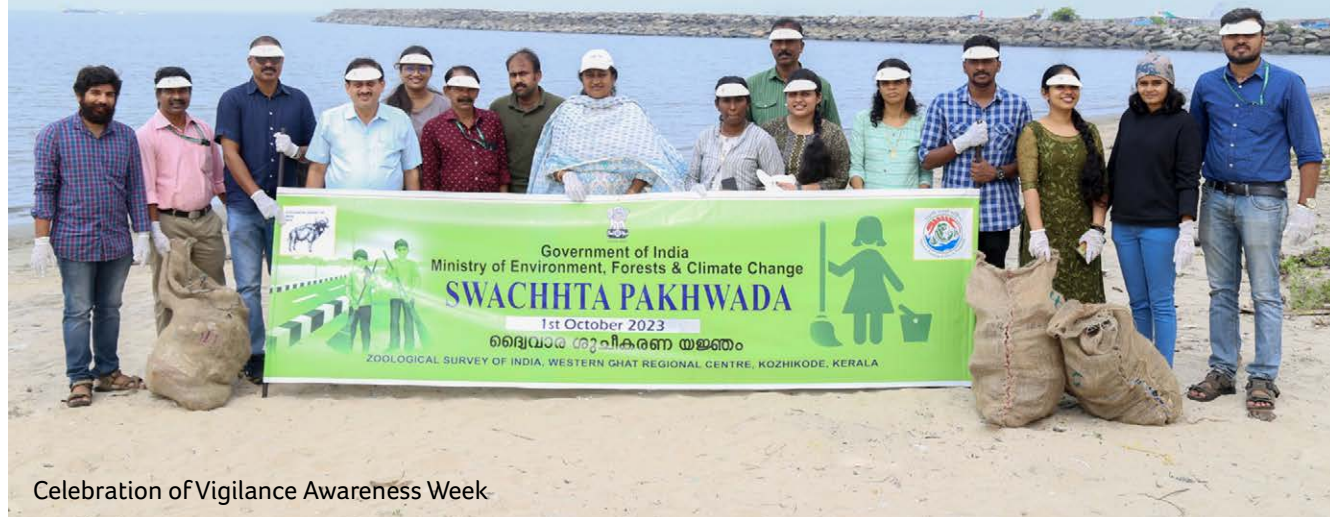
Celebration of Vigilance Awareness Week