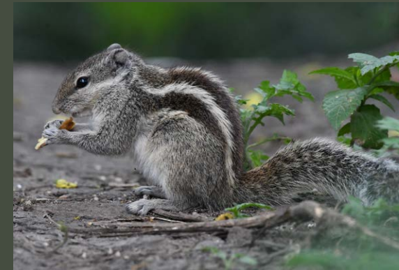
Five striped palm squirrel Funambulus pennantii Wroughton, 1905