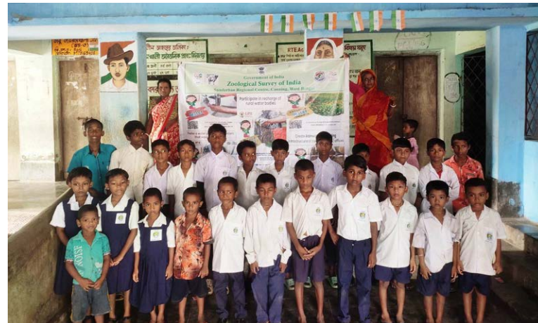
Mission LiFE campaign

One survey was undertaken to Daman for the development of Vadhavan Port, Palghar, Maharashtra. Local surveys were undertaken in the Matla River side, Sunderbans, and adjoining areas. A total of 115 species of faunal communities belonging to Mollusca, Crustacea, Echinodermata, and Pisces were identified during the month. Swachhata Hi Seva celebrated on 1 st October 2023 in Dadu village with 140 participants from different schools. Office premises were cleaned during the month under the Swachhata Campaign 3.0 and Mission LiFE programs were organized on the 1 st and 17 th of October 2023.