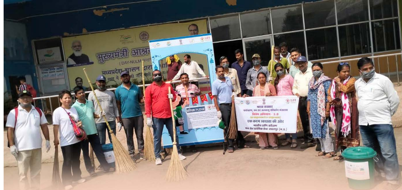
Cleanliness drive under Swachhta Campaign 3.0 organized by CZRC at Interstate Bus Terminal, Jabalpur on 1 st October 2023.