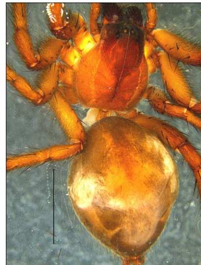
Dendrolycosa sahyadriensis female