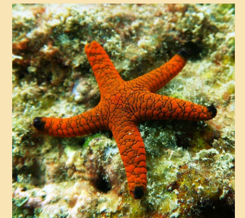
Fromia indica Perrier 1869