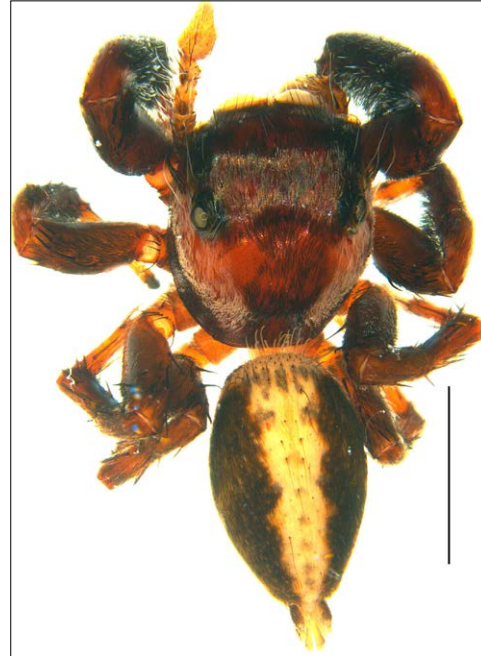
Colopsus peppara male