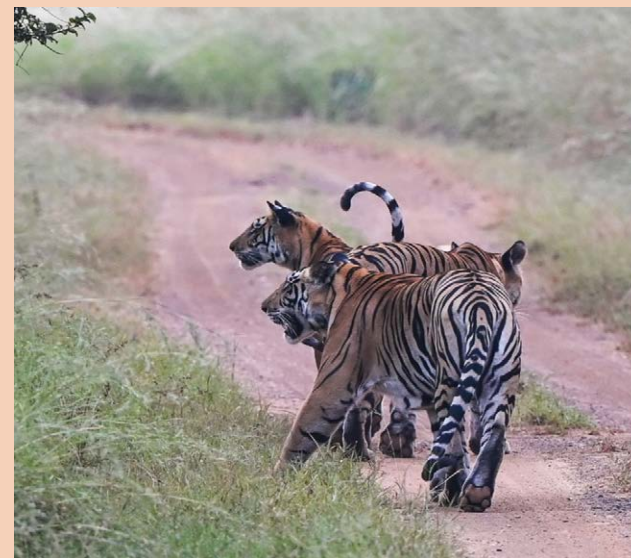
Bengal Tigers ( Panthera tigris tigris ) observed at Panna Biosphere Reserve by the ZSI survey party.