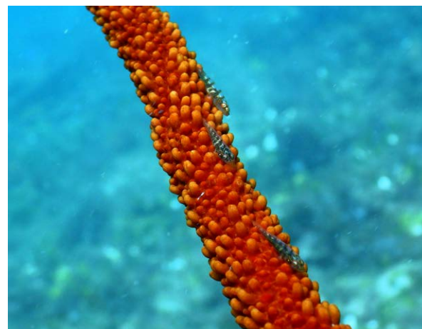
Whip Coral Goby fish