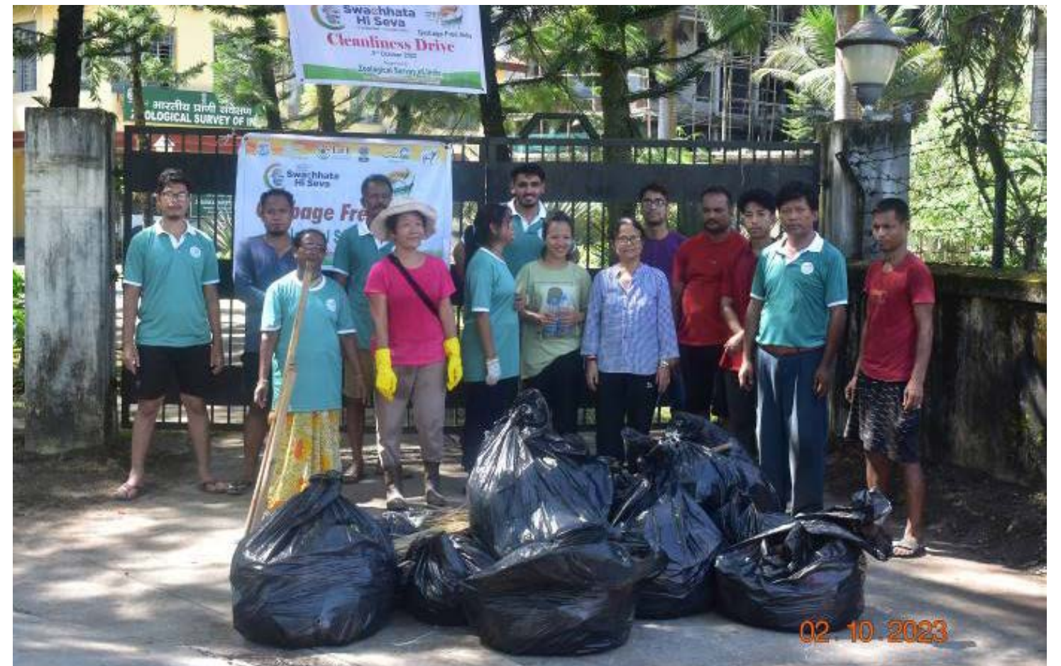
Swachhata Campaign at Ganga Lake on 1 st October 2023 "Garbage Free India" performed by ZSI, APRC, Itanagar on 2 nd October 2023.