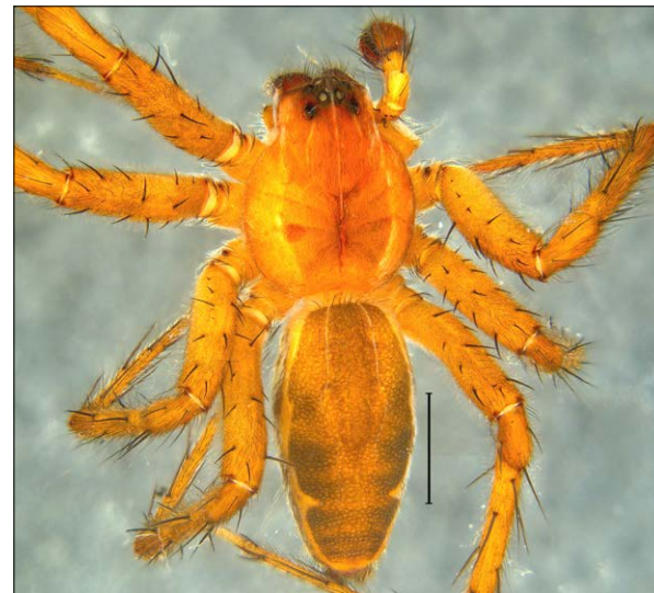
Dendrolycosa sahyadriensis male