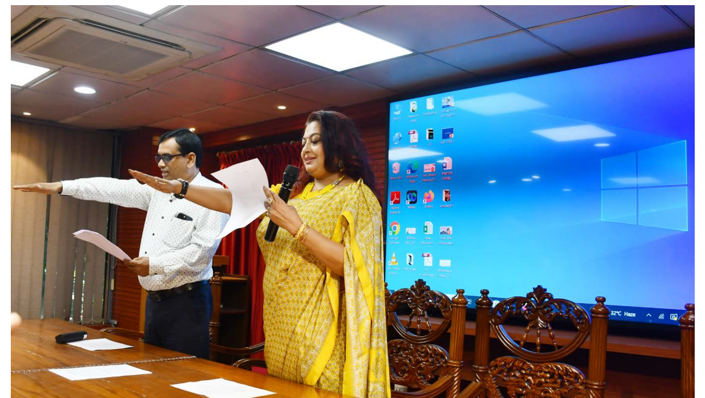
Celebration of Unity Day on 31 st October, 2023.