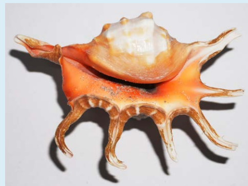
Lambis crocata (Link, 1807)