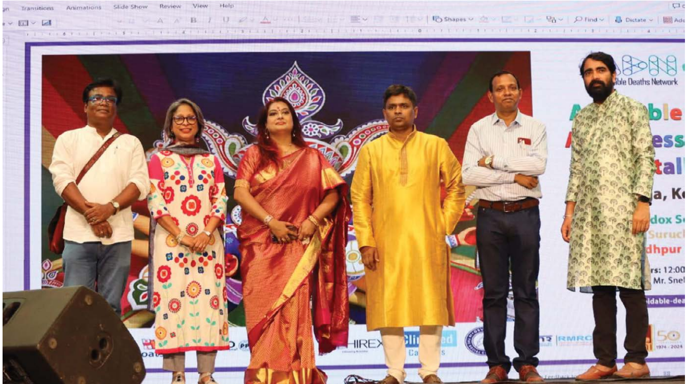
Snake bite Awareness program at Maddox Square during Durga puja 2023 as part of Mission LiFE Campaign to share their insights, exchange knowledge, and explore proactive measures to prevent snakebite-related fatalities.