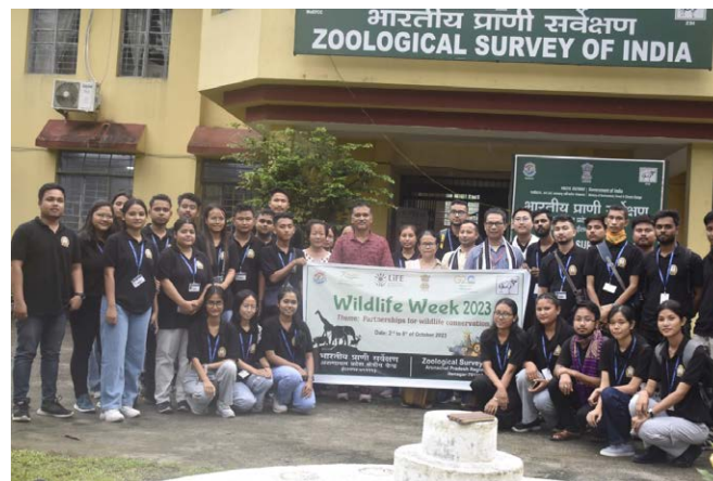
Celebration of Wildlife Week 2023.