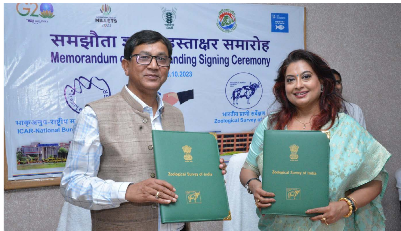
Memorandum of Understanding (MoU) was signed on 6 th October 2023 between Zoological Survey of India and ICAR-National Bureau of Fish Genetic Resources (NBFGR) for research, knowledge sharing and capacity building. In this connection Director ZSI visited the office of ICAR-NBFGR, Telibagh, Lucknow