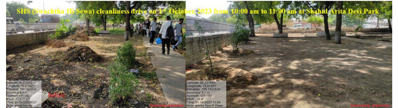
SHS (Swachhta Hi Sewa) cleanliness drive on 1 st October, 2023 from 10:00 am to 11:00 am at Shabli Arita Devi Park

Latitude: 26.237572 Longitude: 73.014571 Elevation: 234.1415 m Accuracy: 5.9 m Azimuth: 171° (S) Pitch: -12.5° (1.24°) Time: 01-10-2023 09:27 Note: Amrita Devi 4g