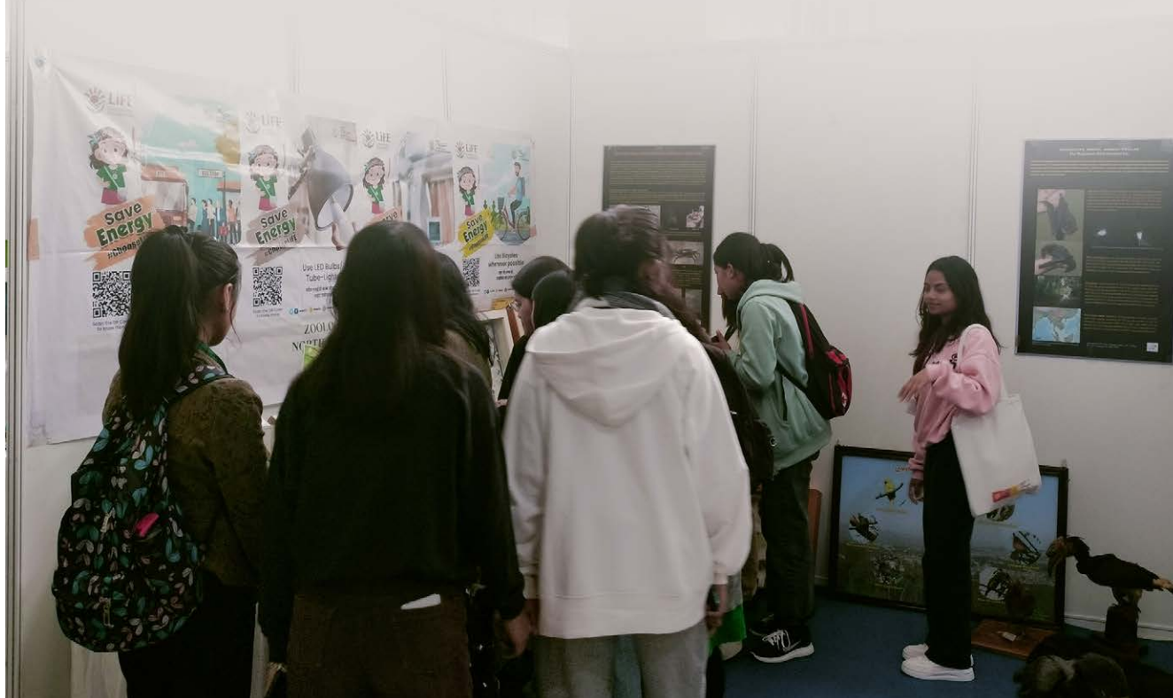
Exhibition stall at the State Convention Centre, Shillong during Wildlife Week 2023.