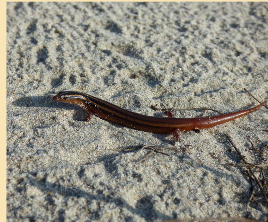
Large – eared Ground Skink Lipiniamacro tympana Stoliczka 1873