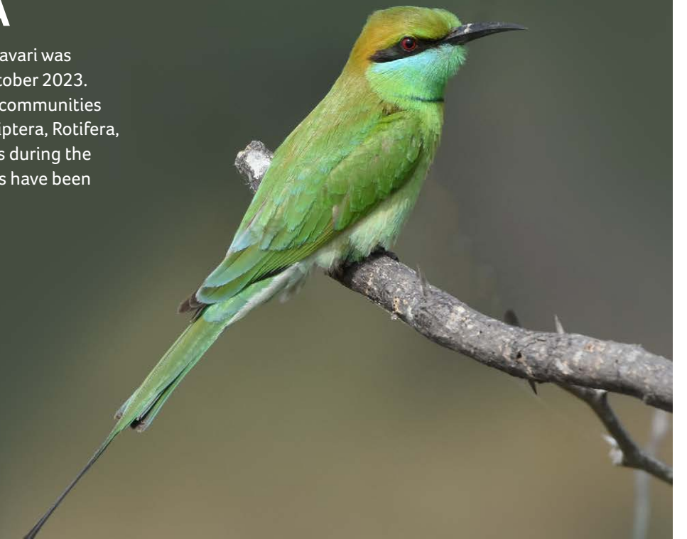
Asian Green Bee-eater · Merops orientalis Latham, 1801

A faunistic survey of River Godavari was conducted from 2 nd to 22 nd October 2023. A total of 87 species of faunal communities belonging to Coleoptera, Hemiptera, Rotifera, Crustacea, Mollusca and Pisces during the month. A total of 12 sequences have been submitted to NCBI.