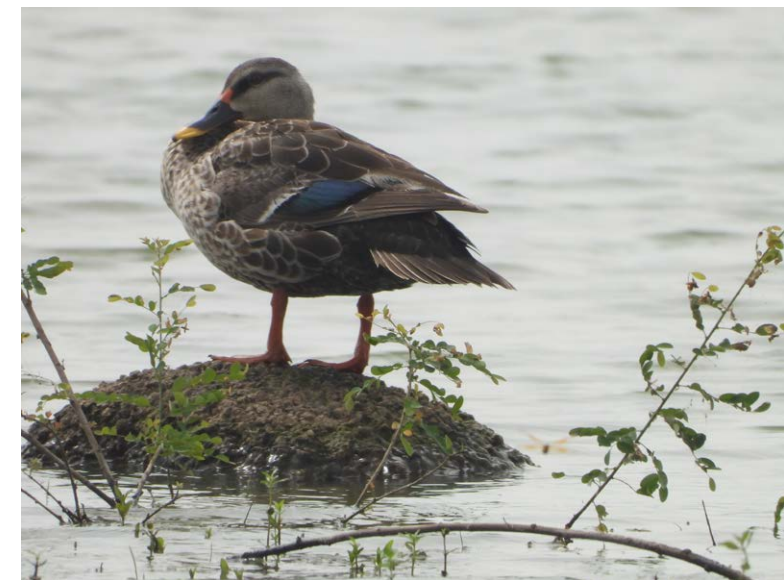
Anas poecilorhyncha Forster, 1781 (Indian spotted billed duck)

A total of 57 species of faunal communities belonging to Mollusca, Insecta, Arachnida, and Pisces were identified during the month. All the officials took the pledge on Vigilance Awareness Week 2023 with the theme "Say no to corruption; commit to the Nation" on 30 th October 2023 at the center, and they participated in the SHS (Swachhta Hi Sewa) cleanliness drive on 1 st October 2023.