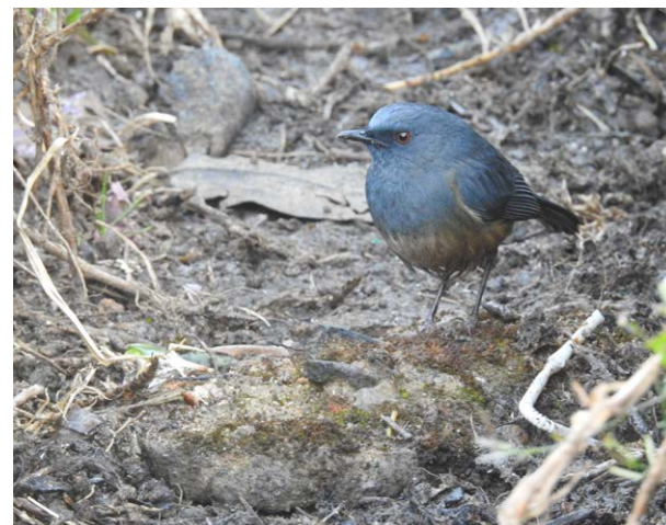
Nilgiri Sholakili ( Sholicola major )