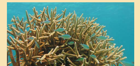
Acropora muricata Linnaeus 1758