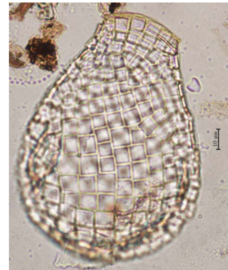
Quadrulella talukensis Bindu, 2023