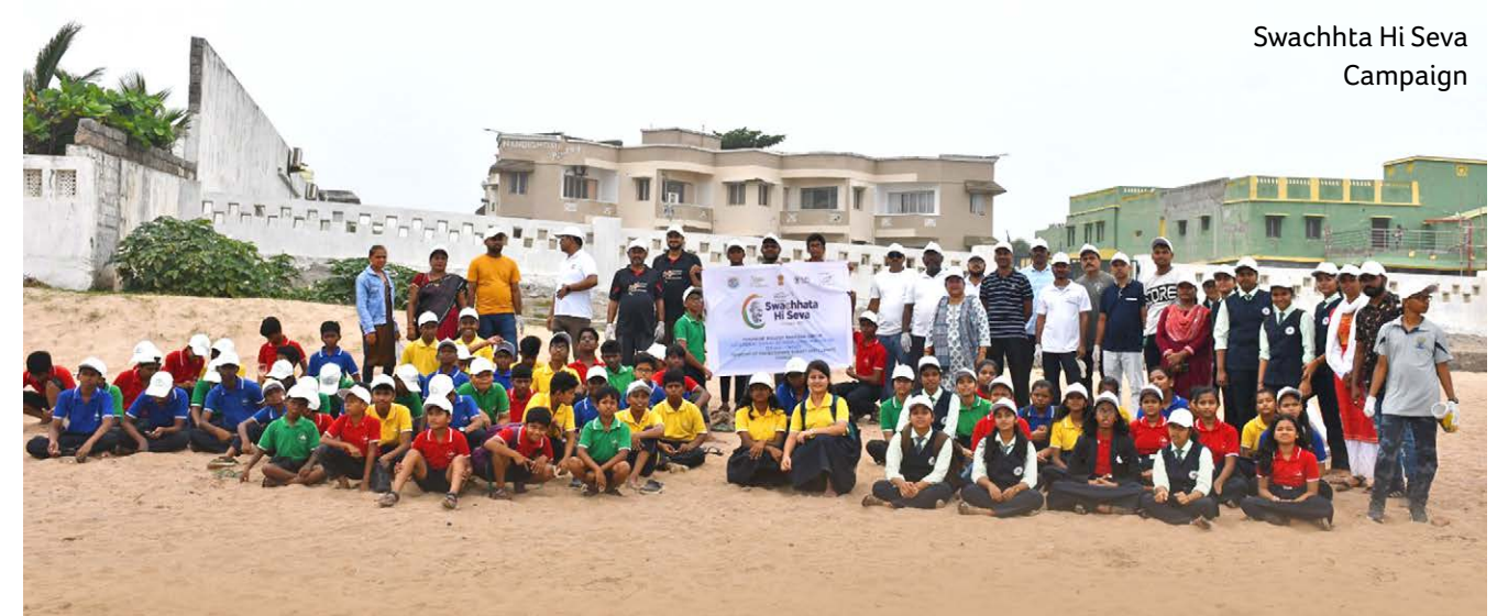
Swachhta Hi Seva Campaign