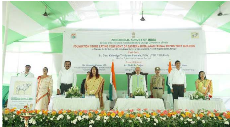
Inauguration of Foundation stone of Eastern Himalayan Faunal Repository Building at ZSI, APRC, Itanagar on 26 th October 2023 by Hon'ble Governor, KT Parnaik & Dr.Dhriti Banerjee, DZSI.