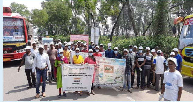
Swachhata Special Campaign 3.0, Swachhata Hi Seva on 1 st October 2023.

Two surveys were conducted on the Daman coast, Tamil Nadu and Pondicherry. A total of 77 species of faunal communities belonging to Polychaete, Mollusca, Nematoda, and Pisces were identified during the month. National Unity Day and Vigilance Awareness Week, 2023 were observed. Office campus along with the garden and residential staff quarter were cleaned and campus beautification was done as a part of Swachhata Hi Seva and Swachha Bharat Mission Special Campaign 3.0. A mass cleaning drive was organized along the Beach Market of Digha on 1 st October 2023. The “SHRAM DAAN” event was organized and nearly 150 participants from various organizations participated in this mass cleaning campaign. A total of 21 educational institutions from Assam, West Bengal, and Odisha visited the Marine Aquarium during the month as part of an educational tour.