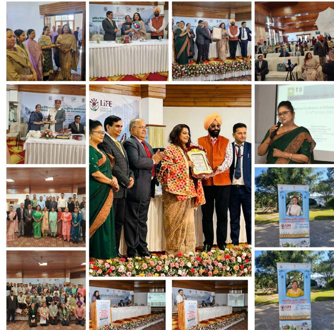
National Conference on Entomology organized by ZSI, Solan on 13 th and 14 th October 2023