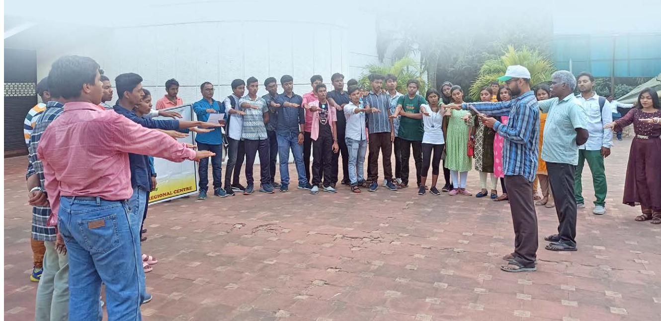
Pledge taking session conducted on the occasion of Rashtriya Ekta Diwas 2023.