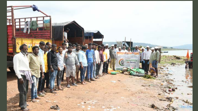
Swachhata Hi Seva Campaign