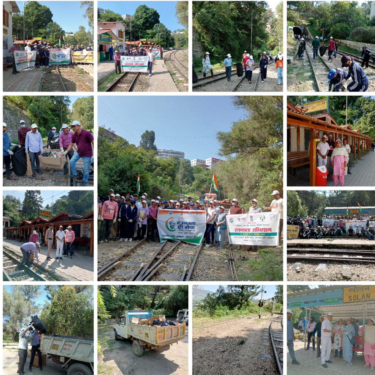
Swacchta Hi Sewa campaign organized at UNESCO World Heritage Site: railway track of Kalka-Shimla at Solan.