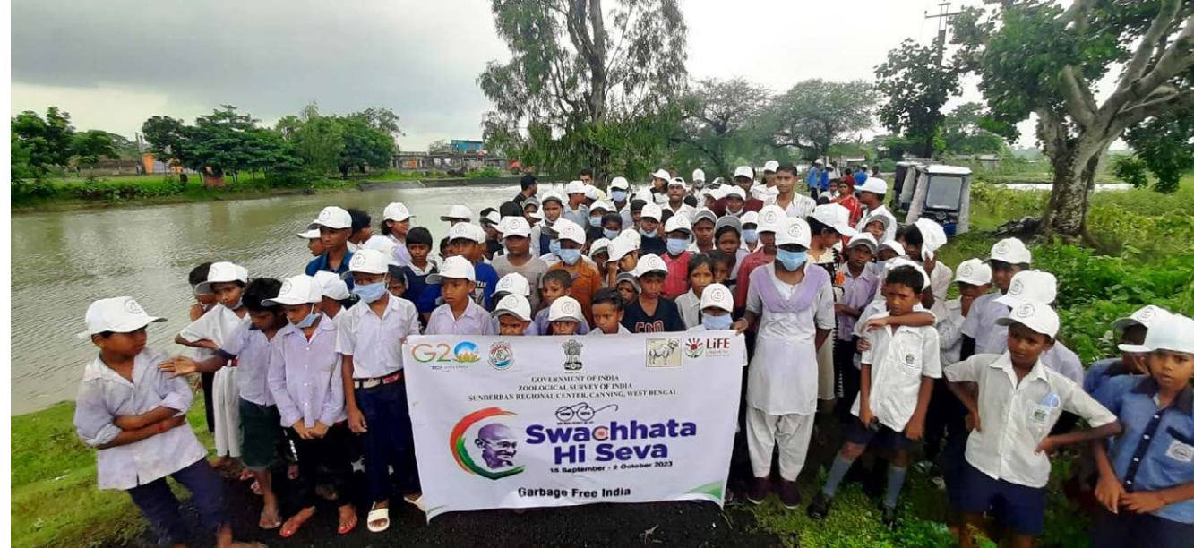
Swachhata Hi Seva Campaign