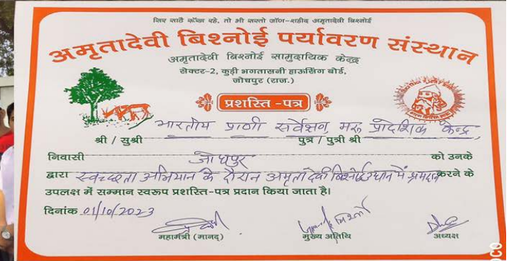
SHS (Swachata Hi Sewa) cleanliness drive by DRC, Jodhpur at Amrita Devi Park

A total of 57 species of faunal communities belonging to Mollusca, Insecta, Arachnida, and Pisces were identified during the month. All the officials took the pledge on Vigilance Awareness Week 2023 with the theme "Say no to corruption; commit to the Nation" on 30 th October 2023 at the center, and they participated in the SHS (Swachhta Hi Sewa) cleanliness drive on 1 st October 2023.