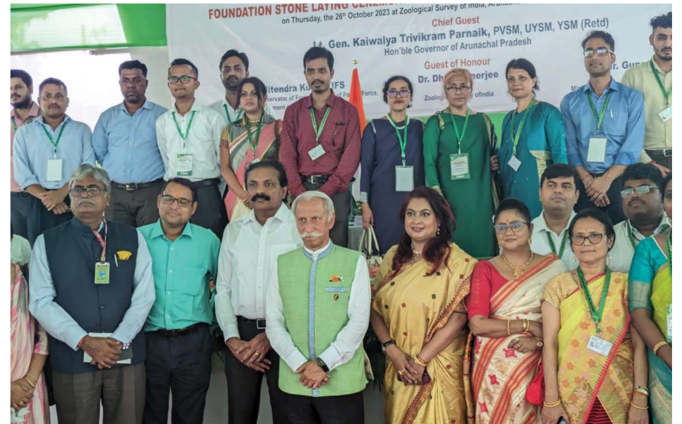
Director ZSI visited APRC, ZSI, Itanagar for the 'Foundation Stone-Laying Ceremony for Eastern Himalayan Repository and inauguration of DNA Lab' of the centre on 26 th October 2023. Hon'ble Governor of Arunachal Pradesh Shri Lt. General Kaiwalya Trivikram Parnaik, PVSM, UYSM, YSM (Retd) was the chief guest of the ceremony. This event is a pivotal moment in the history of APRC and will serve as a testament to the institution's commitment to scientific research and conservation efforts in the Eastern Himalayan region.