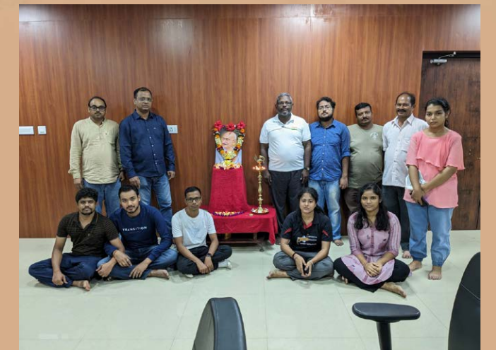
Celebration of Gandhi Jayanti

A new species under the family Gobiidae was described from the Mahanadi River Basin. A total of 87 species of different faunal groups were identified during the month. Five DNA barcodes belonging to 3 species were uploaded to the NCBI database. The Swachhata Hi Seva Beach Cleanup campaign was conducted on 1 st October 2023 at Gopalpur Sea Beach. Mahatma Gandhi Jayanti was celebrated on 2 nd October 2023 and to practice his lifelong message of Non-Violence was taken as a pledge. A Lake Cleaning campaign of Ramsar Site Tampara Lake was organized as part of the Special Campaign 3.0 Programme on 6 th October 2023. As part of the ongoing Special Campaign 3.0 Programme, a round of cleaning of office premises was done on 10 th October 2023. On National Unity Day, a pledge was taken to follow the message of Sardar Vallabhbhai Patel of preserving Bharat's sovereignty & integrity.