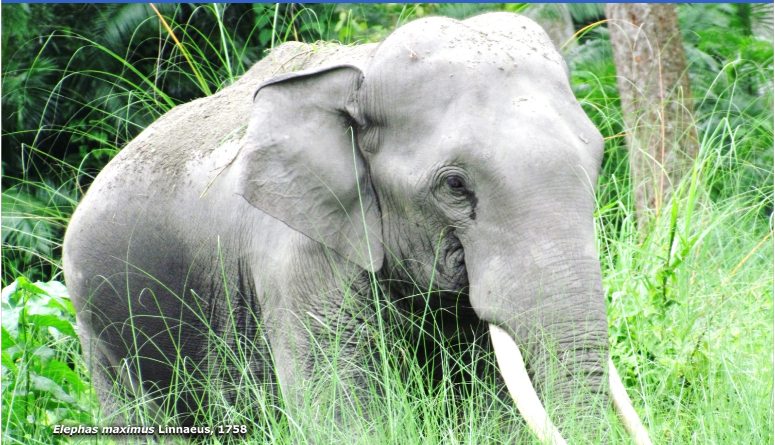
Elephas maximus Linnaeus, 1758