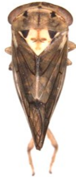
Anritodus atkinsoni (Lethierry, 1889)