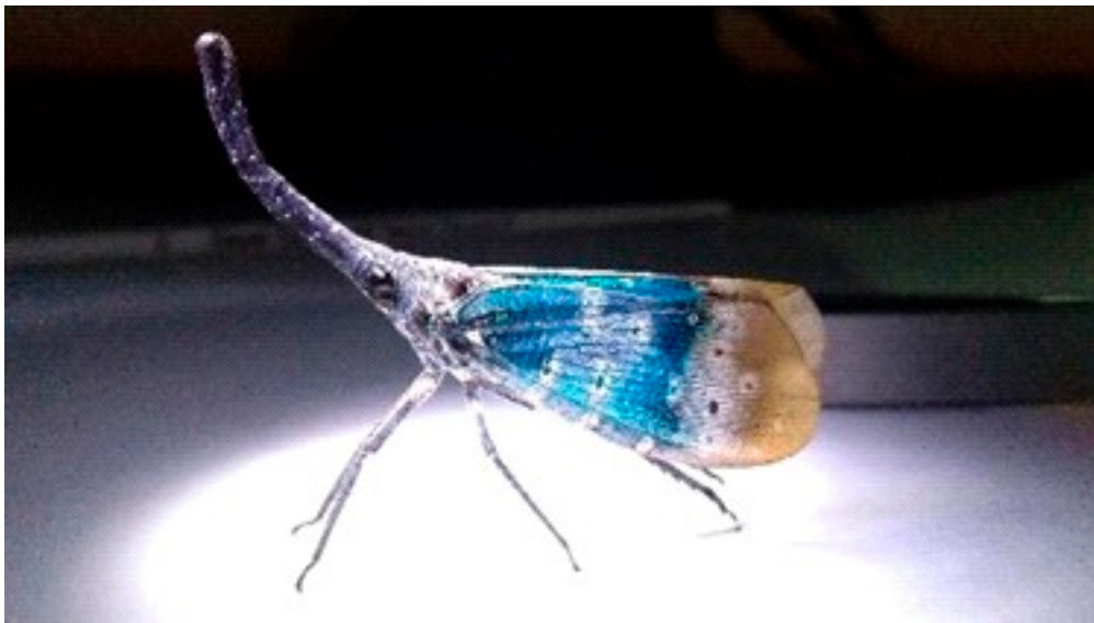
Pyrops rogersi (Distant, 1906) (Hemiptera: Fulgoridae)