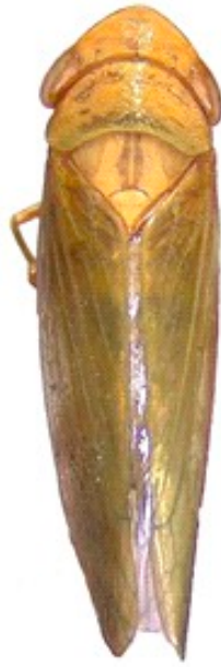
Acostemma walkeri (Kirkaldy, 1900)