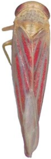
Balclutha rubrostriata (Melichar, 1903)