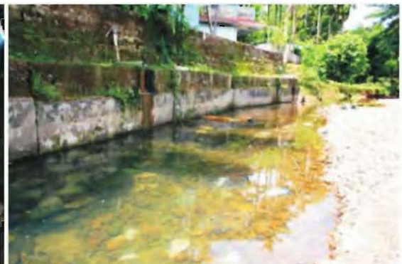
Human habitation, altered and polluted streams at Wimberly Gunj