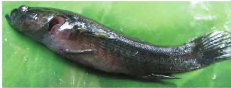
Eleotris fusca (See page 8)