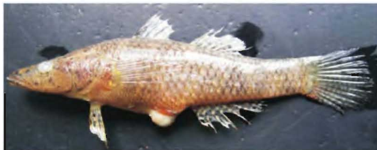
Butis butis (see page 8)