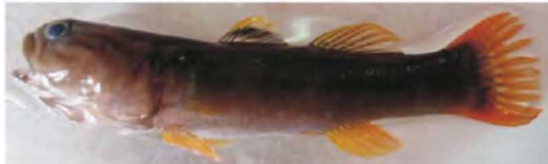
Belobranchus sp. (to be named by Rajan and Sreeraj) (see page 8)