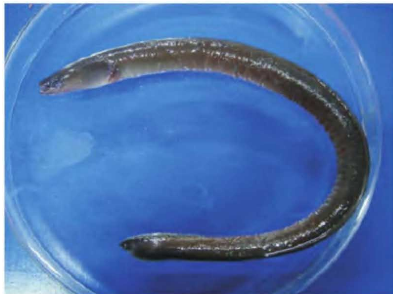
Anguilla bicolor bicolor