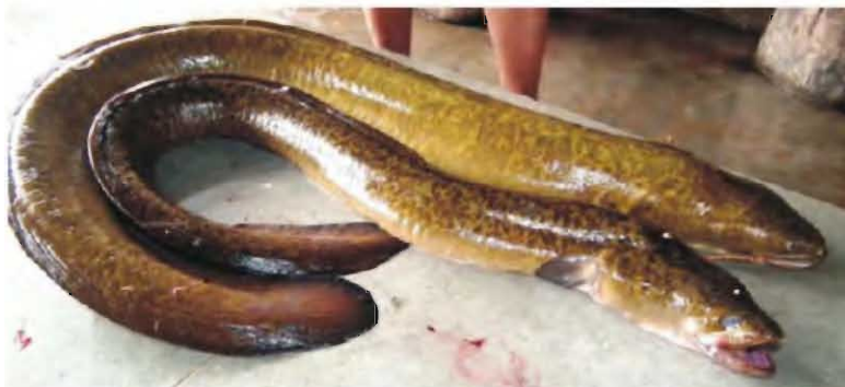
Anguilla bengalensis bengalensis