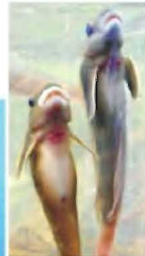
Sicyopterus microcephalus using the mouth and pelvic fins alternately as suckers to climb