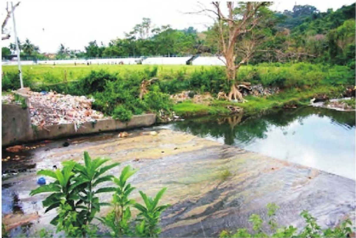
Dumping of inorganic waste materials into the stream, Wimberly Gunj, South Andaman