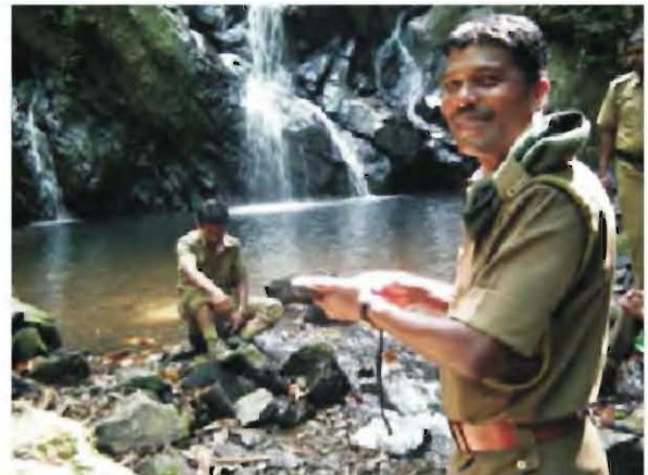
Study tour for forest officials, waterfall, Mannarghat