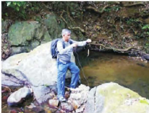
Fish collection with Hook and line