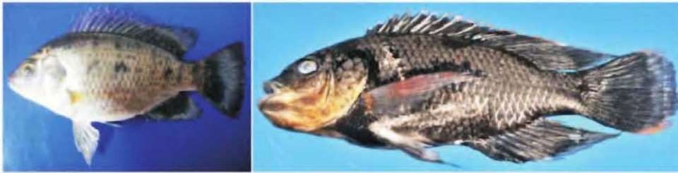
Oreochromis mossambicus (see page 7)