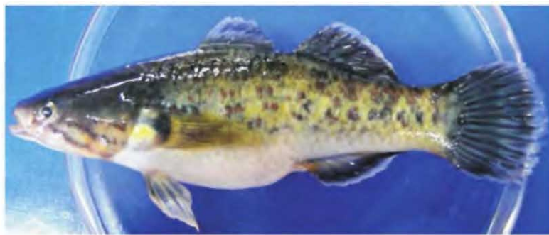
Giuris margaritacea (See page 8)