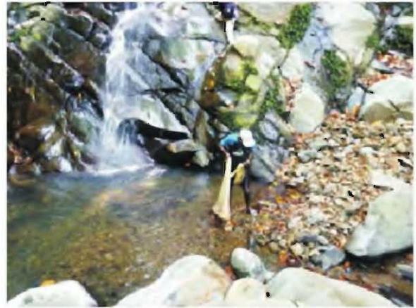
Freshwater pool and cast netting in the waterfall, Shoal bay, South Andaman