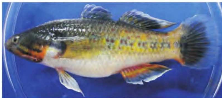
Giuris margaritacea (See page 8)