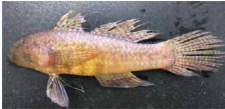
Exyrias puntang (Bleeker, 1851)