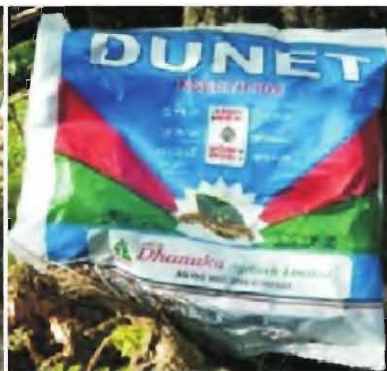
Insecticide used for catch fish by settlers