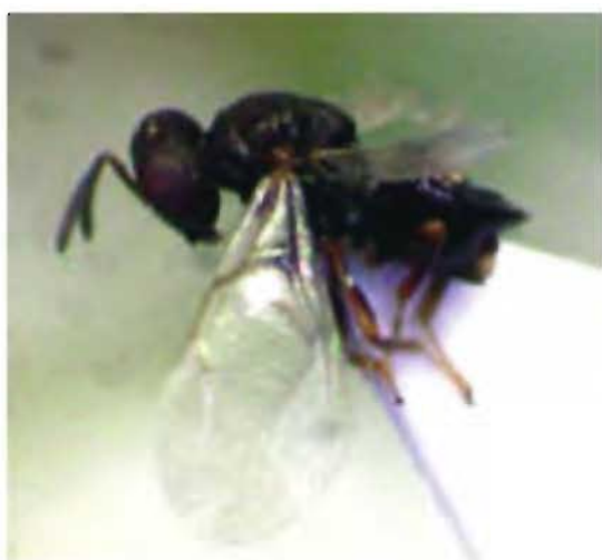
8. Schizonotus latus (Walker), female.

Diagnostic characters : Female: Length 2.4-2.5mm. Body brownish black; clypeus not projecting below level of genae; antennae dark brown with scape and pedicel testaceous, anelli together almost equal to width of second anellus; F2 1.2-1.5x as wide as long. Propodeum with distinct median carina and plicae.