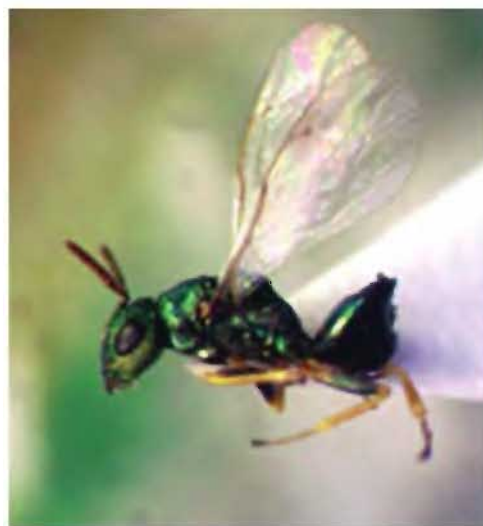
5. Halticoptera smaragdina (Curtis), female

1969. Halticoptera smaragdina (Curtis): Graham, Bull. Br. Mus.nat.Hist.Ent.Suppl. 16,159.