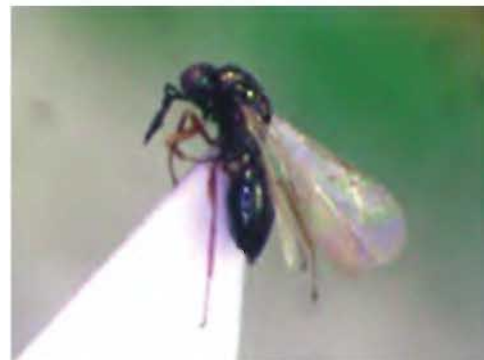
6. Asaphes suspensus (Nees), female

Diagnostic characters : Female: Length: 1.5-1.6mm. Body brownish black with metallic blue reflection, propodeum and petiole less bright; antennae black; legs except coxae testaceous, femora more or less infusate. Head and thorax with rather less numerous bristles. Pronotal collar with the