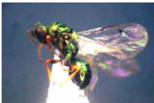
7. Sphaeripalpus lacunosus Huang, female

dark brown. Scutellum with frenum clearly marked; dorsellum punctulate. Gaster punctuate; petiole 2x as broad as long with transverse crests both anteriorly and posteriorly.