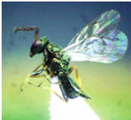
3. Pteromalus puparum (Linnaeus), female

Material examined: 1 F, Hemis N.P, N 33°54' 51.8" E 77°42' 46.4", Alt. 3568 m, Ladakh range, 5.vii.2008 (Reg.No. A.1220); 2 F, Hunder, N 34°34' 48.8" E 77°28' 45.4", Alt. 3190 m, Ladakh range, 7.vii.2008 (Reg.No.A.1225, 1227); 1F, Trishak, N 34°28' 40.11" E 77°43' 52.58", Alt. 3236 m, Nubra valley, 8.vii.2008 (Reg.No.A.1223); 2F, Sumdho, N 33°13' 51" E 78°22' 18.8", Alt. 4427 m, Changthang valley, 12.vii.2008 (Reg.No.A. 1222, 1226); 1F, 3 km to Chanthang from Mahe bridge, N 33°21' 32.7" E 78°21' 23.9", Alt. 4051 Metre Changthang valley, 12.vii.2008 (Reg.No. A.1221); 1F, Nimmu, N 34°09' 35.31" E 77°53' 20", Alt. 3535 m, Ladakh range, 5.vii.2008, (Reg.No. A.1224).