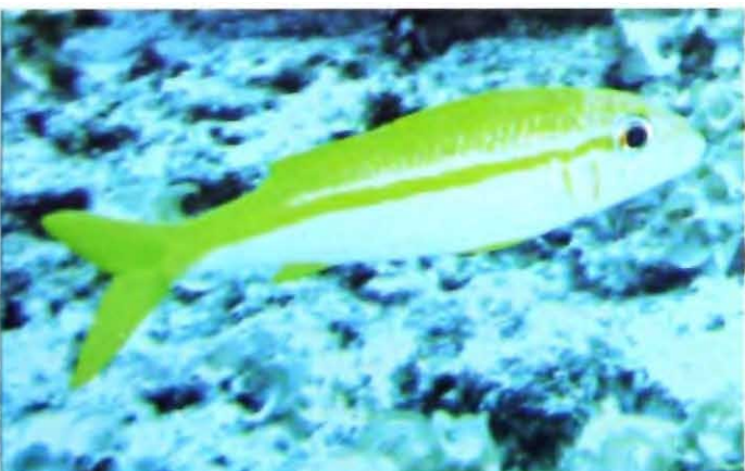
Mulloidichthys vanicolensis (Valenciennes) 26 cm SL.