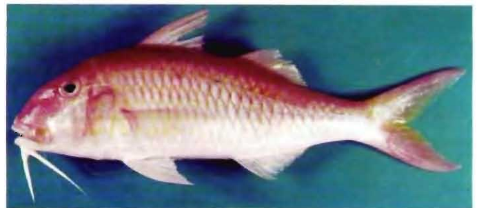
Parupeneus heptacanthus (Lacepede) 22 cm SL.