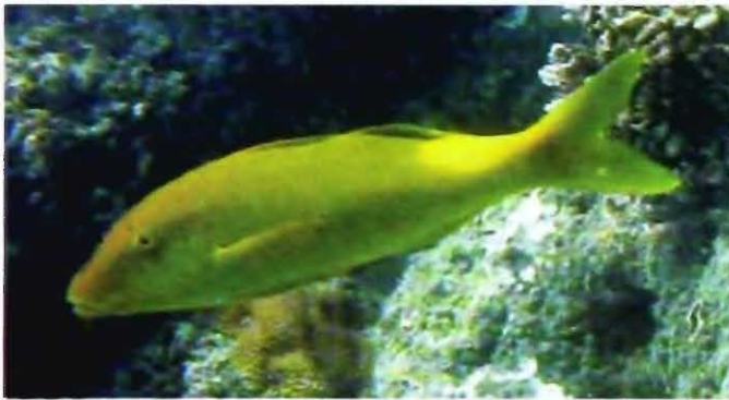
Parupeneus cyclostomus Yellow phase.