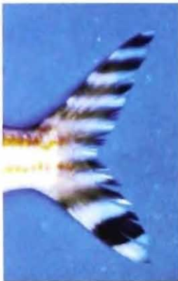
Upeneus vittatus (7-9 bars).