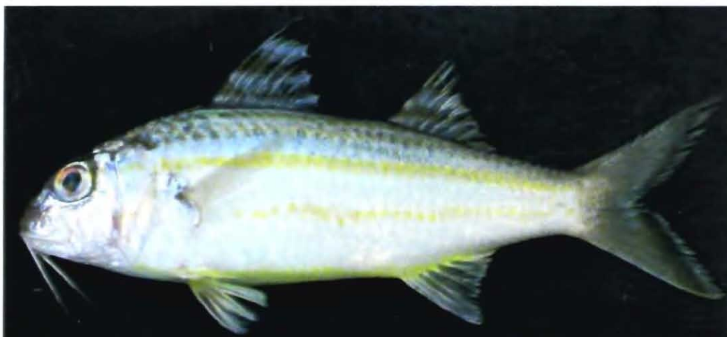
Upeneus sulphureus Cuvier 13 cm SL.