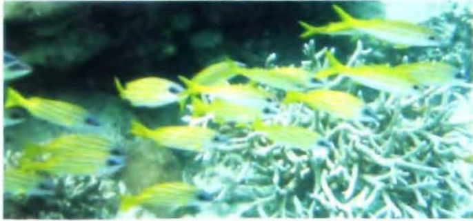
Fig. 1. Yellowfin goatfish ( Mulloidichthys vanicolensis ) congregating with blue-striped snappers ( Lutjanus kasmira ).