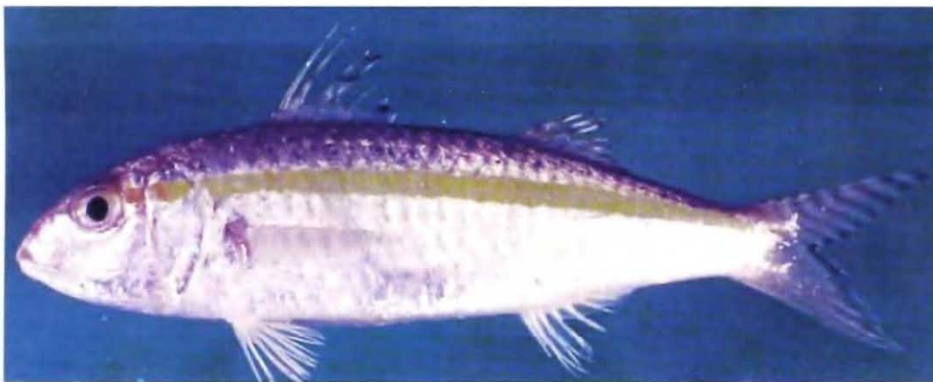
Upeneus moluccensis (Bleeker) 15 cm SL.