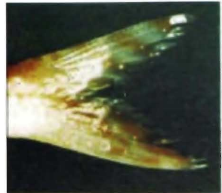
Upeneus guttatus (10-12 bars).