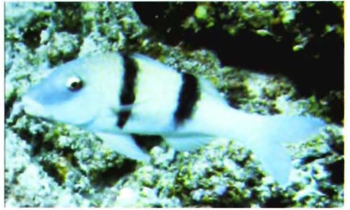
Parupeneus trifasciatus (Lacepede) 28 cm SL.