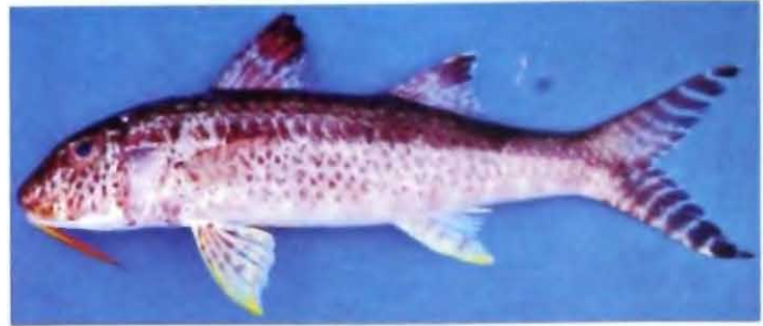
Upeneus tragula Richardson 26 cm SL.