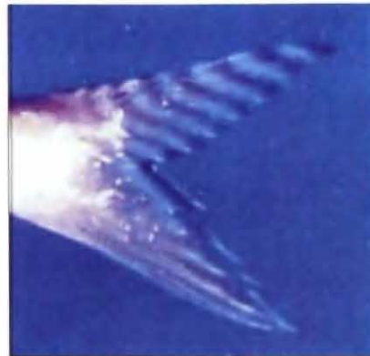
Upeneus moluccensis (6-8 bars on upper lobe only).