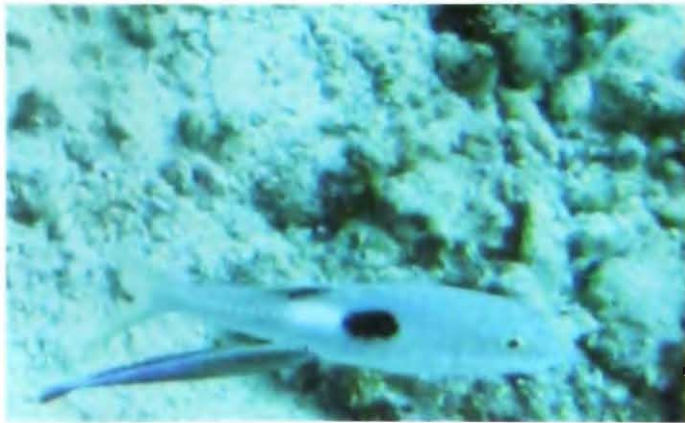
Parupeneus pleurostigma (Bennett, 1831) 24 cm.