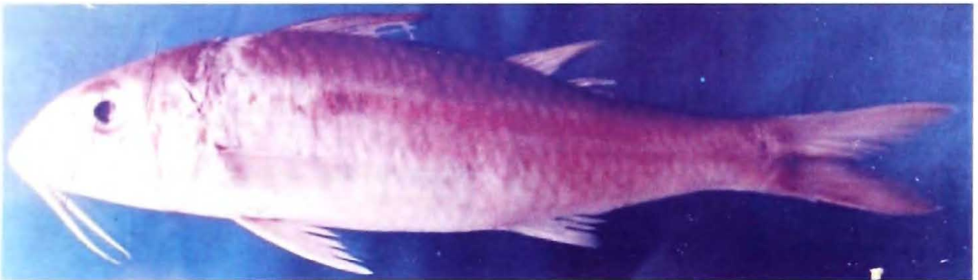
Mulloidichthys flavolineatus (Lacepede) 28 cm SL.