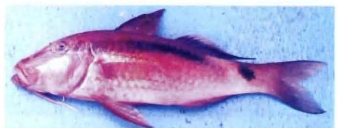
Parupeneus macronemus (Lacepede) 22 cm SL.