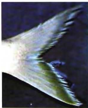
Upeneus sulphureus (no bar).