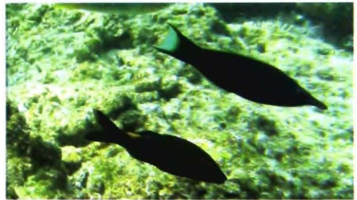
Fig. 2. ( Parupeneus cyclostomus ) dark phase with the terminal male of Gomphosus caeruleus (Family : Labridae).