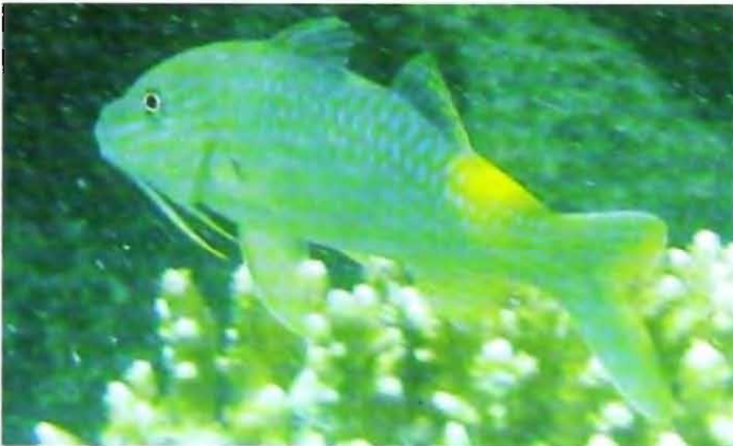
Parupeneus cyclostomus Blue colour.