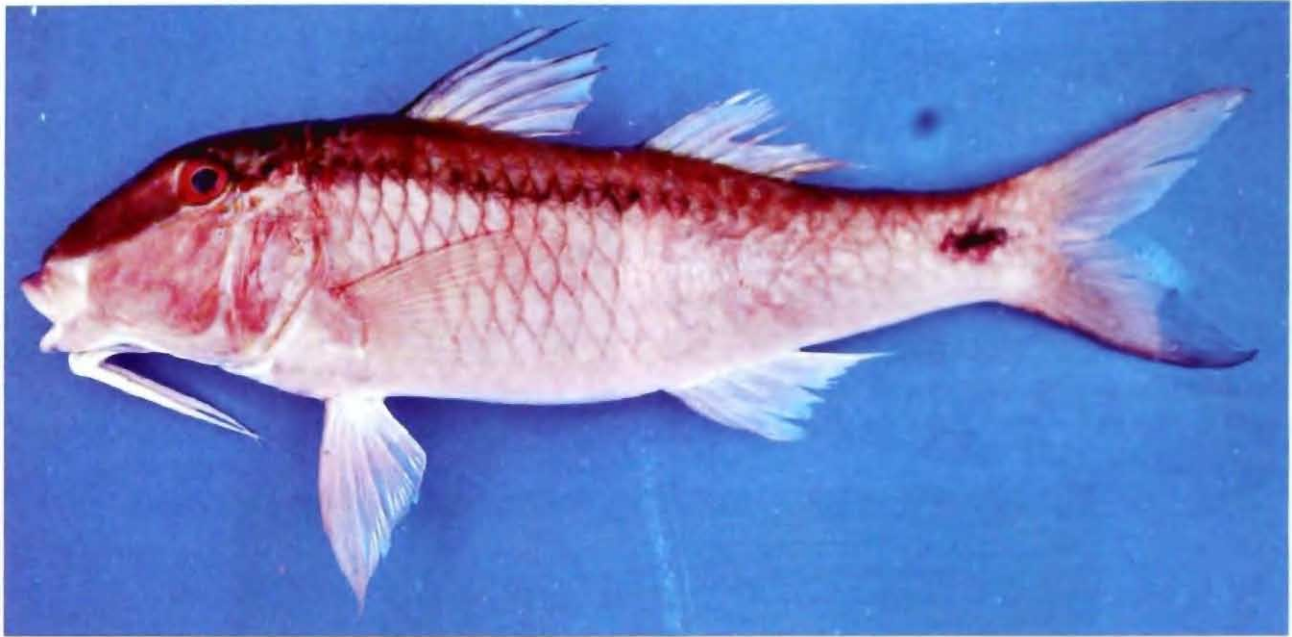
Parupeneus barberinus (Lacepede) 36 cm SL.