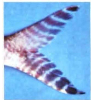
260 mm (14-15 bars).

Upeneus tragula (in larger specimen the number of caudal bar is more).