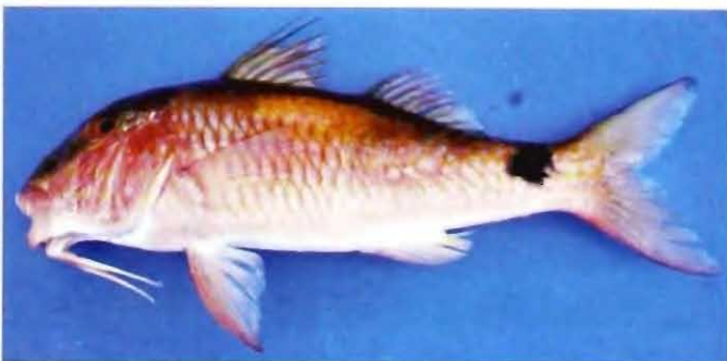
Parupeneus indicus (Shaw) 32 cm SL.