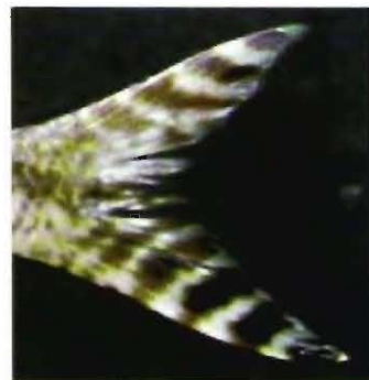
140 mm (9-10 bars).