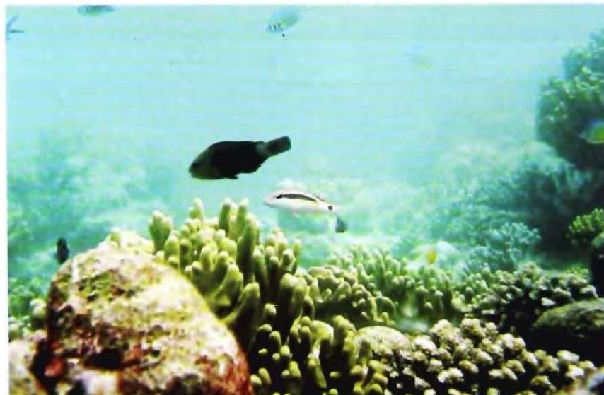
Fig. 4. Association of goatfish Parupeneus macronemus with parrotfish Scarus bleekeri (Initial phase).

Upeneus tragula (in larger specimen the number of caudal bar is more).