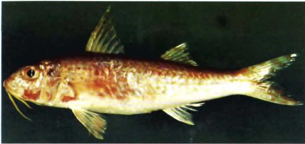
Upeneus guttatus (Day) 18 cm SL.