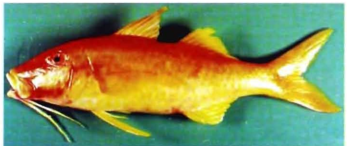
Parupeneus cyclostomus (Lacepede) 31cm SL.