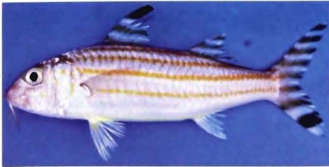
Upeneus vittatus (Forsskal 1775) 21 cm SL.