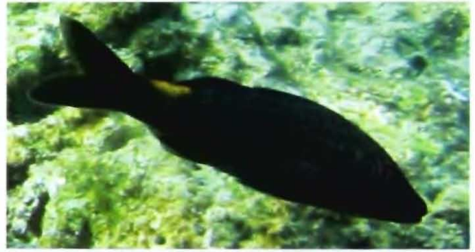
Parupeneus cyclostomus Dark phase.