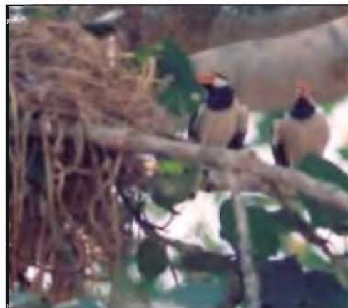
Asian Pied Starling