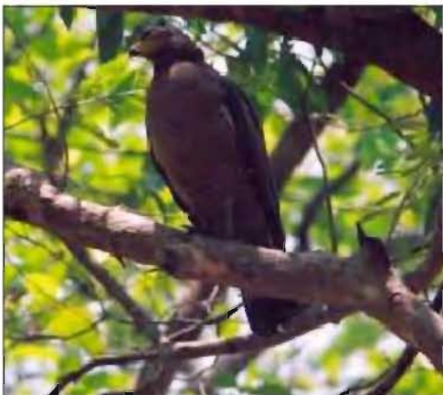
Crested Serpent Eagle