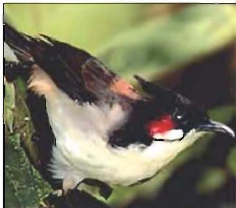
Red-Whiskered Bulbul