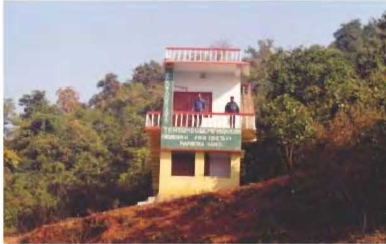
Eco-Tourist Tower House Hadgarh WLS at Zero point.