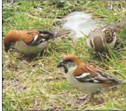
House sparrow