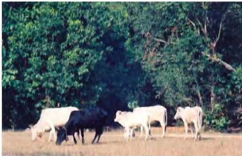
Cattle grazing inside the Forest at Dalki, Hadgarh WLS.