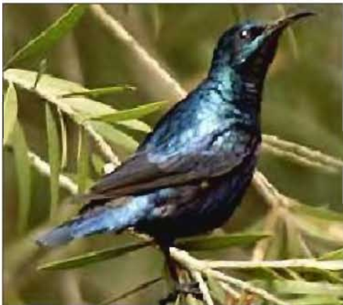
Purple Sunbird