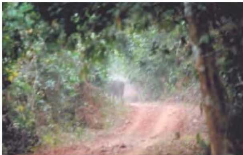
Wild Elephant Sighting inside Pitanau Forest, Hadgarh WLS.