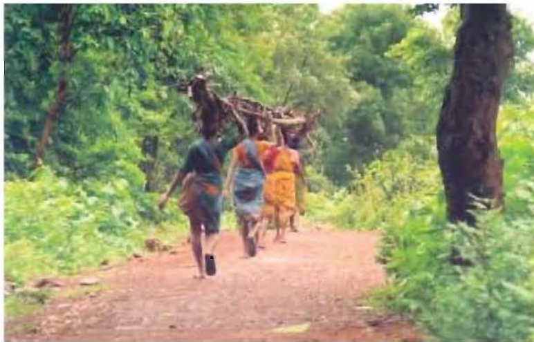
Villagers carrying forest wood at Pitanau, Hadgarh WLS.