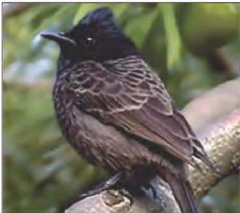
Red Vented Bulbul