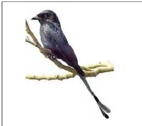
Indian Black Drongo