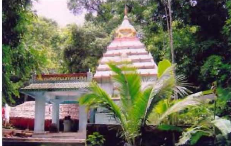
Temple inside the Hadgarh WLS.