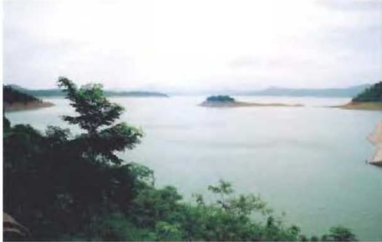
Hadgarh Dam at Zero point