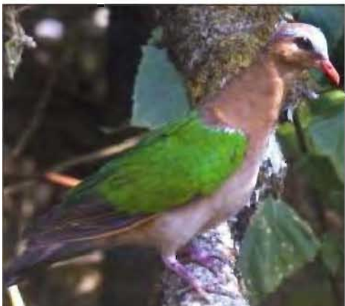
Bengal Green Pigeon