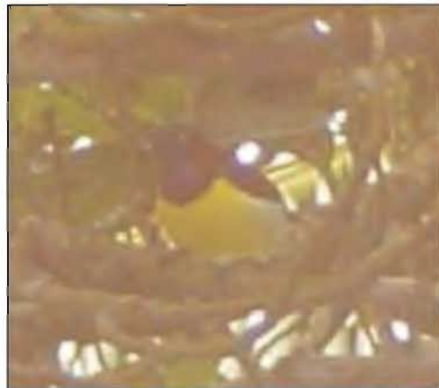
Purple Rumped Sunbird