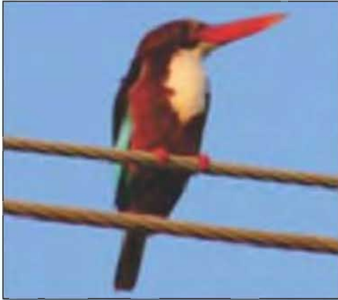
White Breasted King Fisher