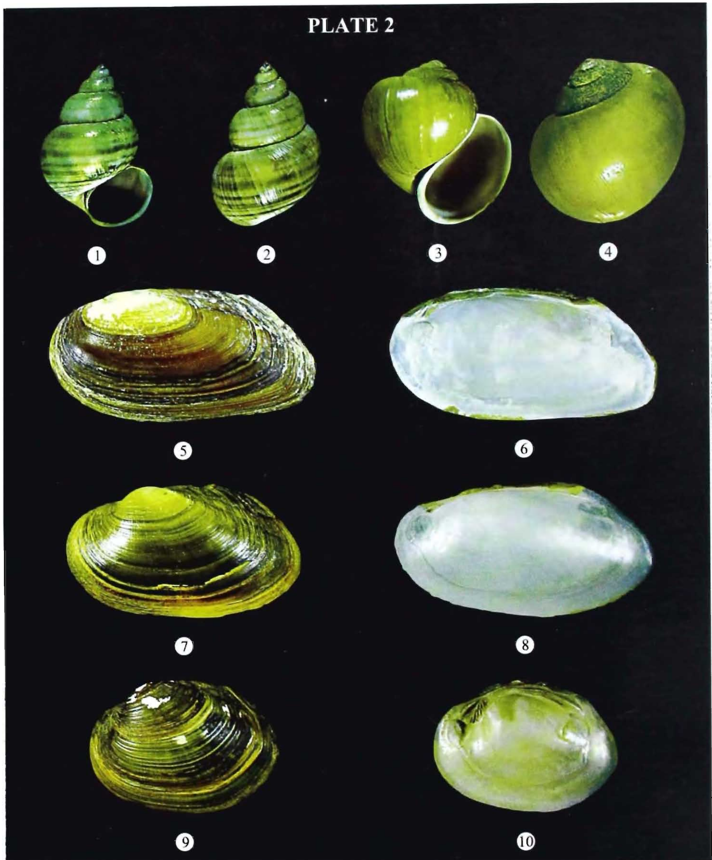
Fig. 1 & 2 : Ventral and Dorsal view of Bellamya bengalensis f. mandiensis (Kobelt) Fig. 3 & 4 : Ventral and Dorsal view of Pila globosa (Swainson) Fig. 5 & 6 : Exterior and Interior view of Lamellidens corrianus Lea Fig. 7 & 8 : Exterior and Interior view of Lamellidens marginalis (Lamarck) Fig. 9 & 10 : Exterior and Interior view of Parreysia (Parreysia) flavidens (Benson)