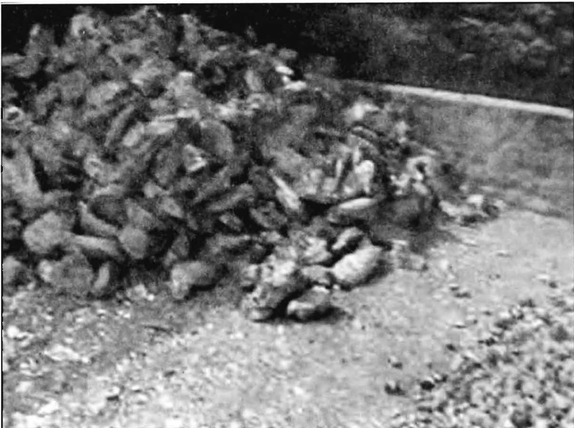
Fig. 9 : A view of oyster shells deposited at Canning Shell Factory, Canning, West Bengal.