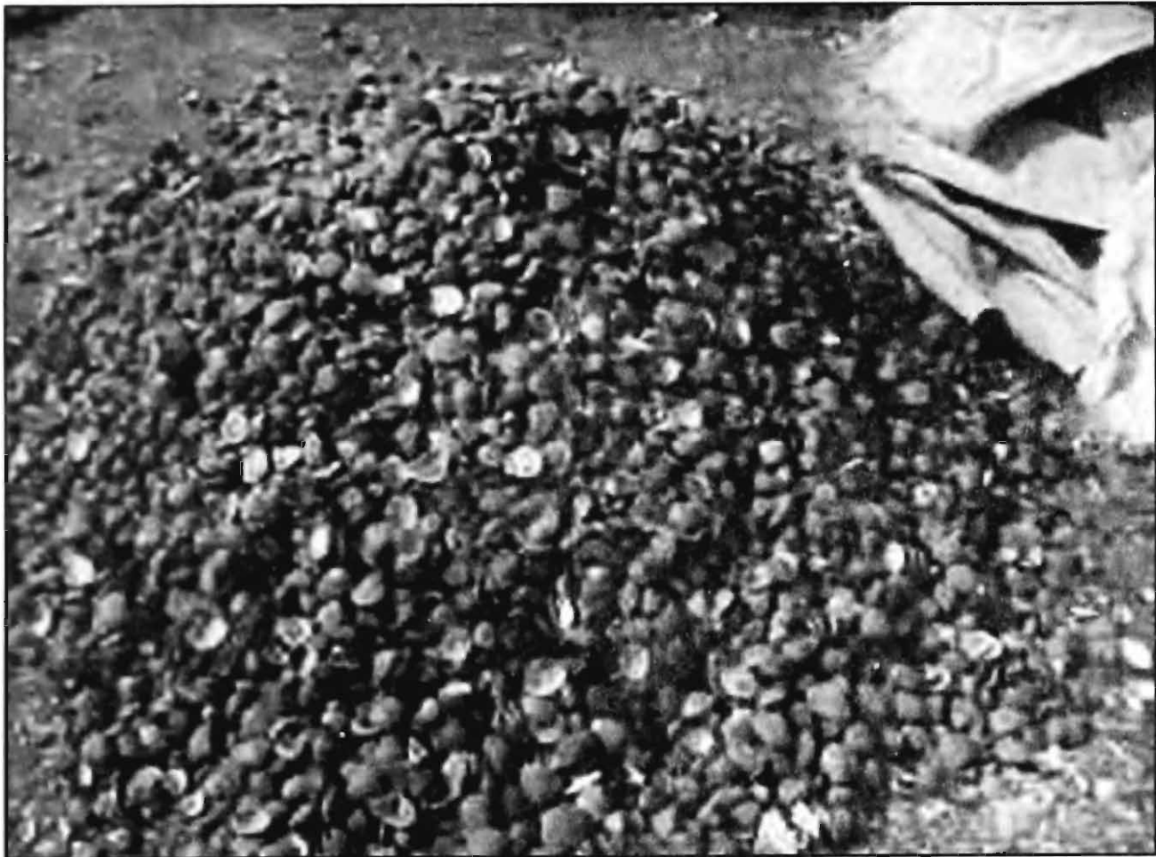
Fig. 7 : A view of Meretrix shells deposited at Canning Shell Factory, Canning, West Bengal.