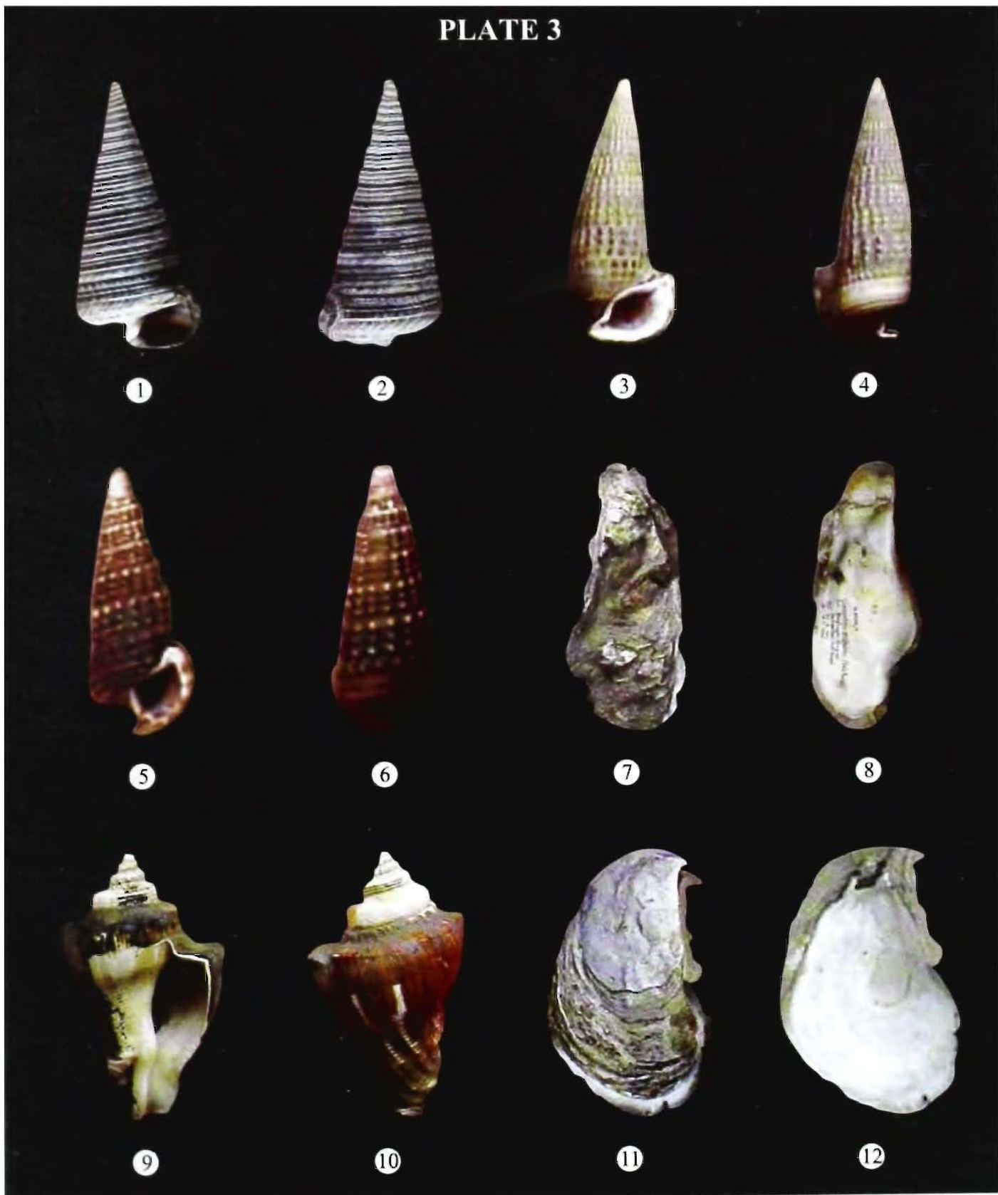
Fig. 1 & 2 : Ventral and Dorsal view of Telescopium telescopium (Linnaeus) Fig. 3 & 4 : Ventral and Dorsal view of Cerithidea alata (Philippi) Fig. 5 & 6 : Ventral and Dorsal view of Cerithidea cingulata (Gmelin) Fig. 7 & 8 : Exterior and Interior view of Crassostrea gryphoides (Schlotheim) Fig. 9 & 10 : Ventral and Dorsal view of Pugilinus cochlidium (Linnaeus) Fig. 11 & 12 : Exterior and Interior view of Crassostrea cuttackensis (Newton and Smith)