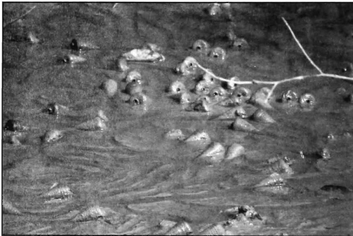
Fig. 1 : Telescopium shells crawling on the mud at Lothian Island, Sundarbans.

Economic importance : Economically these shells are important. In many parts of India (Andhra Pradesh and Tamil Nadu) they are used for the preparation of quick lime. In Sundarbans (West Bengal) these shells are collected in huge quantities and brought to Canning where they are crushed into powdered and use as calcium resources in the poultry feed.