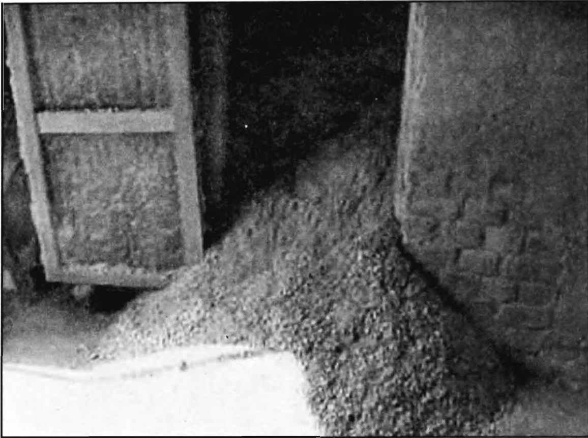
Fig. 8 : A view of shell factory from where powdered shells are collected and used in poultry feed.