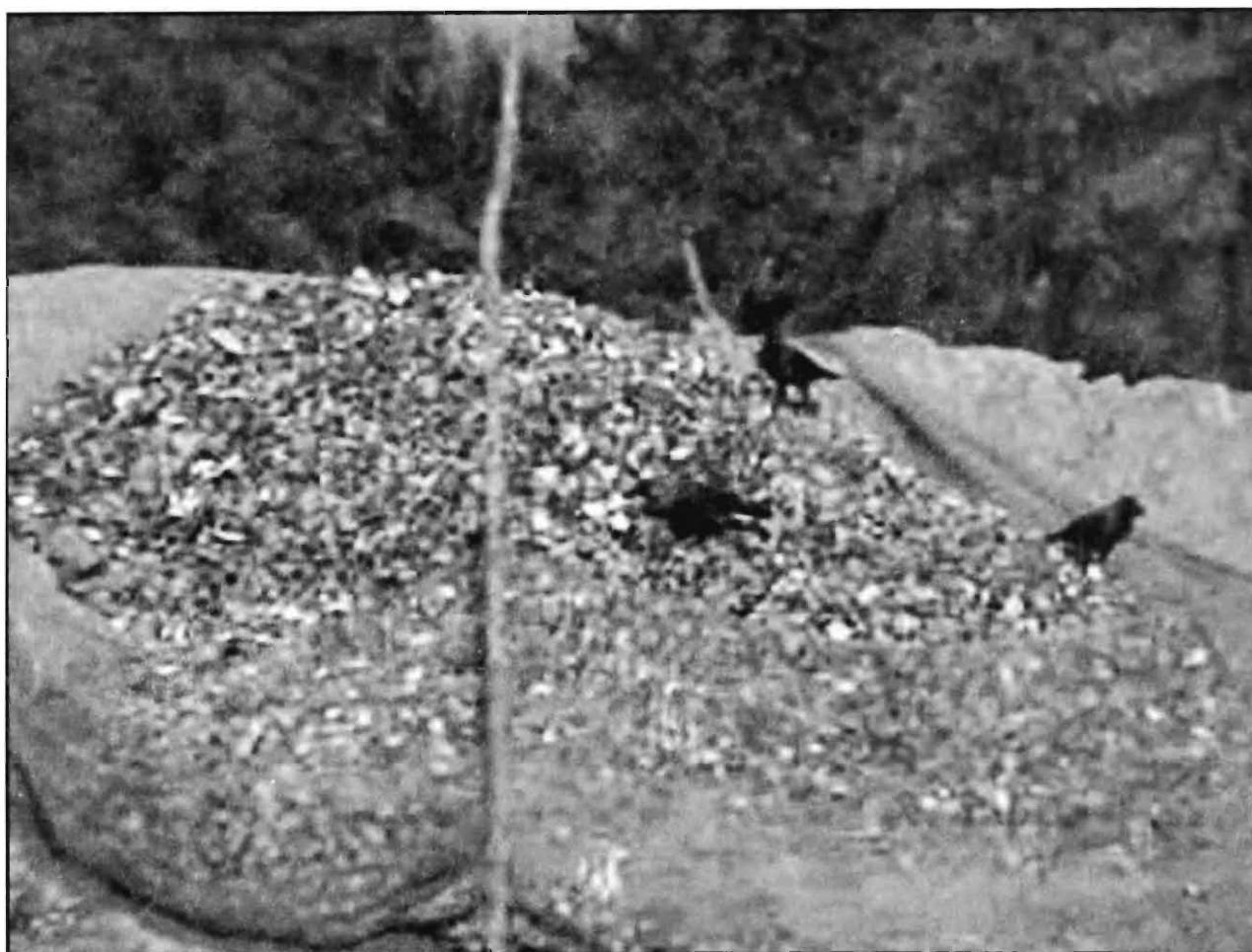
Fig. 6 : Heap of Meretrix shells at Chandipur collected for making poultry feed.

Found in the mud of river bed and highly populated on the river mouth. Population recorded 2320 to 2800 no/m 2 in port Canning, Parsemari and other places.