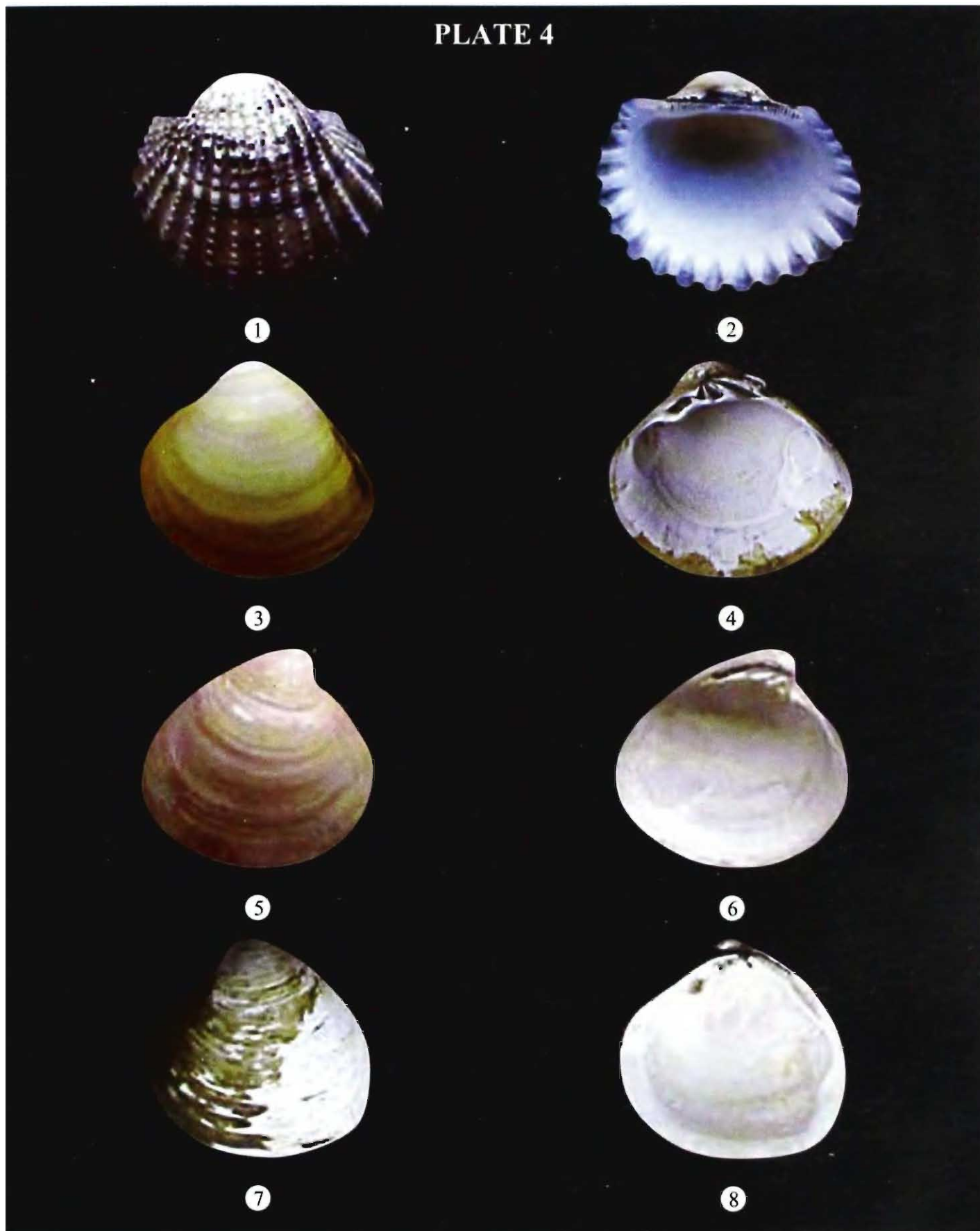
Fig. 1 & 2 : Exterior and Interior view of Anadara granosa (Linnaeus) Fig. 3 & 4 : Exterior and Interior view of Meretrix meretrix (Linnaeus) Fig. 5 & 6 : Exterior and Interior view of Pelecycora trigona (Reeve) Fig. 7 & 8 : Exterior and Interior view of Polymesoda (Geloina) bengalensis (Lamarck)