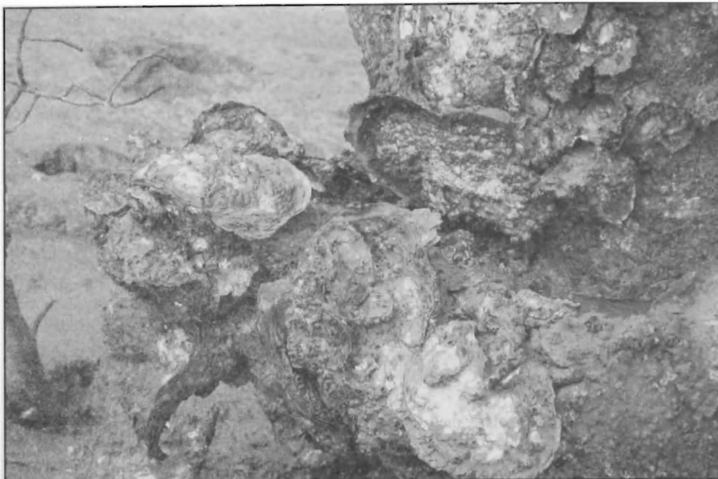
Fig. 3 : Crassostra cutackensis (Newton and Smith) attached on the concrete pillar of jetty at Lothian Island, Sundarbans.