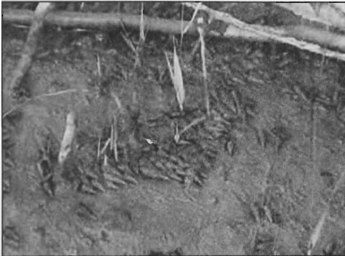
Fig. 2 : Cerithidea spp. crawling on the mud at Jharkhali.

plane; siphonal sinus hollow and short, outer lip reflects over the sinus; sculpture with rounded, somewhat rectangular, close set axial nodules, three on each whorl; greyish brown, inner white.