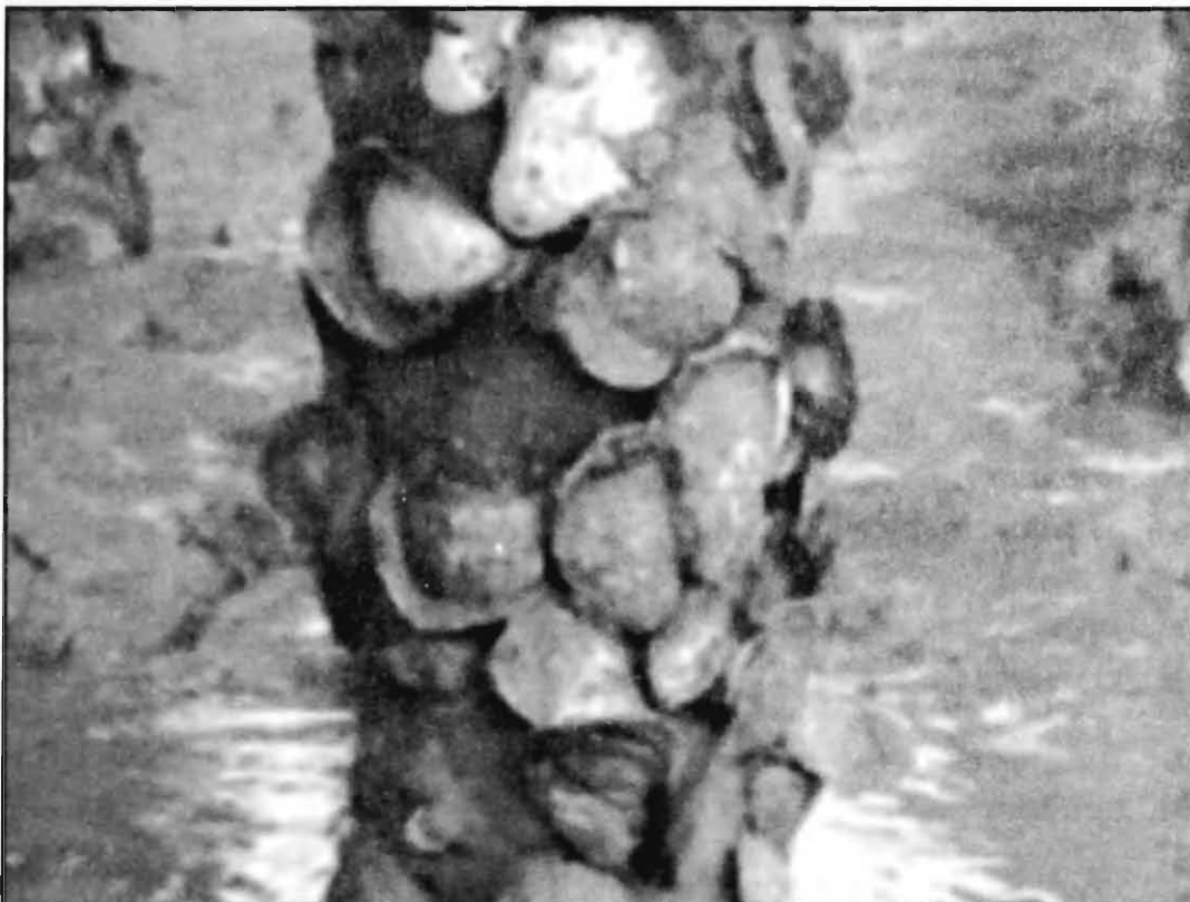
Fig. 5 : Crassostrea sp. attached on a pillar of jetty at Gosaba.