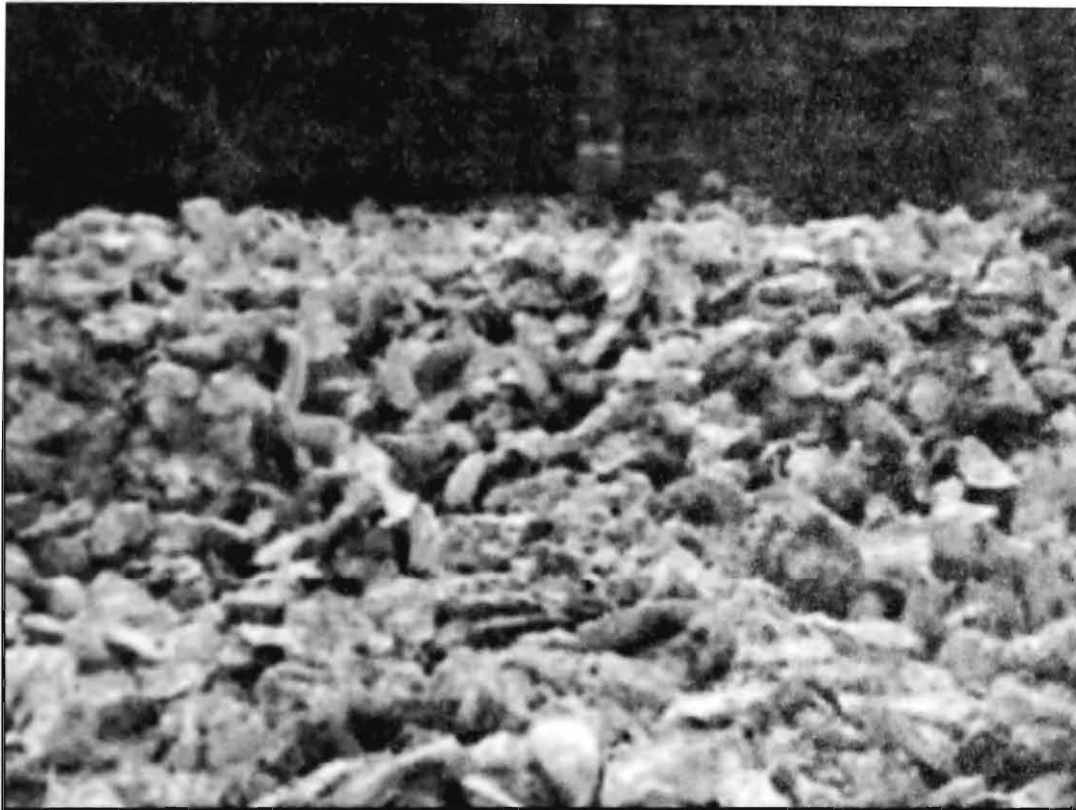
Fig. 4 : Heap of oyster shells at Canning shell factory.