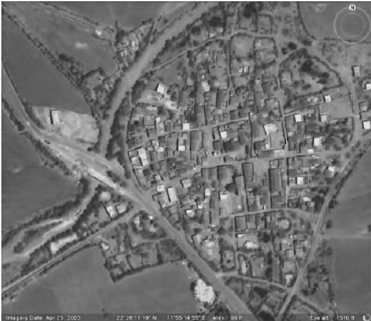
Text-Fig. 2 : Aerial view of Rangpur village and the archaeological site

than the landward slopes. A radial pattern of drainage has developed in Kathiawar streams flowing in different directions from the central highland. The Bhadar and Shetrunji are two large rivers.