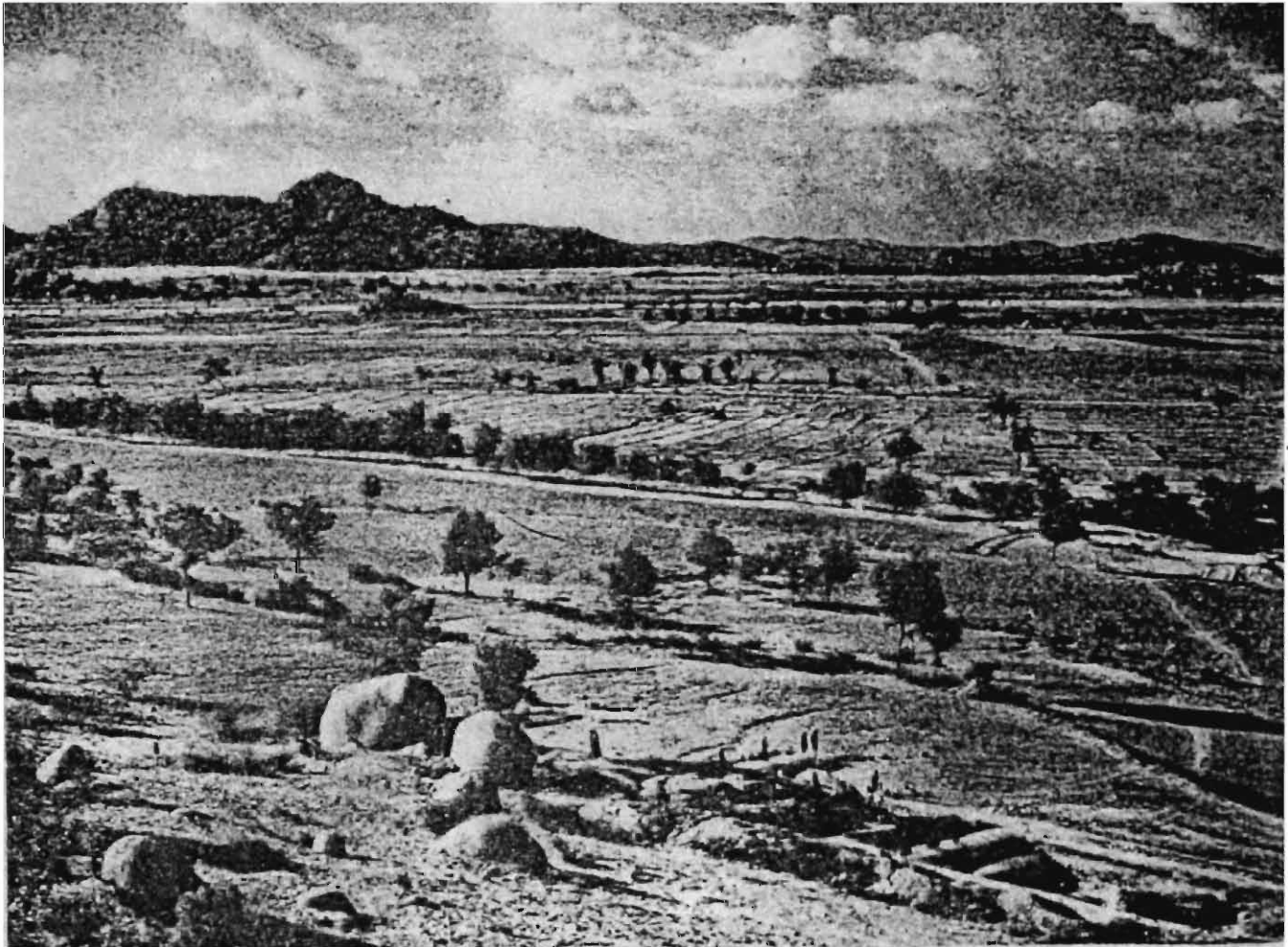
Fig. 3. View of Brahmagiri Archaeological site; Foreground right hand corner : Cuttings Br. 21-23 (After Wheeler, 1959).

in this area. Many of these were removed for agricultural practices by the modern people but quite a few survived till Krishna's excavation.