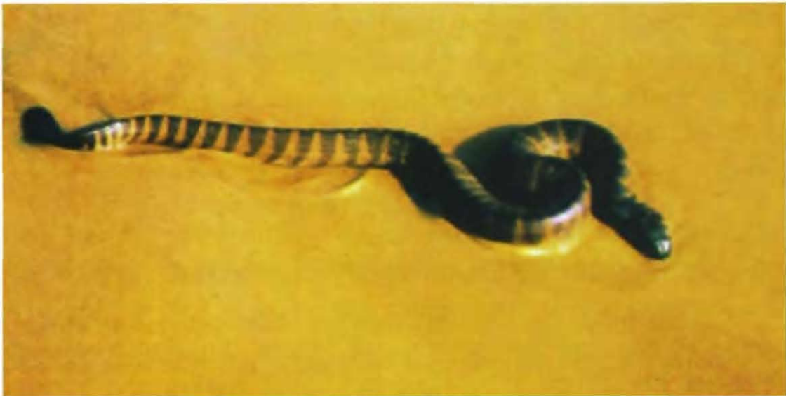
Fig. 9. Short sea snake, Lapemis curtus .

compressed laterally throughout, covered with hexagonal or squarish scales which do not overlap one another; the scales adjacent to the belly scales are slightly larger than the other; scale rows 33-39 (in males), 36-43 (in females); ventrals small, distinct anteriorly, narrower or absent, or vestigial, 154-168 (in males), 160-194 (in females); preanals slightly enlarged.