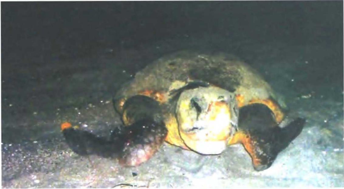
Fig. 8. Olive ridley sea turtle. Adult.

incubation period varies from 50 to 70 days. The Gahirmatha beach, located within the Bhitarkanika Wildlife Sanctuary, Orissa, is the world's largest nesting ground for the Olive ridley, where the turtles nest en masse annually with considerable variation in the number of nesting females numbering from some tens of thousands to several lakhs. Since the discovery of the mass nesting of the turtle on Gahirmatha beach in 1970s, two more nesting grounds (rookeries) of the species were discovered in the same State (Orissa). The nesting grounds of the Olive ridley have attracted the attention of the scientific community as well as that of the conservationists.