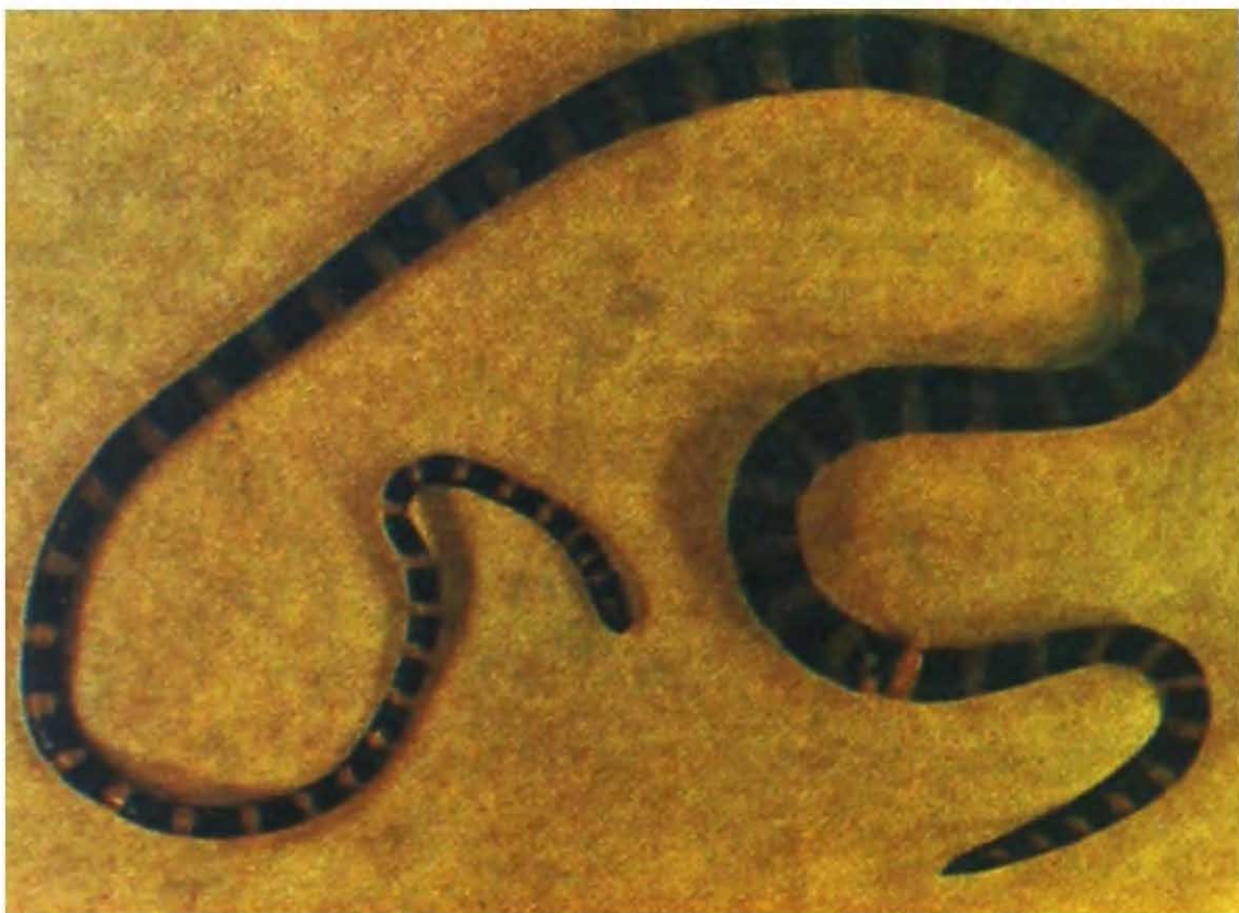
Fig. 7. Estuarine sea snake, Hydrophis obscura .

Colouration : Variable; the young are more distinctly coloured than the adults as is the case with most of the sea snakes. The juveniles are bluish-black or black, with from 35 to 55 bright yellow bars, which encircle the body on the hinder part. The adult is of a uniform greyish or bluish colour above