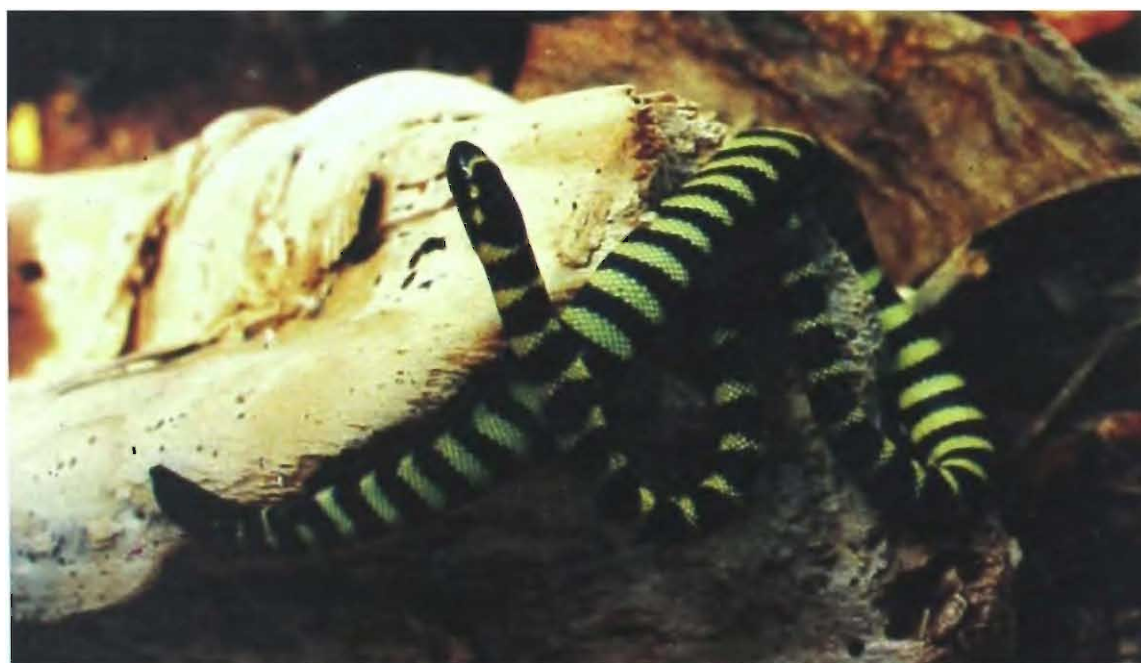
Fig. 5. Common small-headed Sea Snake.

Distinctive features : Body shape and head shields to those of H. cantoris except second upper labial touching prefrontal and there are five or six upper labials. Scale rows at midbody 29-43; ventrals 220-350.