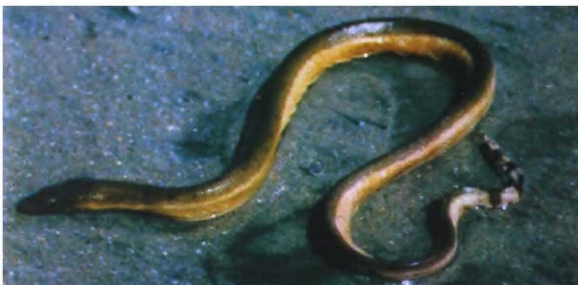
Fig. 10. Black and yellow sea snake, Pelamis platurus .

Distinctive features : Head long, narrow, distinct from rather slender neck; shield entire; nostrils superior, nasals in contact with one another; one or 2 pre – and 2 or 3 post oculars; two