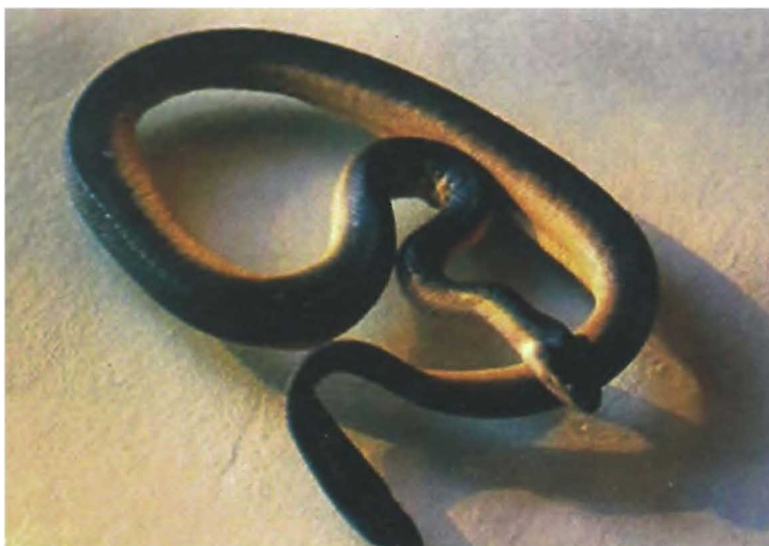
Fig. 13. Viperine sea snake, Thalassophis viperina .

Distinctive features : Head- short and not very wide, shields entire; nasal shields subtriangular, as long as broad; one (rarely 2) preoculars); 1-2 postoculars; 7-9 supralabials, the 3rd to the 5th, or only two of them, in contact with the eye ; two anterior or 3-4 posterior temporals; seven or eight lower labials. Body thick, laterally compressed posteriorly, covered with scales