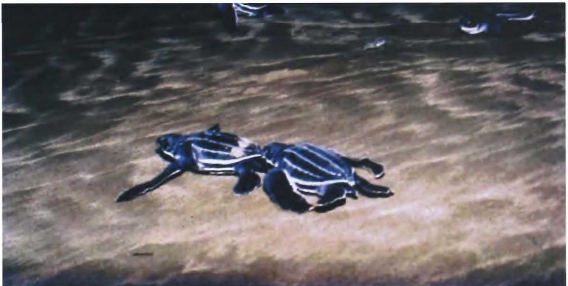
Fig. 1. Leatherback sea turtle, Denmochelys coriacea . Hatchlings.

Distinctive features : The only sea turtle that is devoid of an outer covering of horny shields and instead, has a leathery skin. The most remarkable feature of the torpedo-like shell is that the ribs and vertebrae are free from the exoskeleton and the carapace, which consists of numerous small, separate polygonal plates, is covered or lined with thick leathery skin, an unusual feature distinguishing the leathery turtle, necessitating the