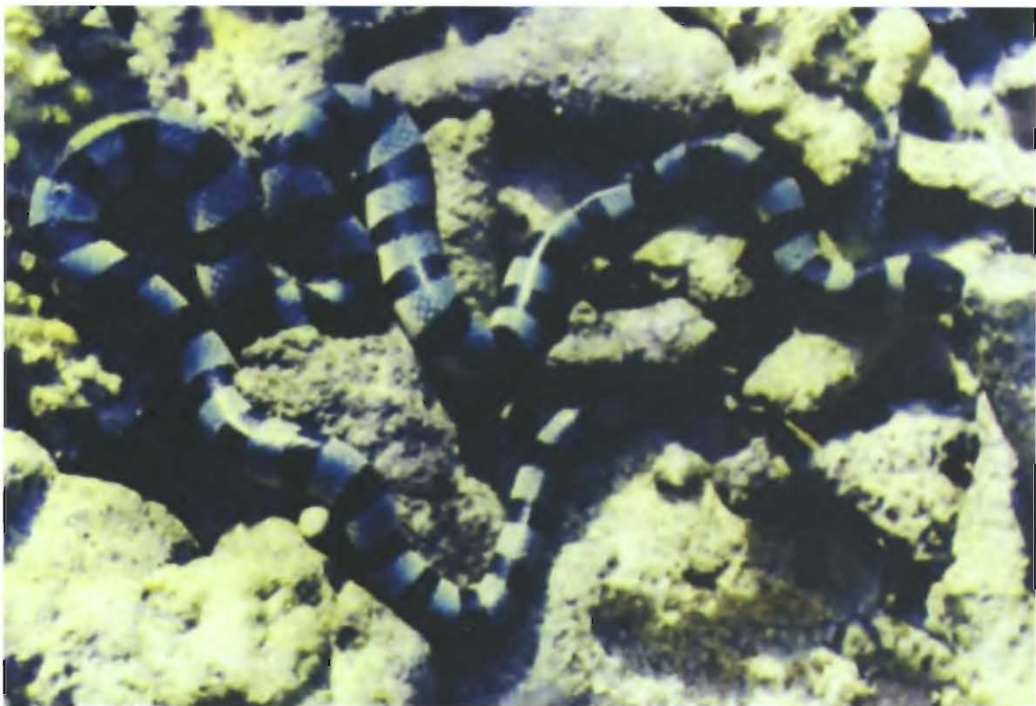
Fig. 15. Black Banded sea krait, Laticauda laticaudata .

Colouration : Light or dark bluish-grey above, with numerous black bands round the body; belly yellowish. Head black, with a curved yellow mark above, the colour sometimes, extending forwards to cover the entire snout and downwards, crossing over the eye to the upper lip; a median, elongated yellow patch below the lower jaw.