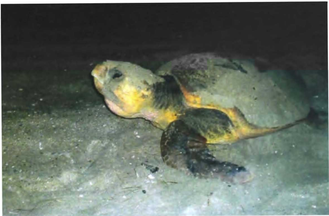
Fig. 4. Loggerhead sea turtle, Caretta caretta .

Distinctive features : The loggerhead is distinguished from other sea turtles by its large, massive head, which gives the turtle its common name, broad, short neck and the complete ossification of the carapace in the adult. The shields of the carapace imbricate only in the young, but in the adult they become smooth and juxtaposed. The large head is armed with very strong hooked jaws, with a median prominent ridge on the upper beak. The head is not retractile. The flippers bear a pair of