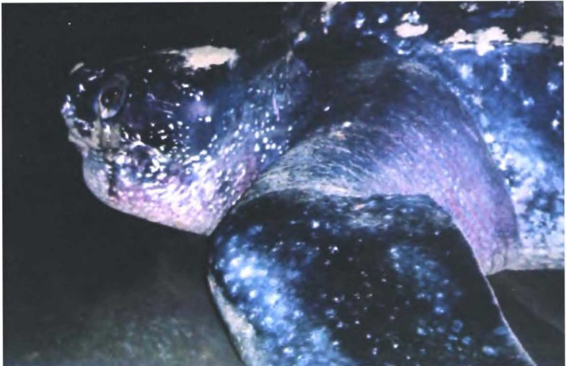
Fig. 3. Close-up of head of the Leatherback sea turtle showing the white spots.

The breeding habits are similar to that of the other sea turtles, described in detail (see section II). In conformity with the distribution of these creatures, the time of breeding is not the same everywhere. Though these turtles generally nest at night, a few instances of their nesting during the day have been reported