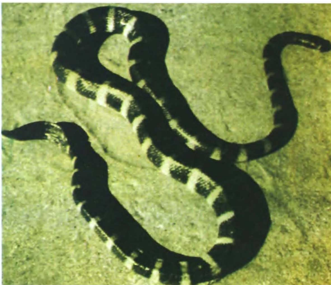
Fig. 6. Bombay Sea Snake.

Distinctive features : Head small; scarcely distinct from neck, which is rather slender and much elongated in adult ; one pre – and 2 postoculars; 2 (anterior) +3 (posterior) temporals; 7 or 8 supralabials, 2 nd in contact with the prefrontal, 3 rd and 4 th in contact with the eye; 4 lower labials in contact with the genials. Eye moderate. Body slender anteriorly, much compressed posteriorly; scales in 35-43 rows at the midbody, the posterior more or less hexagonal in shape, feebly imbricate or juxtaposed, with central tubercle or short keel; ventrals 302-390, distinct throughout, not twice as the adjacent scales, and each one with two keels.