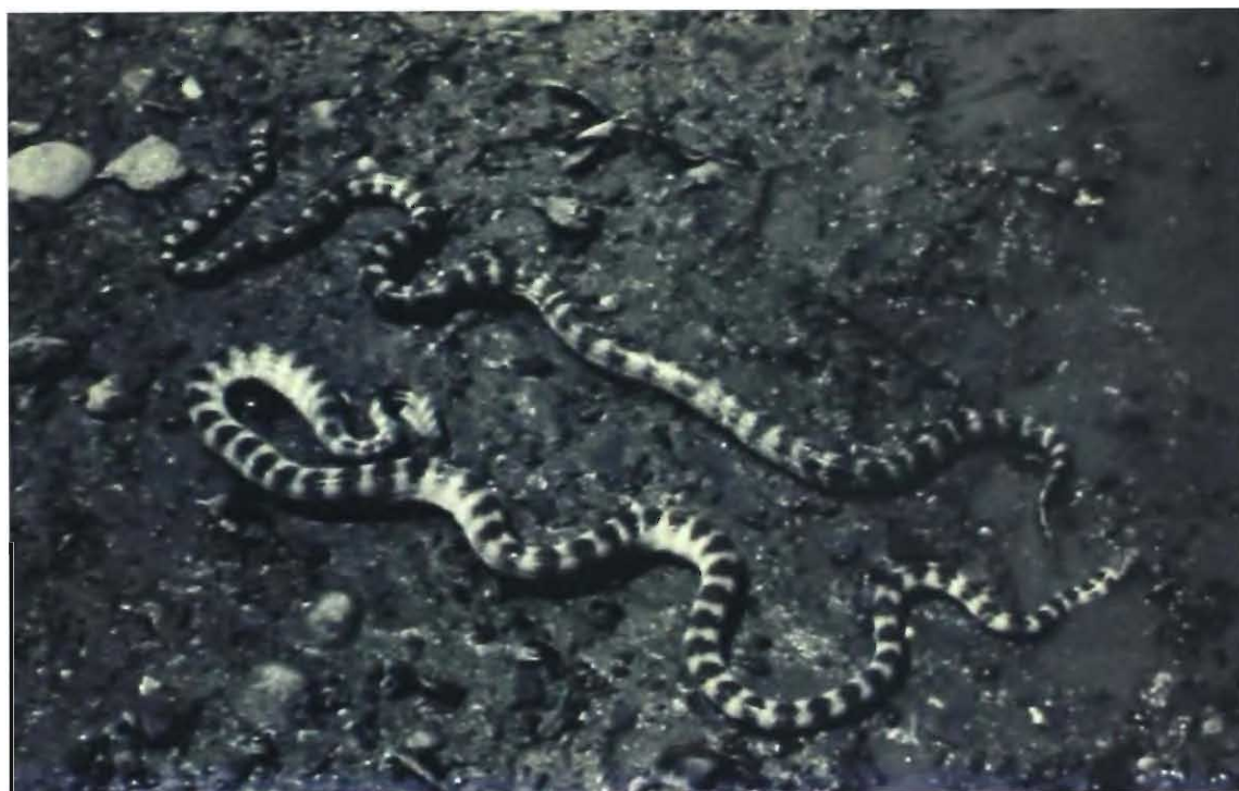
Fig. 3. Annulated sea snake, Hydrophis cyanocinctus . Juveniles.

Distinctive features : Head moderate, slightly distinct from neck; 1 pre and 2 postoculars ; 2 anterior temporals, placed one