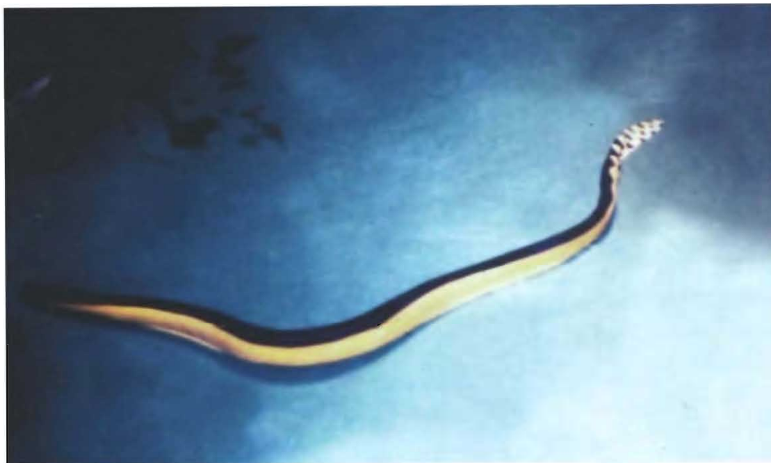
Fig. 12. Black and yellow sea snake, Pelamis platurus .

(occasionally three) anterior temporals and 2-4 posterior temporals; 6 to 8 supralabials, 4th and 5th below the eye, usually separated from it by suboculars; nine to 13 lower labials. Eye moderate.