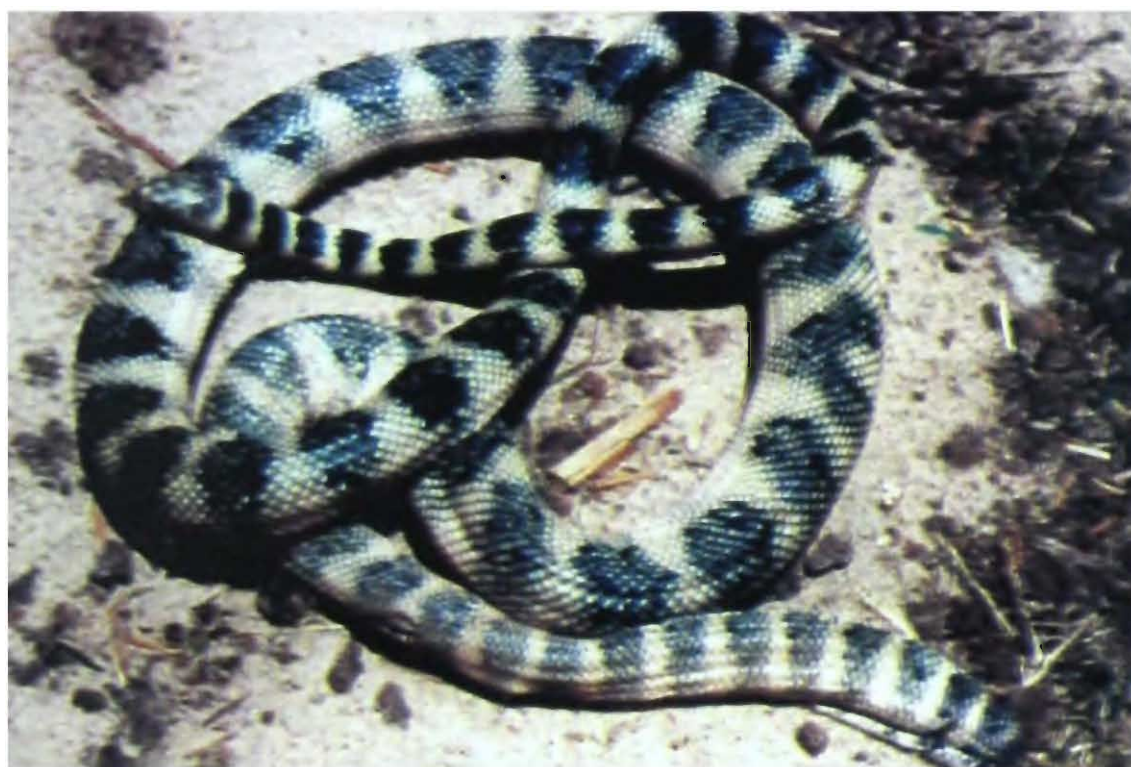
Fig. 4. Annulated sea snake. Adult.