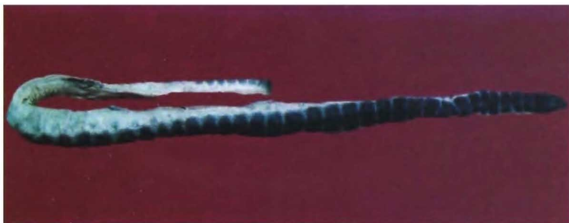
Fig. 14. Banded sea krait, Laticauda colubrina .

Distinctive features : Body cylindrical, slightly compressed, of almost uniform width throughout except towards the head. Head shields entire; nostrils lateral; nasal shield separated by the internasals; one preocular and 2 postoculars; 7-8 supralabials, the 3 rd and 4 th touching the eye; temporals 1+2; five infralabials in contact with genials.