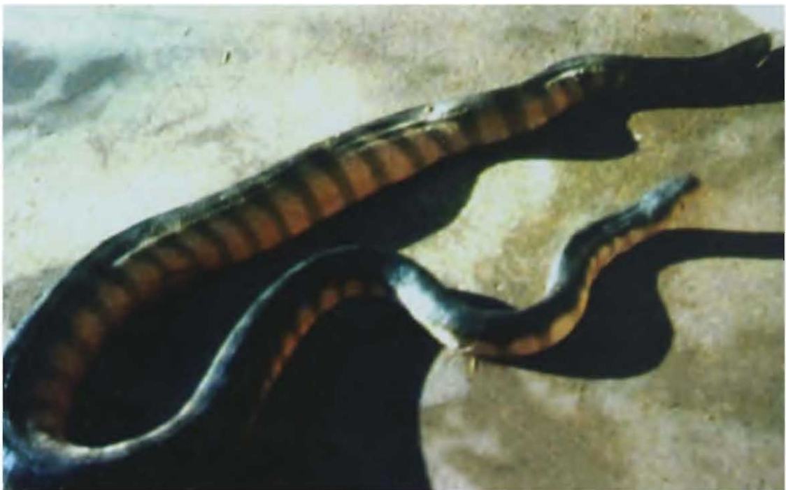
Fig. 1. Common sea snake, Enhydrina schistosus . Juvenile.

Scales keeled and overlapping, in 49-60 rows in males, and in from 51-66 rows in females; ventrals 239-322 (rarely 354), a little broader than the adjacent scales, each one with two keels; preanals feebly enlarged.