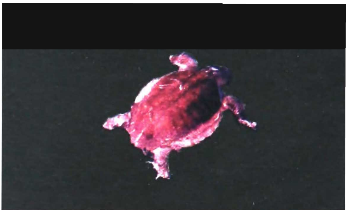
Fig. 7. Olive ridley sea turtle, Lepidochelys olivacea . Hatchling.

This sea turtle nests in large numbers on the coasts of India, between November and February on the east coast and during the summer and monsoon months on the west coast. The