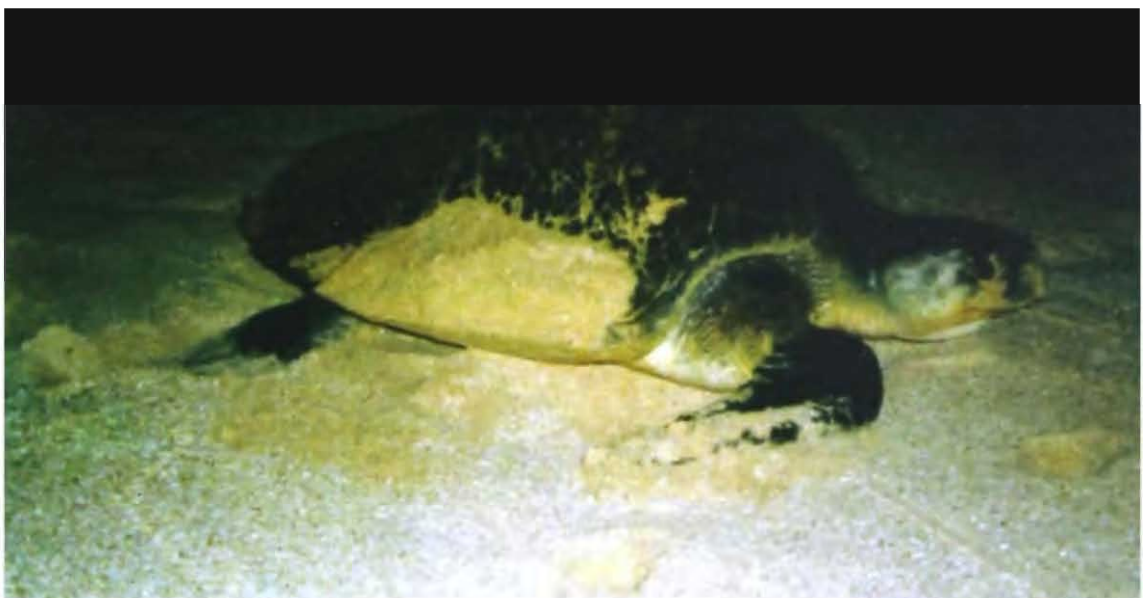
Fig. 5. Green turtle, Chelonia mydas .

Colour Although it is called green turtle because of its greenish fat, this species is actually light to dark brown in colour, the shields with a pattern of irregular, olive-coloured streaks. The plastron is yellow. The young are olive or dark