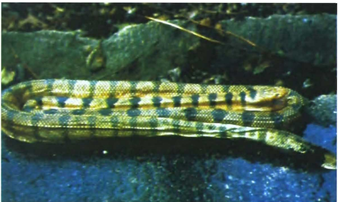
Fig. 8. Yellow sea snake, Hydrophis spiralis .

Colouration : The ground colour is golden yellow to yellowish green, encircled by 44-48 more or less complete dark rings which are widest at the midbody and becoming narrower on flanks and ventrally; the scales in the light areas are margined with black; the belly both in the juvenile and adult is yellowish; tail banded, and with an irregular black patch near the tip. The head is uniformly yellow in the adult, blackish, with a yellow horseshoe-shaped mark in the young, which in addition may have a median black line.