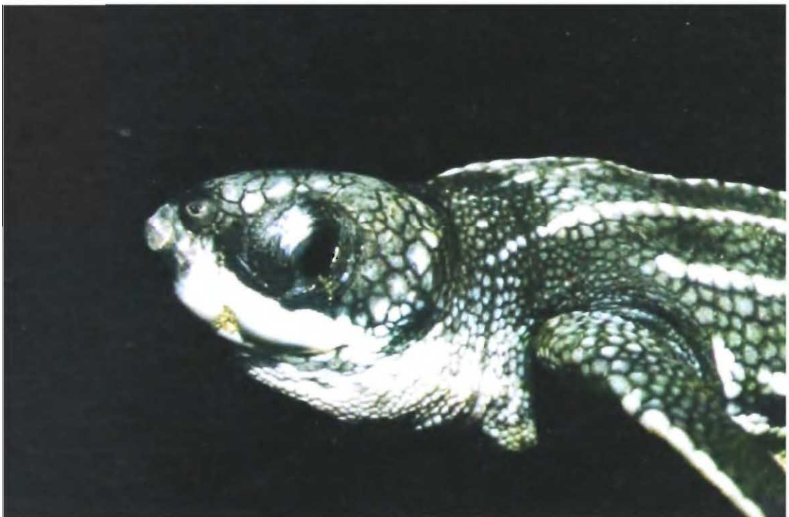
Fig. 2. Close-up of head of the Leatherback sea turtle showing the longitudinal ridges.

Size The largest of all the Chelonians in existence, some giants reaching a total length of two metres and beyond, and an estimated weight exceeding 900 kg.