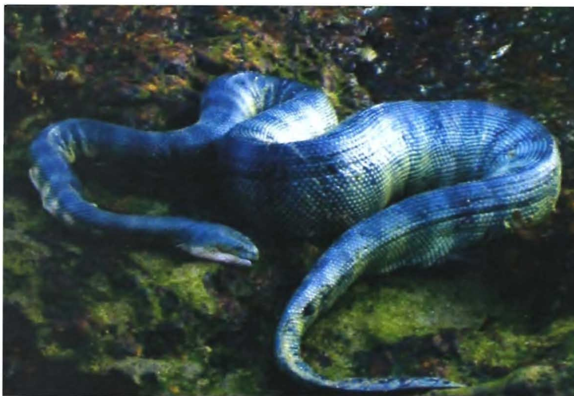
Fig. 2. Common sea snake. Adult.

Venom : The common sea snake is responsible for a considerable number of deaths attributed to the bites of sea snakes. Though sea snakes do not secrete large quantities of