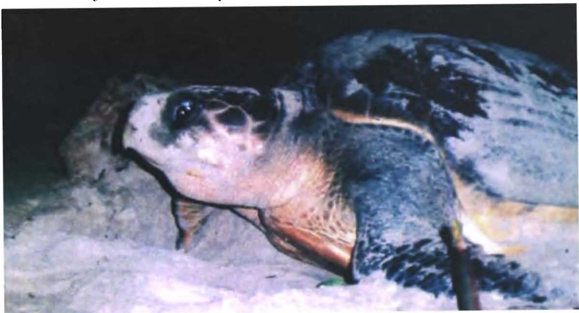
Fig. 6. Hawksbill sea turtle, Eretmochelys imbricata .

Vernacular names Gujarati – Daryani moti kachabi; Hindi – Kanga kachua; Oriya – Bada thantia kachha; Tamil – Alunk amai; Nanja aamai; Seep amai.